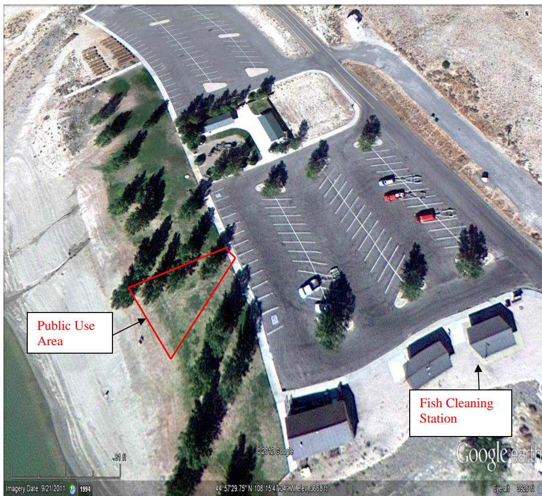
Figure 1 Horseshoe Bend Public Assembly Area