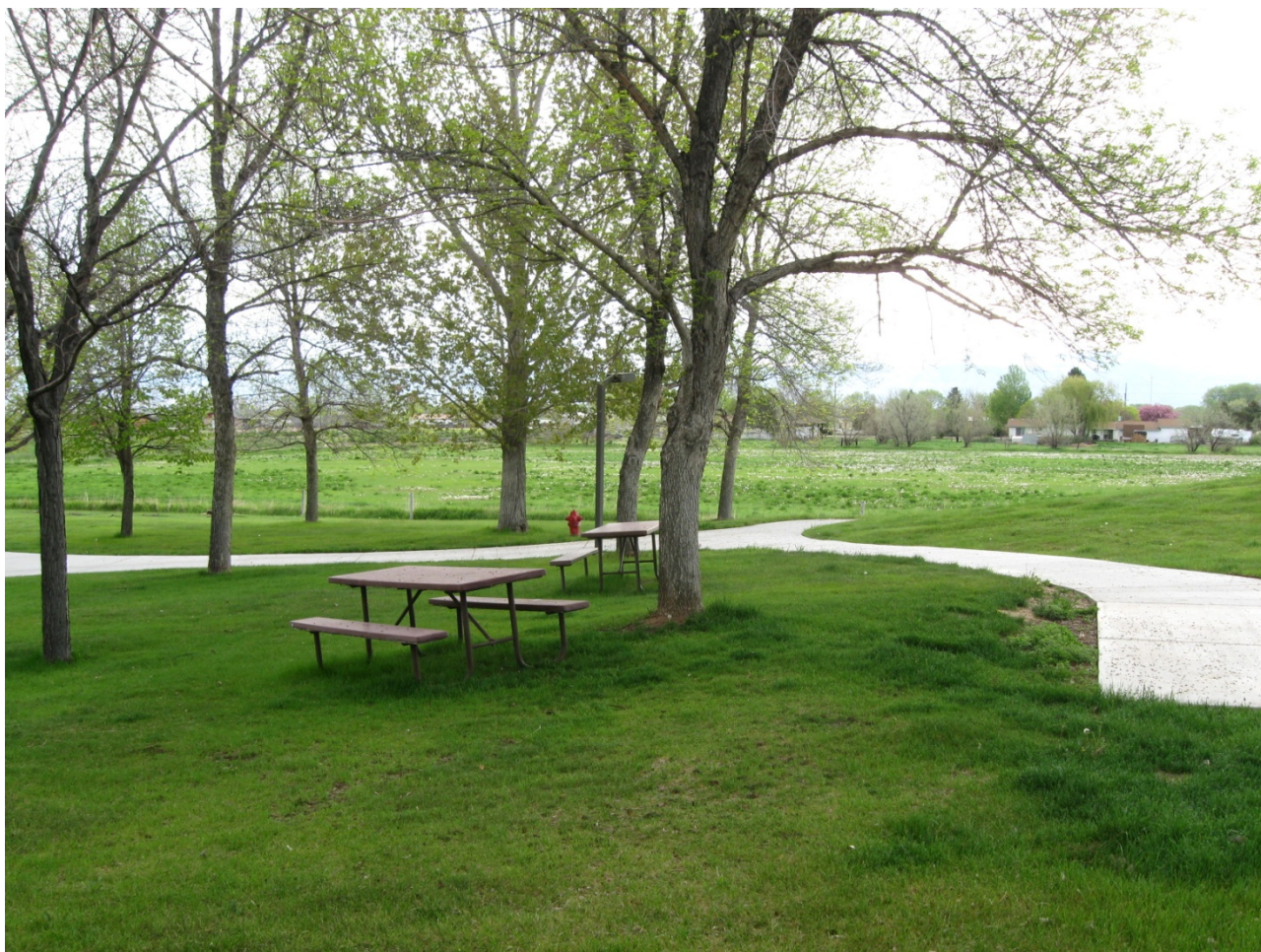
Figure 6 Lovell Visitor Center Sale and Printed Material Distribution Area