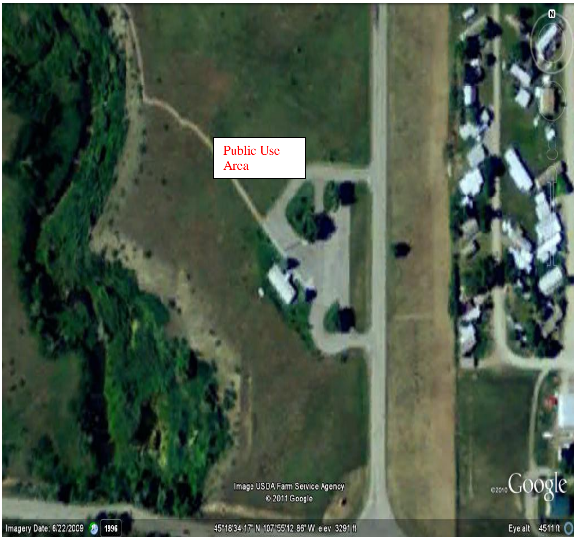
Figure 4 Afterbay Public Assembly Area