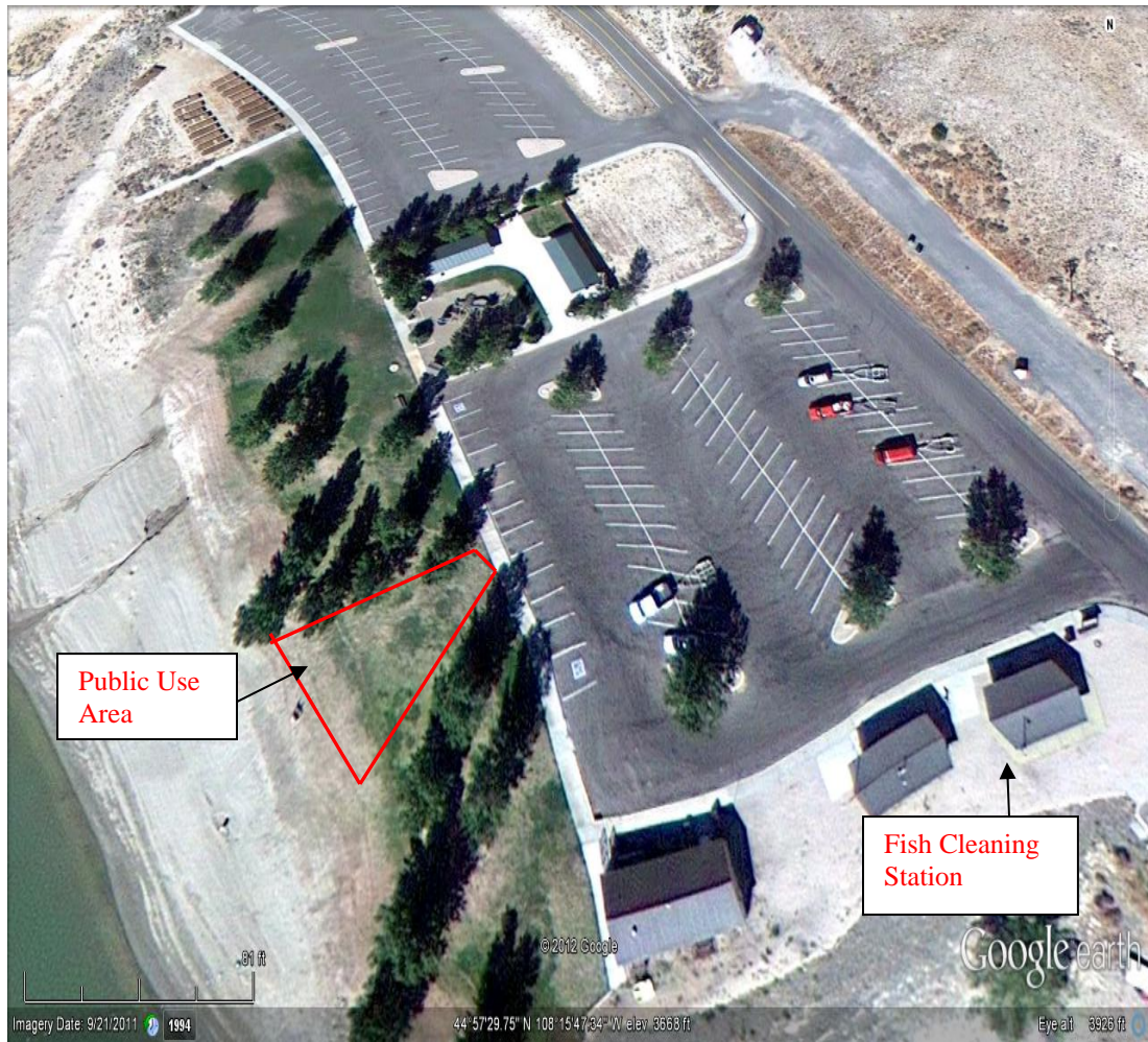
Figure 5 Horseshoe Bend Sale and Printed Material Distribution Area