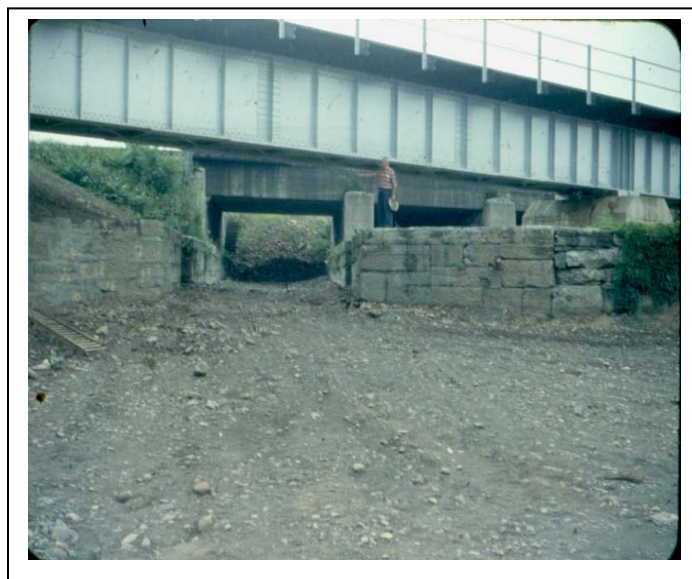
A canal boat passes under railroad bridge in Cumberland, MD. Today, the dry remnants of the canal exist.