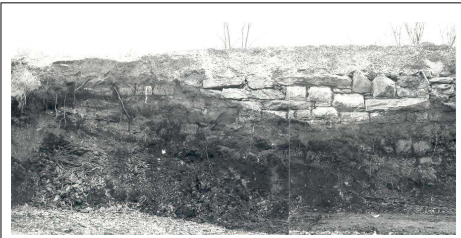
Canal Parkway Wall.