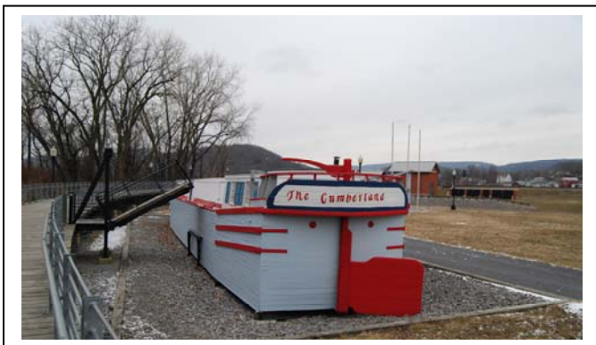
A replica of the canal boats is on display near Canal Place.

Once the EA is developed, it will be made available for a 30-day public review period.