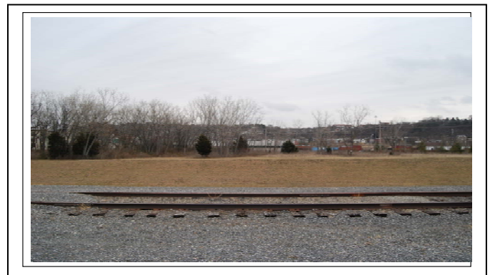
A spur to the CSX Railroad (formerly B&O Railroad) crosses by the former canal boat building site.