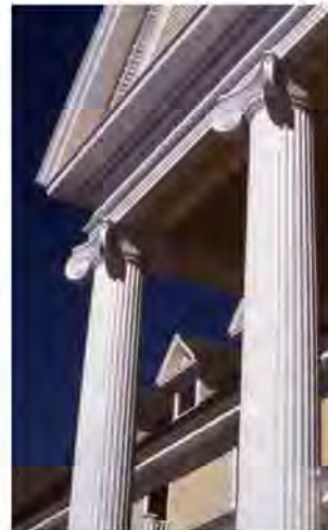
Yellowstone National Park's Lake Area is characterized by tranquility and a sense of history.