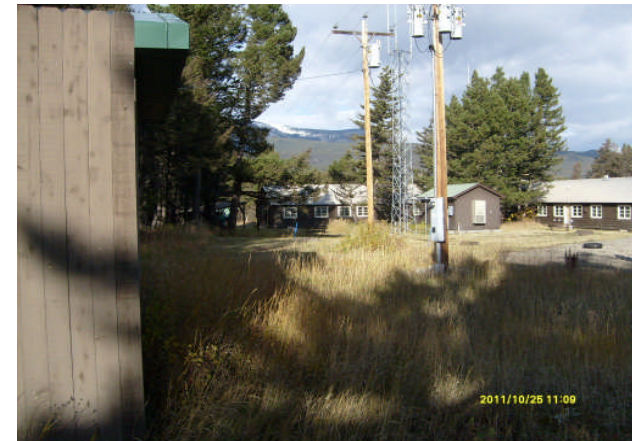
Proposed Tower Location in St. Mary