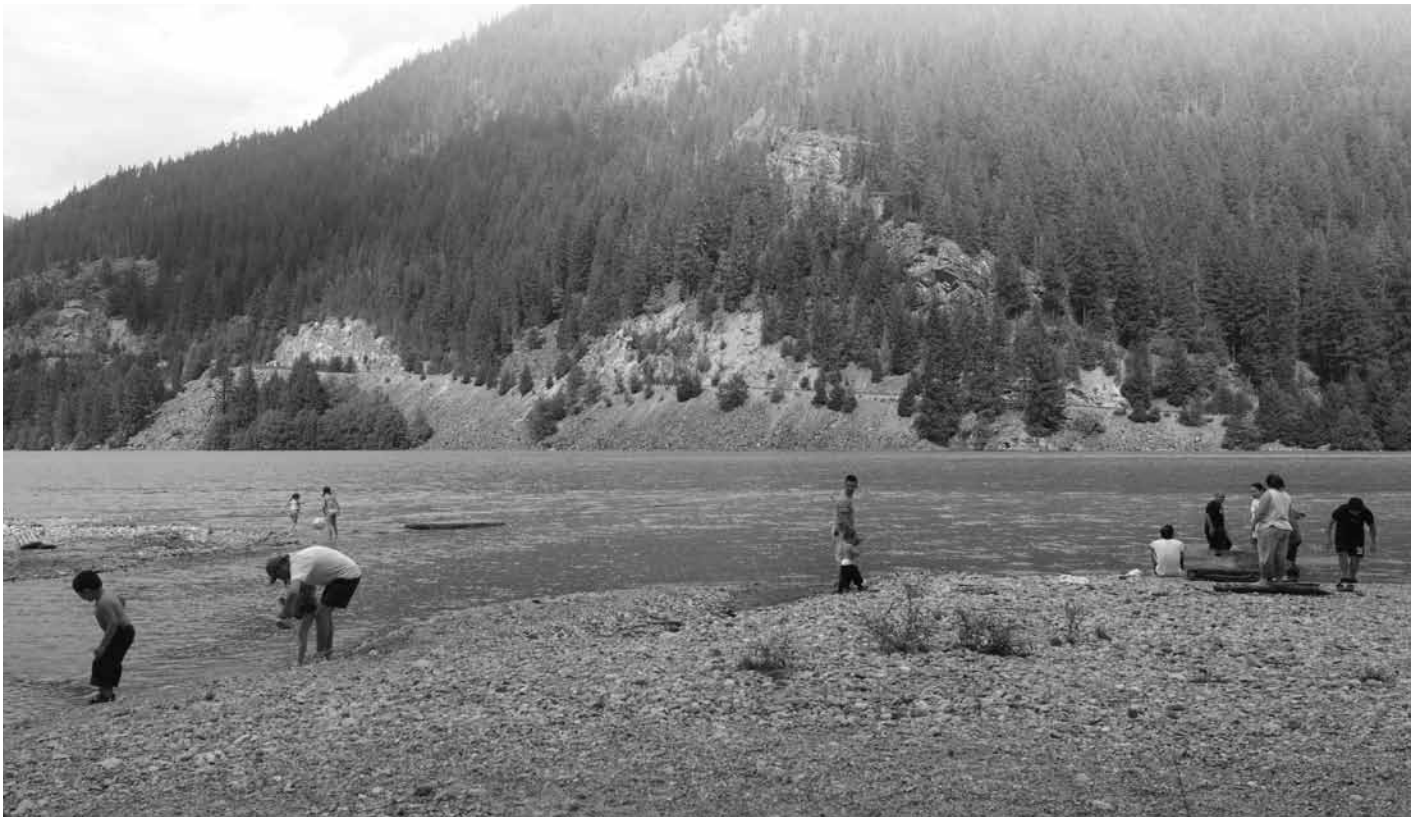
Visitors explore the shoreline of Diablo Lake.

Alternative C would emphasize the role of Ross Lake NRA in preserving the greater North Cascades ecosystem, which includes two additional National Park System units, two national forests, and provincial parks and protected areas across the Canadian border. Management and education efforts would focus on broader ecosystem preservation and enhancement through coordinated regional and international environmental stewardship. The focus of visitor experiences would be linked to solitude, tranquility, natural soundscapes, and scenery through traditional outdoor activities. The NPS would actively work to reduce habitat fragmentation throughout Ross Lake NRA by consolidating development, eliminating certain trails, and limiting construction of new facilities in undeveloped areas. A new reservation system for permits would allow