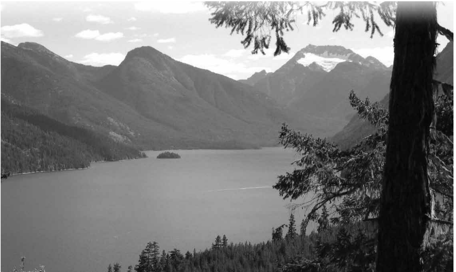
View of Ross Lake from Little Beaver Trail.

On a broader scale, the North Cascades ecosystem is experiencing change that could dramatically and irreversibly alter the long-term health of the ecosystem. Factors that are contributing toward this change are: climate change, introduced species, habitat fragmentation, air pollution, loss of pre-