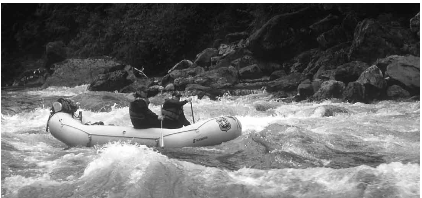
Rafting on the Skagit River.

This alternative contains the most Frontcountry zoned areas, including the entire North Cascades Highway corridor, Diablo Lake, Hozomeen, and areas near Ross Dam.