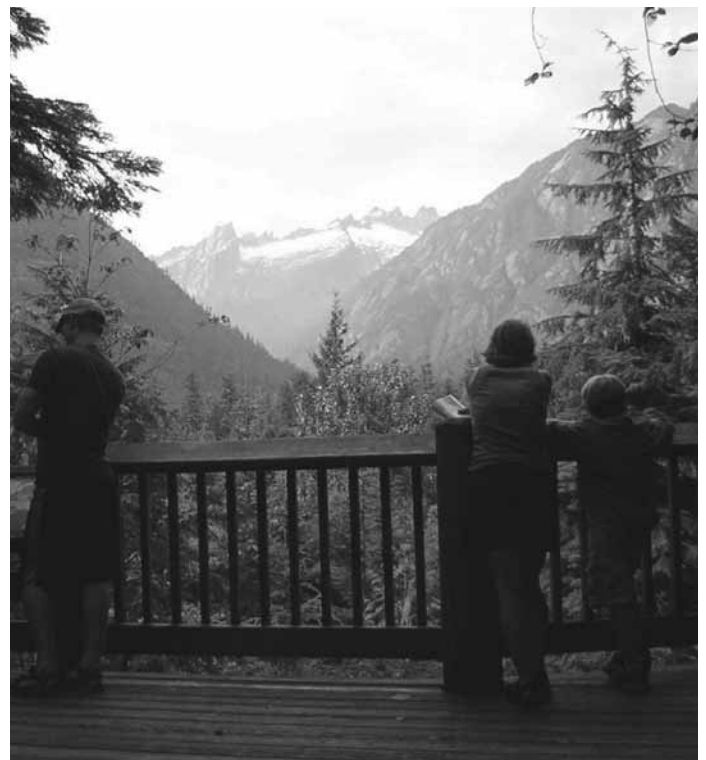
Visitors enjoy a view of the Picket Range.

The following discussion summarizes impacts of all alternatives considered, in accordance with the National Environmental Policy Act.