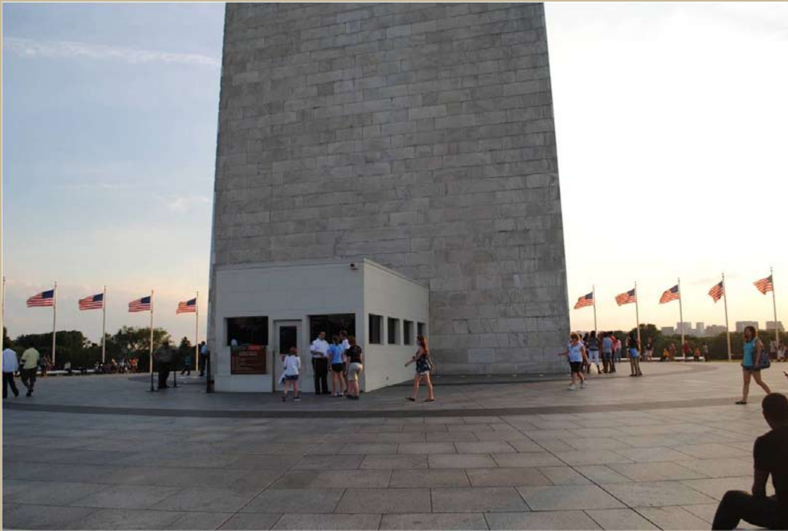
Temporary visitor screening facility

In 2002, the NPS completed a design for the Washington Monument Permanent Security Improvements that included a comprehensive landscape solution for a perimeter vehicular barrier system and a new screening facility. However, only the vehicular barrier system and a portion of the landscape design were implemented. The NPS is currently revisiting the feasibility of a new entrance and visitor screening facility and the removal of the existing temporary facility. These proposed actions are the subject of this EA and are explored in several alternatives.