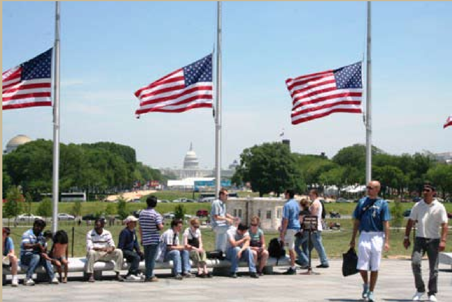
Visitors waiting to enter the Monument.