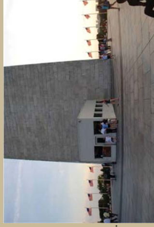
Temporary visitor screening facility

In 2002, the NPS completed a design for the Washington Monument Permanent Security Improvements that included a comprehensive landscape solution for a perimeter vehicular barrier system and a new screening facility. However, only the vehicular barrier system and a portion of the landscape design were implemented. The NPS is currently revisiting the feasibility of a new entrance and visitor screening facility and the removal of the existing temporary facility. These proposed actions are the subject of this EA and are explored in several alternatives.