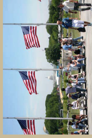
Visitors waiting to enter the Monument.