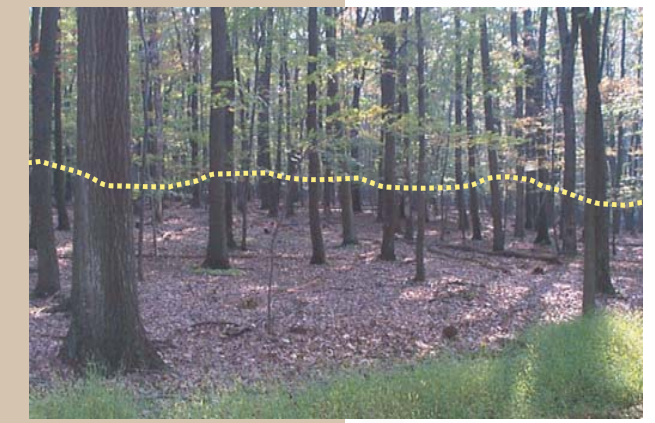
Deer browse line is evidence of deer impacts to vegetation.

Educate the public on the deer population, forest regeneration process and biotic diversity, and the role of deer as part of a functioning park environ, not the primary driving force within it.