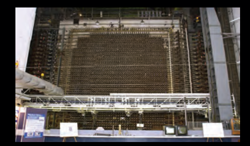
Reactor Front Face

The National Park Service would have a presence at this location and would provide technical assistance for historic preservation to identified community-based historic resources in the Hanford/Tri-Cities area.