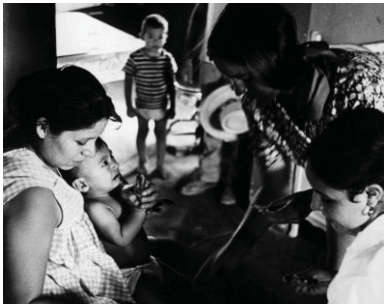
Calexico Clinic field workers give a test for anemia in a family's home, 1972.