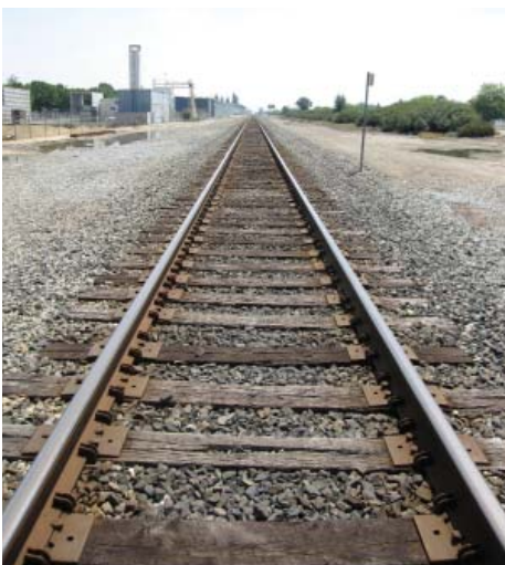
March route