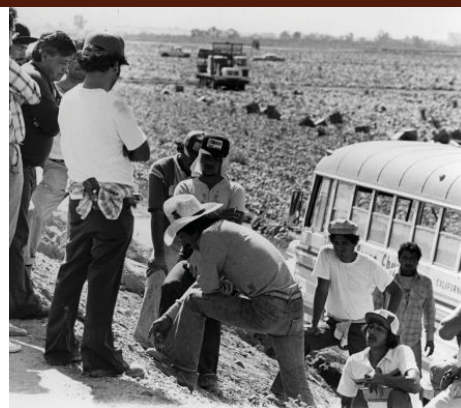
Cesar Chavez speaks with workers in a field in Arizona, c. 1982.

Many of the sites that the NPS has preliminarily identified as significant are privately owned; others are publicly owned and provide community services. Many of the above management options are compatible with continued private and/or local ownership and use of these sites. Support from property owners and the community is a key aspect of the feasibility of any management options that are considered. Different recommendations may be made for different sites; however we anticipate that the vast majority of the significant sites identified through this study will remain in their present ownership and use.