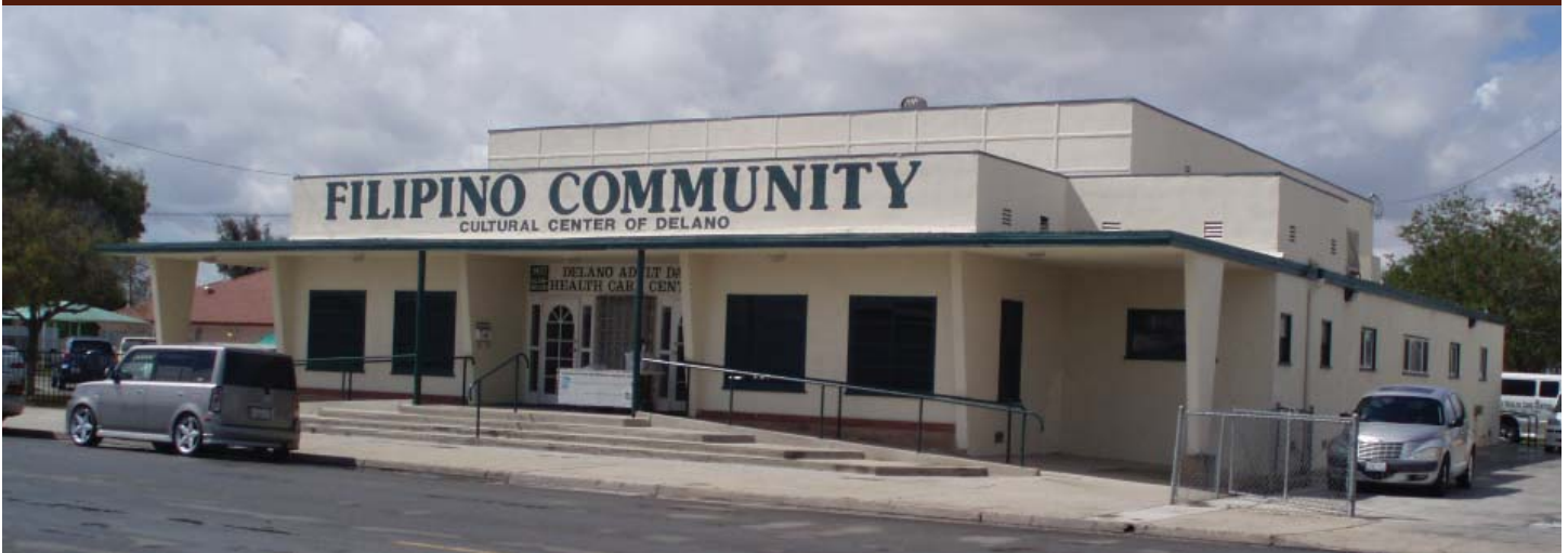
Filipino Community Hall, Delano, CA.

A special resource study is a National Park Service (NPS) study of specific areas or natural or cultural resources to recommend whether they are eligible to be designated as a unit of the national park system, and to consider a range of approaches to resource protection and public use and enjoyment.