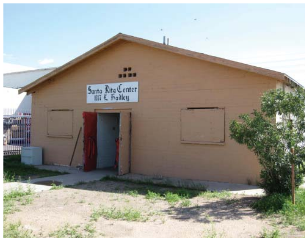
1. Dormitory Building at La Paz, Keene, CA, NPS photo. 2. Santa Rita Center, Phoenix, AZ, NPS photo.