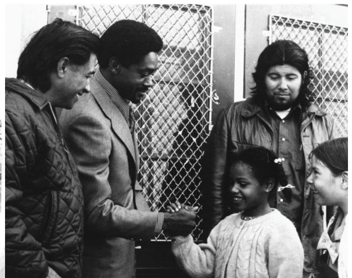
1. Police stand watch as a Grape Strike demonstration passes by in Coachella Valley, CA, 1973. 2. Cesar Chavez and Bobby Seale (of the Black Panthers) gave a press conference on 1972 in Oakland, CA, and then met students from Malcom X Elementary School in Berkeley, CA.