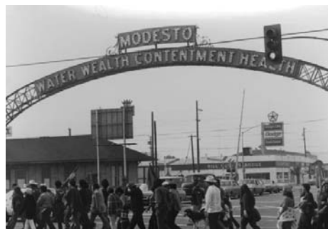
A United Farm Workers' demonstration in Modesto, CA, c. 1970s