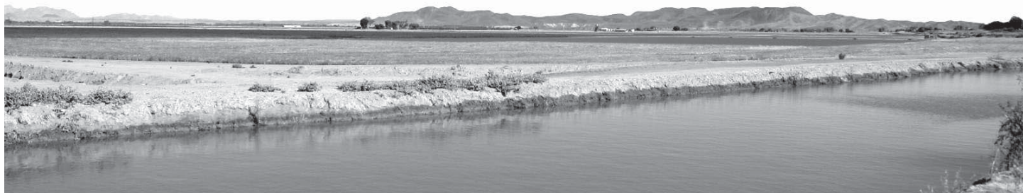
Canal near the Chavez Family Homestead site, Arizona, NPS photo.