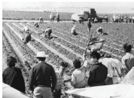
Striking farm workers hold a demonstration on a lettuce field, Salinas, CA, 1970.