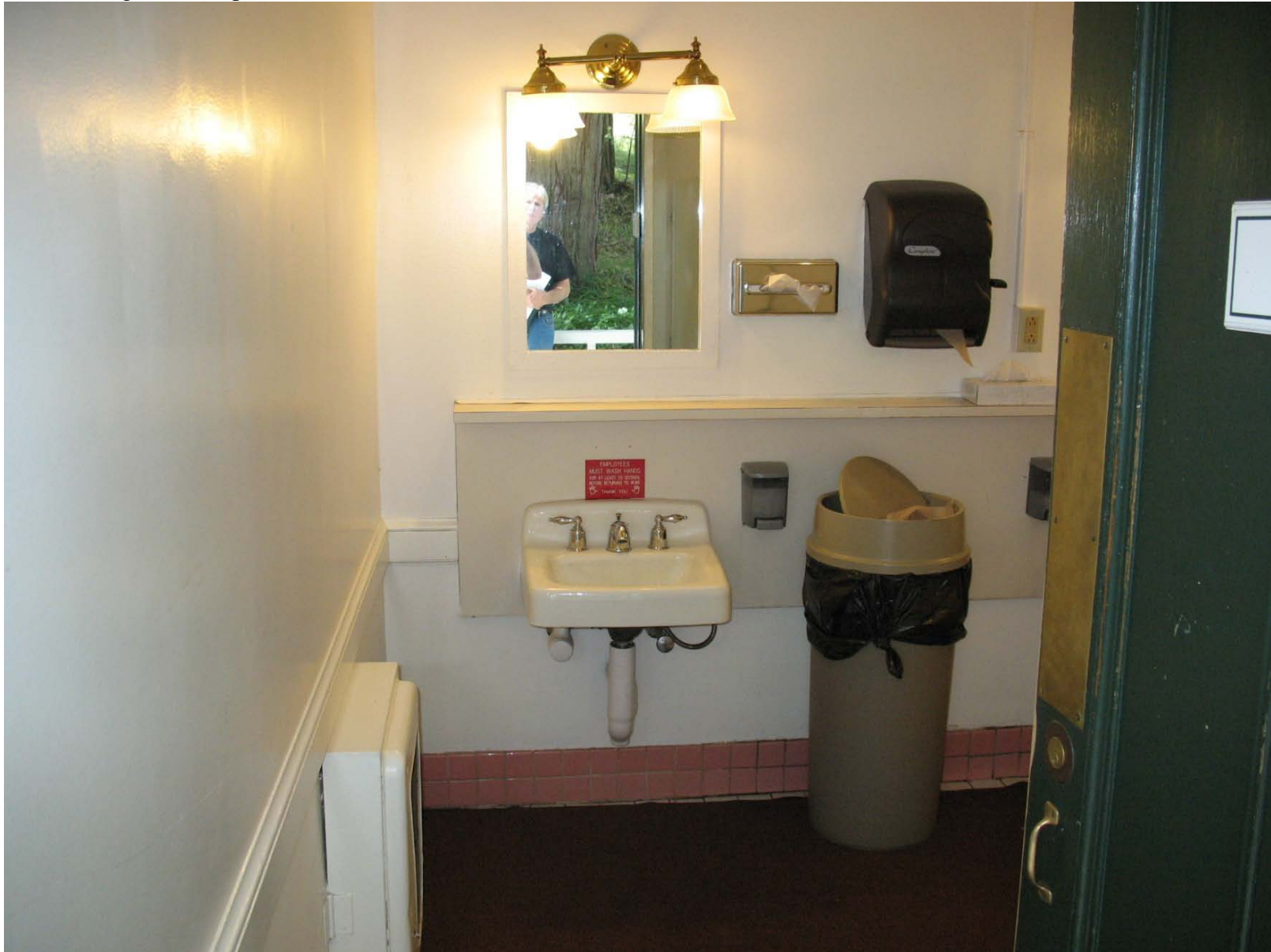
Current Men's Restroom