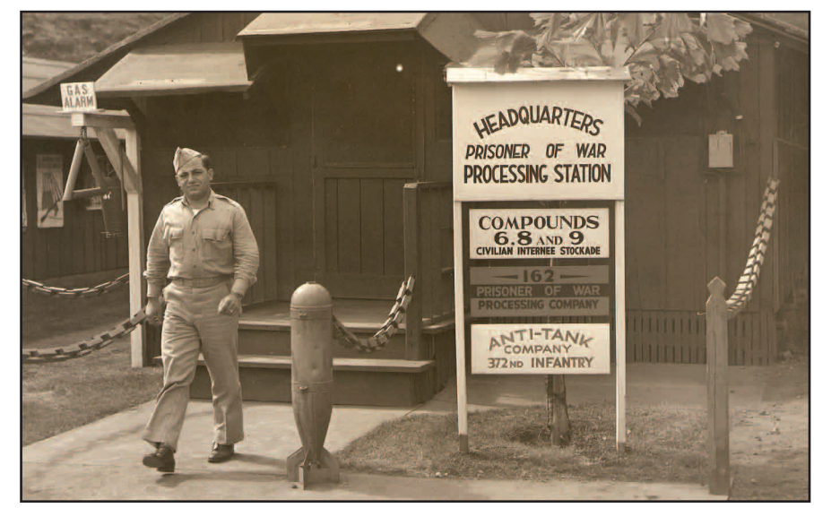
Honouliuli Internment Camp, R.H. Lodge photograph, courtesy of Hawai'i's Plantation Village.

Website: http://www.nps.gov/pwro/honouliuli