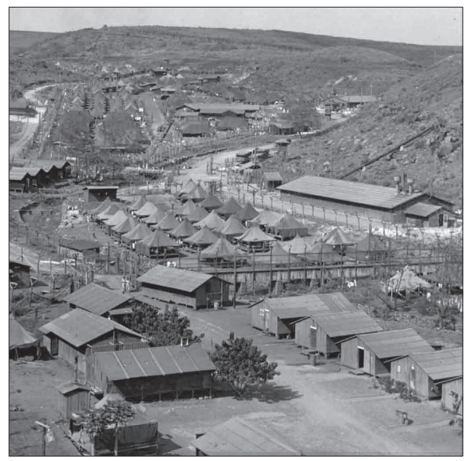
Honouliuli Internment Camp, R.H. Lodge photograph, courtesy of Hawai'i's Plantation Village.

Map Provided By: PWR Inforrmation Coordination and Management - Honolulu February 22, 2011; Map Drawing# 963-106843