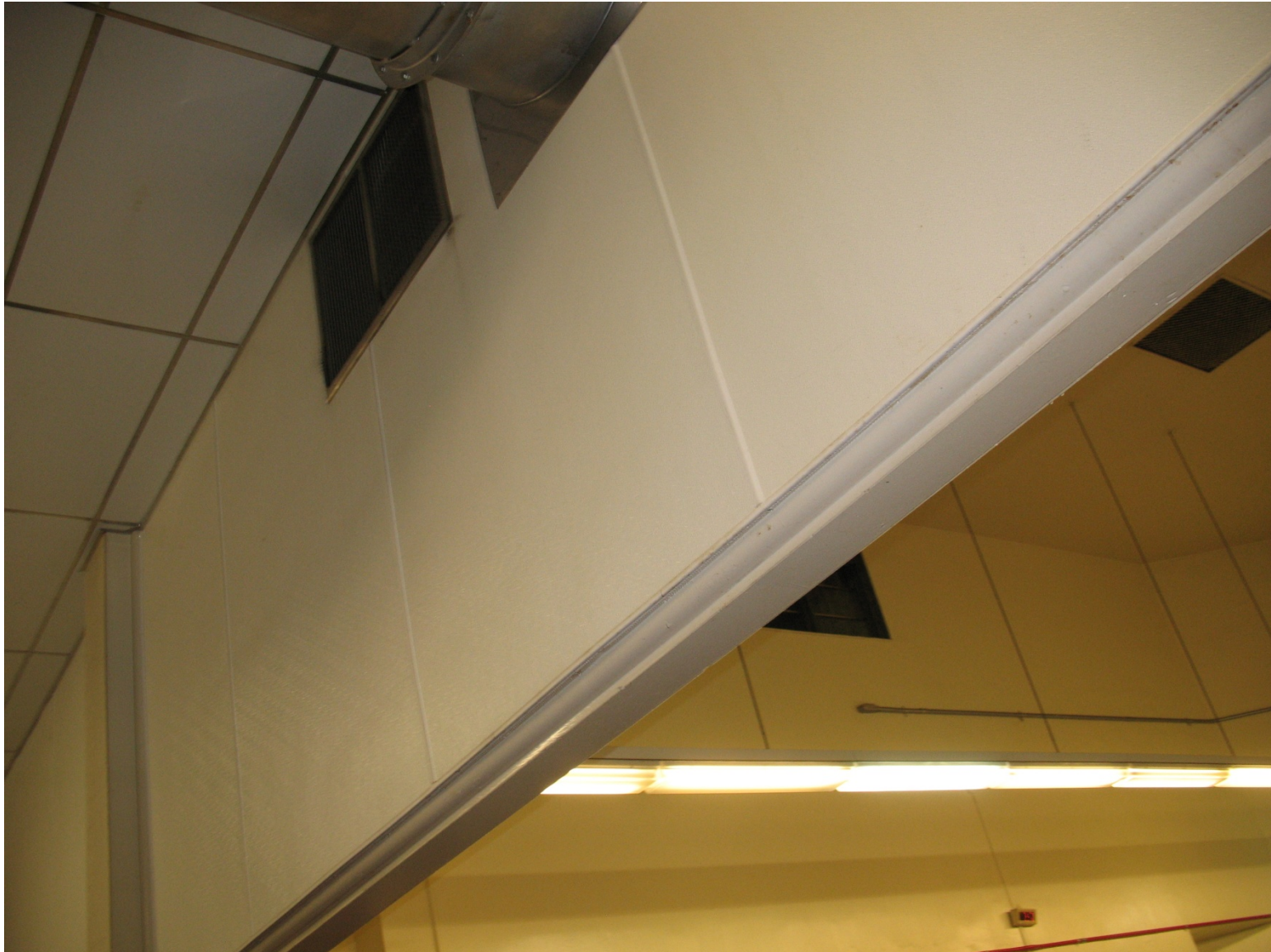
Example of FRP panel installation