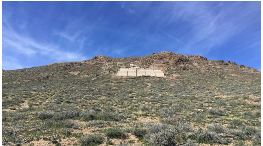
Figure 1 - View of Homestake Mill looking west.

The National Park Service (NPS) is investigating the abandoned Homestake-King Mill Site (Site) in Death Valley National Park to evaluate cleanup options. The Site covers approximately 5 acres and consists of the remnants of the Homestake-King Mill (Figure 1), including a series of five reinforced-concrete foundations that are between 66 and 100 feet long, 3 feet thick at the base, and up to 16 feet high. The structures are located on a steep slope. Floors of the mill rooms, machinery, vat foundations, and building debris remain on Site. The mill tailings are visible near the mill and several locations downslope from the mill. The Site is located in the Bullfrog Hills, in the Nevada portion of Park known as the “Nevada Triangle”. Access to the Site is via Pioneer Road, off of Highway 374 (Figure 2).