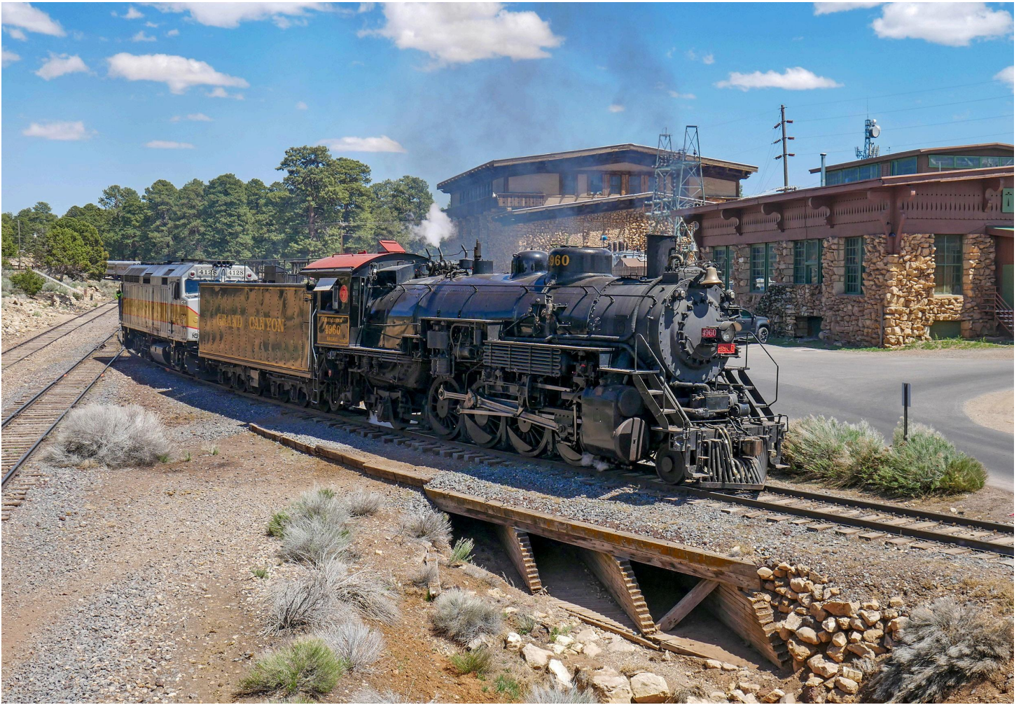
A steam train passes over the wooden ballast bridge above Bright Angel Wash.