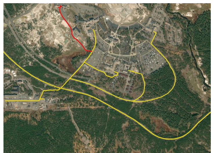
Figure 6, Page 10: Old Faithful Zoom View

<u>Replace the "Old Faithful Zoom View" map with the inset map below</u>: The original proposal included a fiber segment spur running from the west Old Faithful parking lot to the Lower General Store and Yellowstone Park Service Station (identified by the red line below). This segment would have traversed the Myriad thermal group located to the south of the Old Faithful Inn. In order to avoid any potential impacts to the thermal area, the park has instructed the applicant to remove this segment from the project. Although this revision may temporarily impact point of sales transactions for concessionaires located in the Lower Store and Service Station, other, less intrusive telecommunications equipment could be installed to provide better connectivity to those operations. However, any equipment beyond what is mentioned in the EA would require additional compliance in accordance with NEPA and other applicable laws, as necessary.