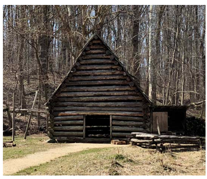
Figure B-6 Existing Structure #6