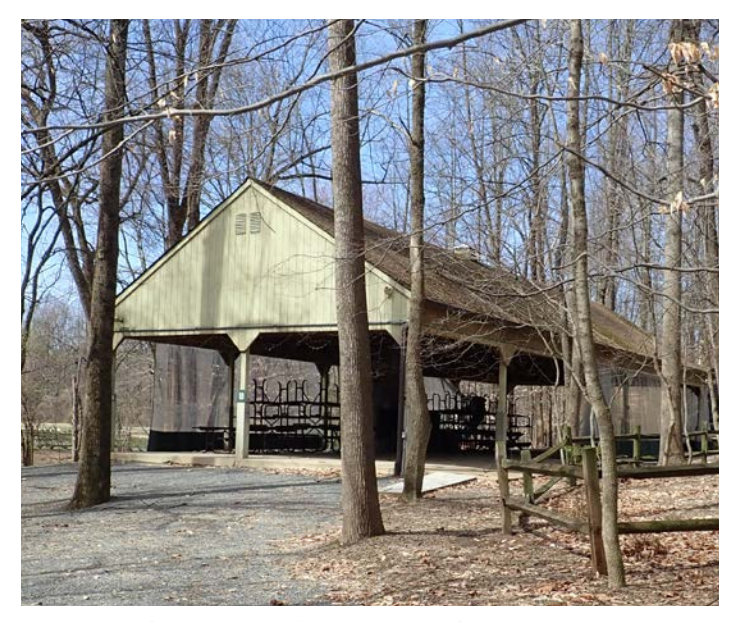
Figure B-8 Existing Structure #8