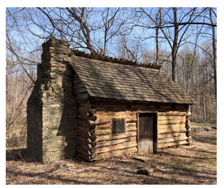
Figure B-5 Existing Structure #5