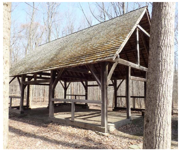
Figure B-1 Existing Structure #1

Existing structures referenced throughout the Concept Plan are identified below.