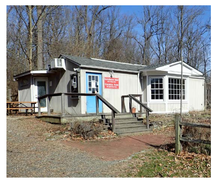
Figure B-7 Existing Structure #7