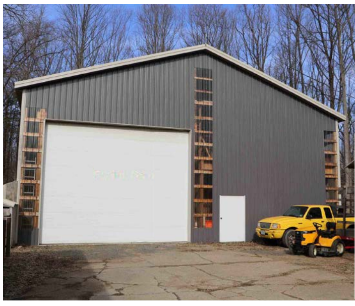
Figure B-2 Existing Structure #2