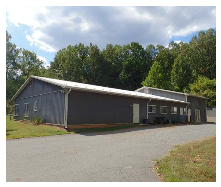
Figure B-3 Existing Structure #3