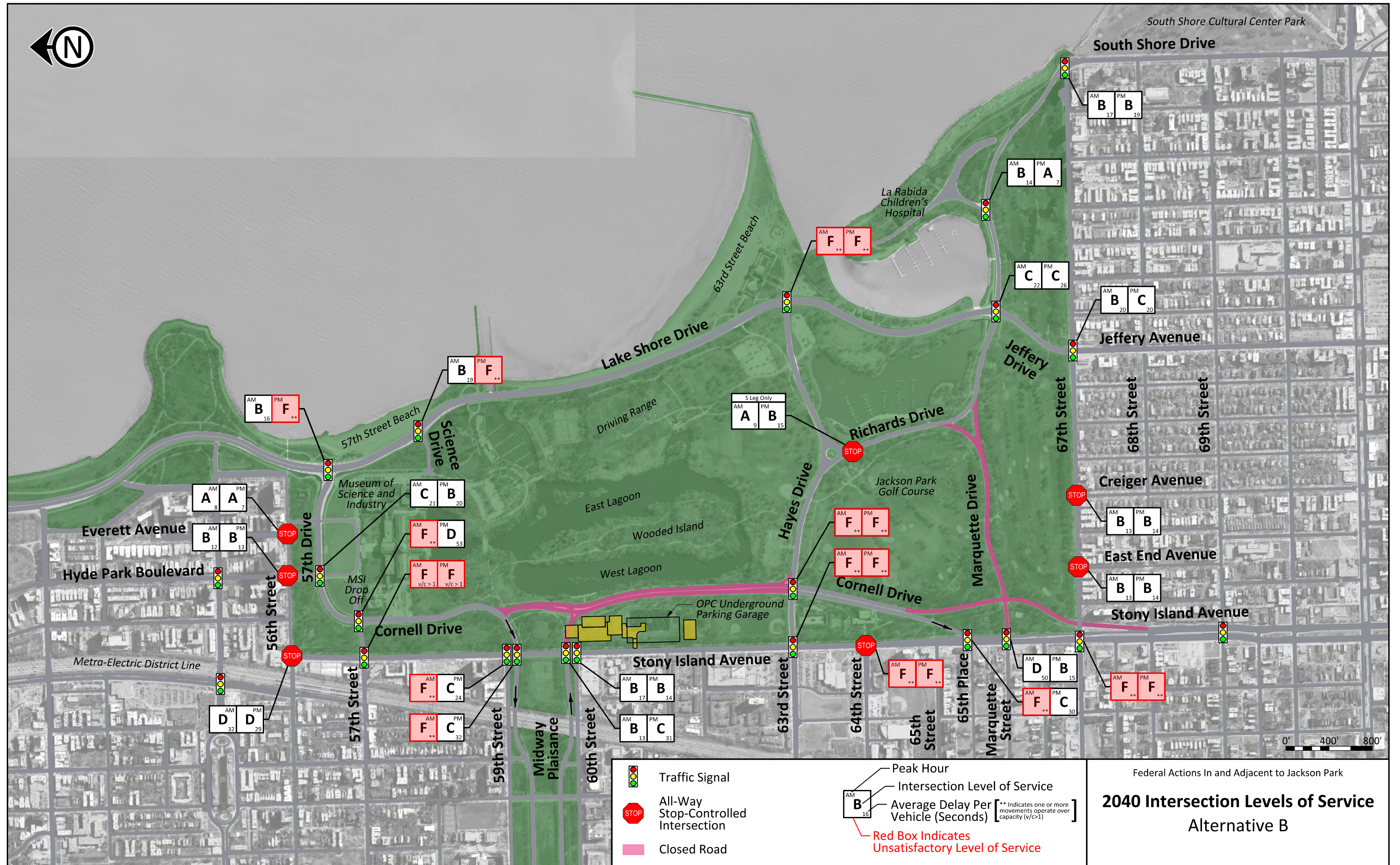
Federal Actions In and Adjacent to Jackson Park 2040 Intersection Levels of Service Alternative B