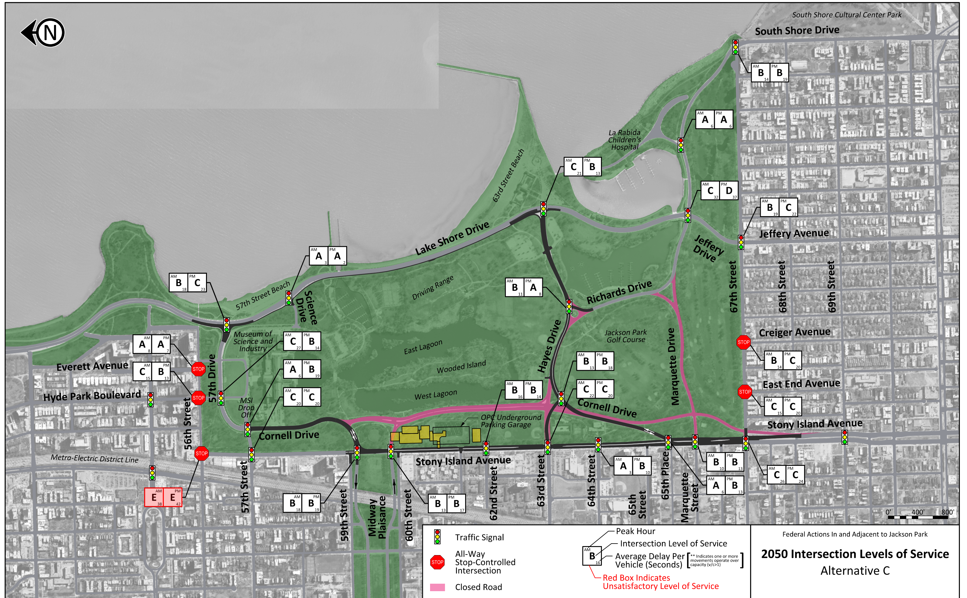
Federal Actions In and Adjacent to Jackson Park 2050 Intersection Levels of Service Alternative C