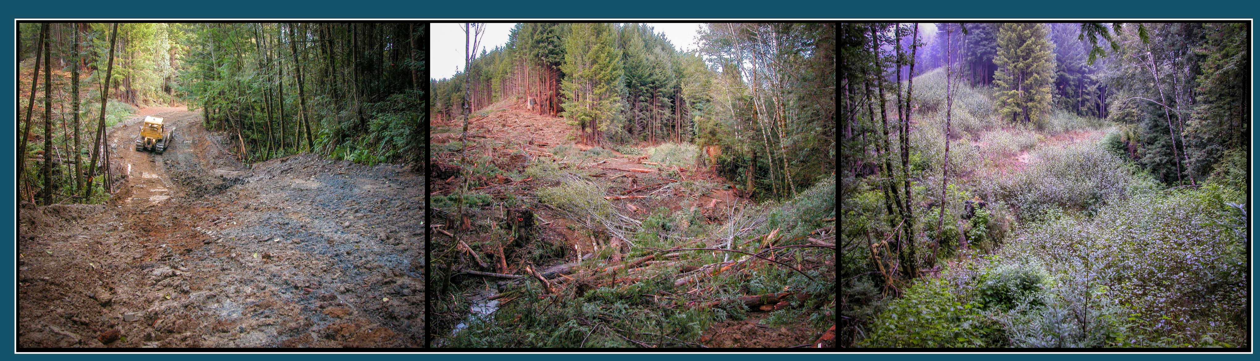
Larry Dam Road Removal Project: crossing excavation in 2003 and regrowth in 2007