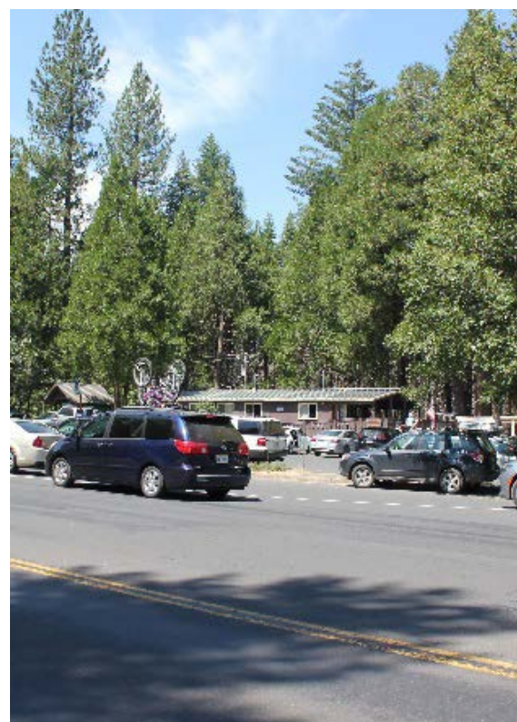
View of traffic congestion at the existing Big Oak Flat Welcome Center Complex.

Information on this project and other projects is available at: https://www.nps.gov/yose/getinvolved/planning.htm