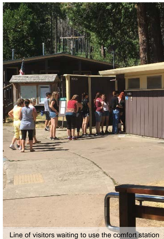
Line of visitors waiting to use the comfort station