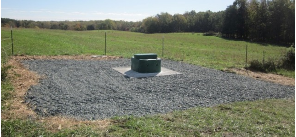
Proposed watering-trough type—including color, concrete-pad, and gravel-surround—proposed for installation at northeast end of new buried-pipe at Ionia.