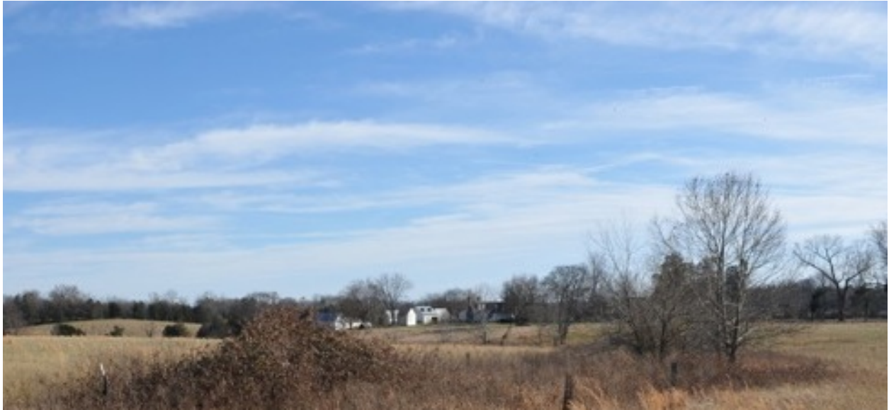
Ionia, looking southeast towards house and showing one of the swales/wildlife areas (foreground and right-middleground) proposed for protection with new fencing.