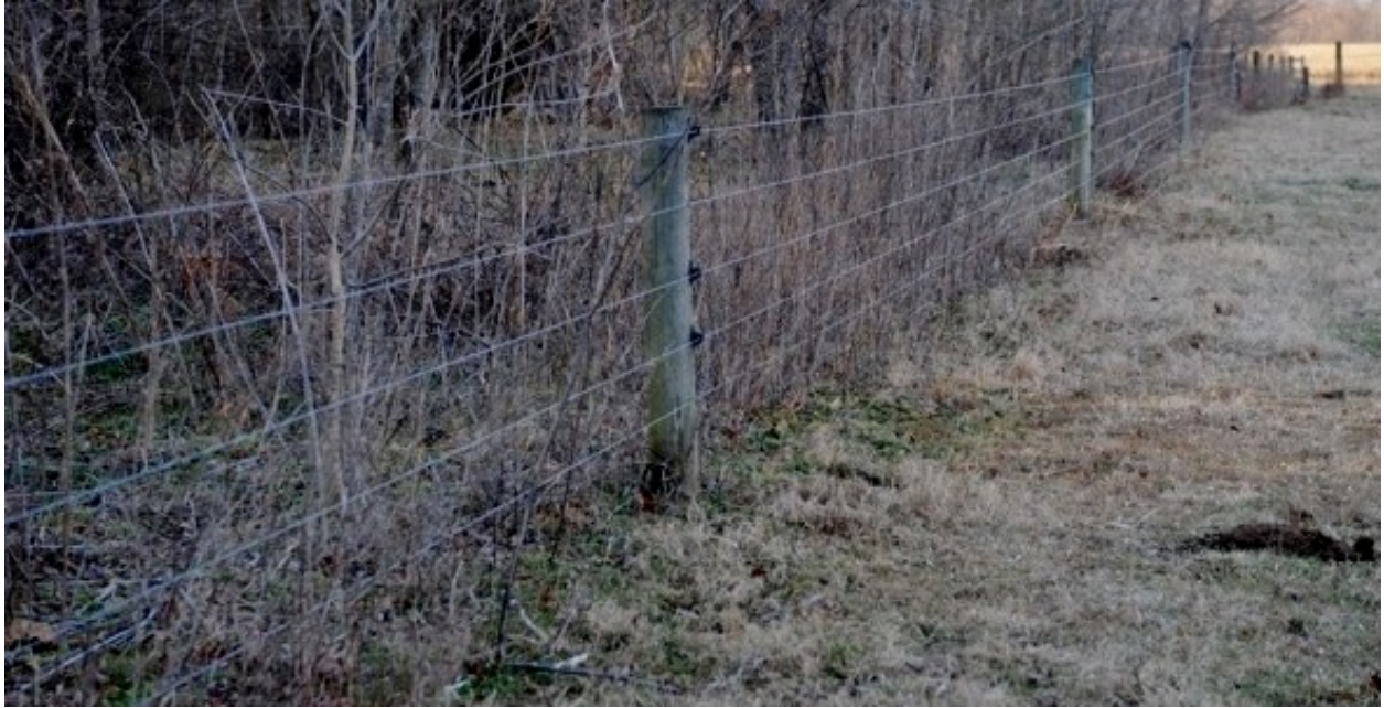
Existing post-and-rail fencing at Ionia; post-and-rail is also the type of the proposed new fencing.