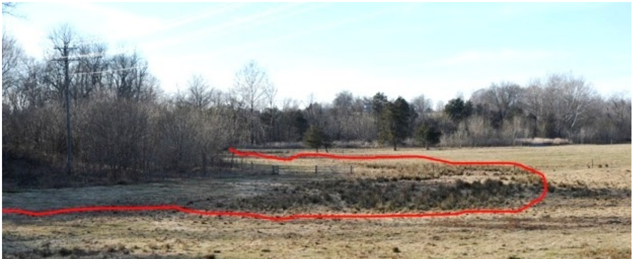
Pasture at Ionia, looking northwest and showing one of the wetlands/wildlife areas proposed for protection with new fencing (red line).