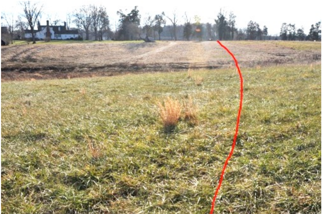
Ionia, looking southwest along general route (red line) of proposed buried pipe, towards site of proposed well and pump. House at left.