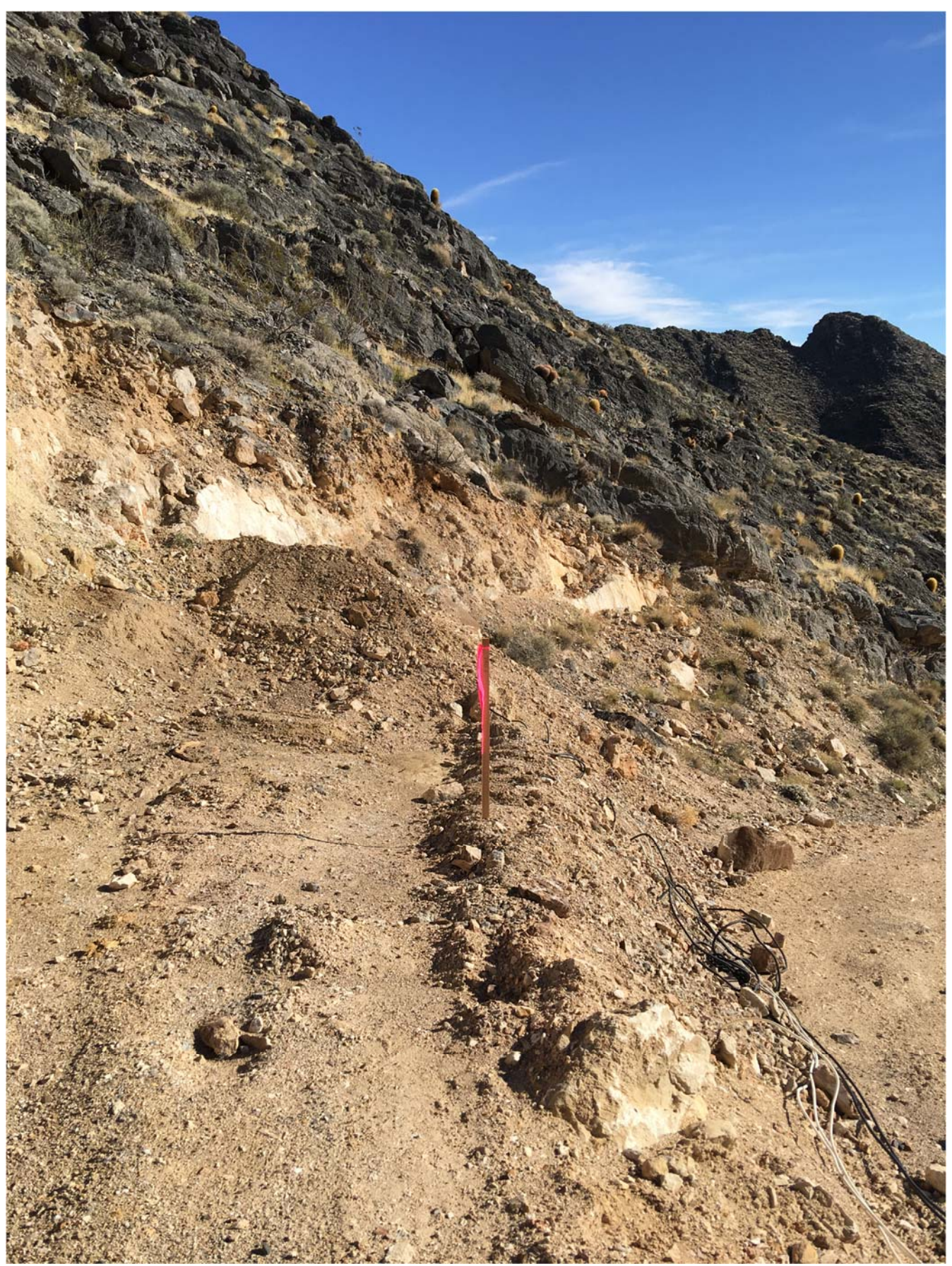
Drill Pad 4