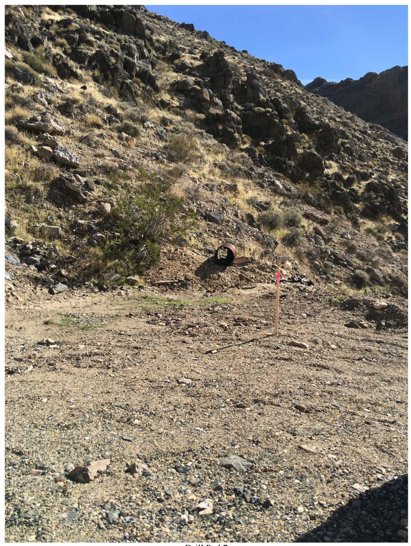
Drill Pad 7