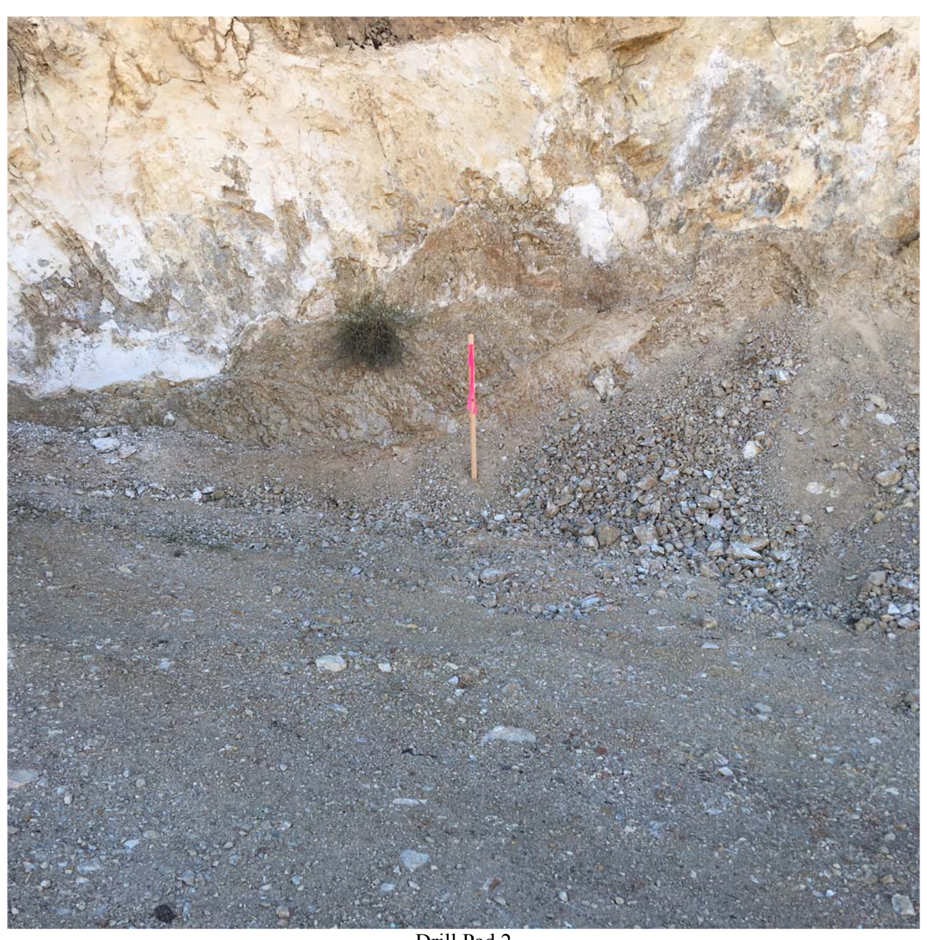
Drill Pad 2