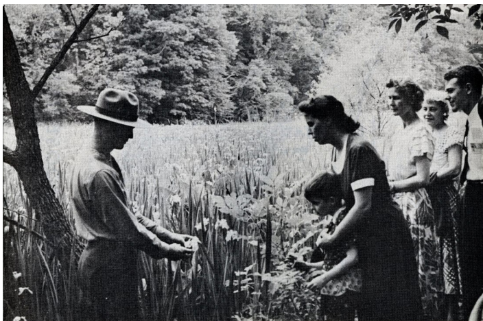
1955, Naturalist and Tour Group