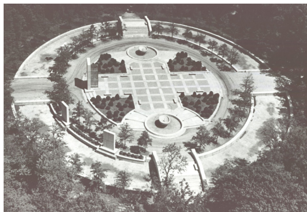
1967, Theodore Roosevelt Island Memorial (White House. via TR Center)