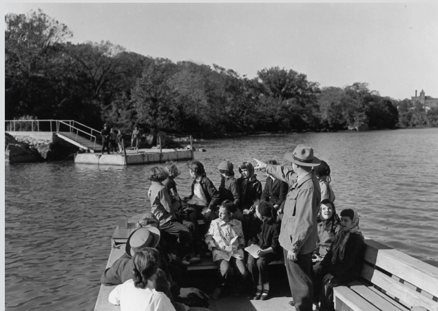
1953, TRI-Island visitors and park ranger in wood duck launch on Potomac River (National Park Service)

Comments are requested no later than September 8, 2017.