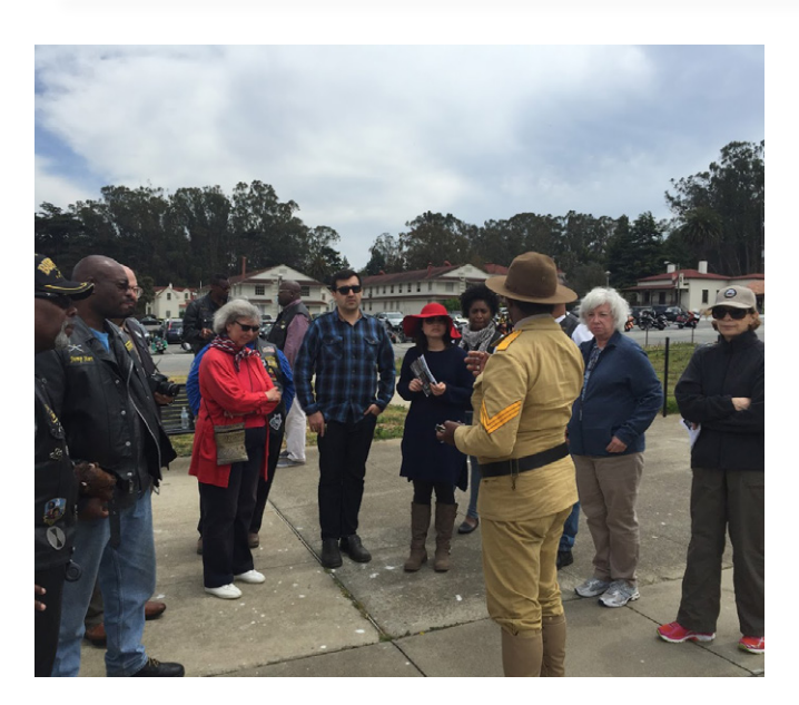
An interpretive program held at the National Cemetery in the Presidio of San Francisco, Golden Gate National Recreation Area.