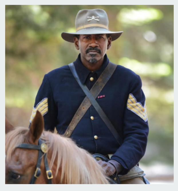
Telling the story through first-person narratives has been highly effective for providing visitors opportunities to have meaningful connections with the Buffalo Soldiers as individuals.

For more information and a link to the Buffalo Soldier Study document, please go to http://parkplanning.nps.gov/Buffalo_Soldier Study