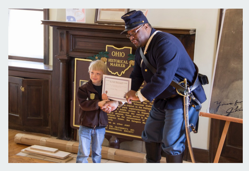
CHARLES YOUNG BUFFALO SOLDIERS NATIONAL MONUMENT JUNIOR RANGER PROGRAM