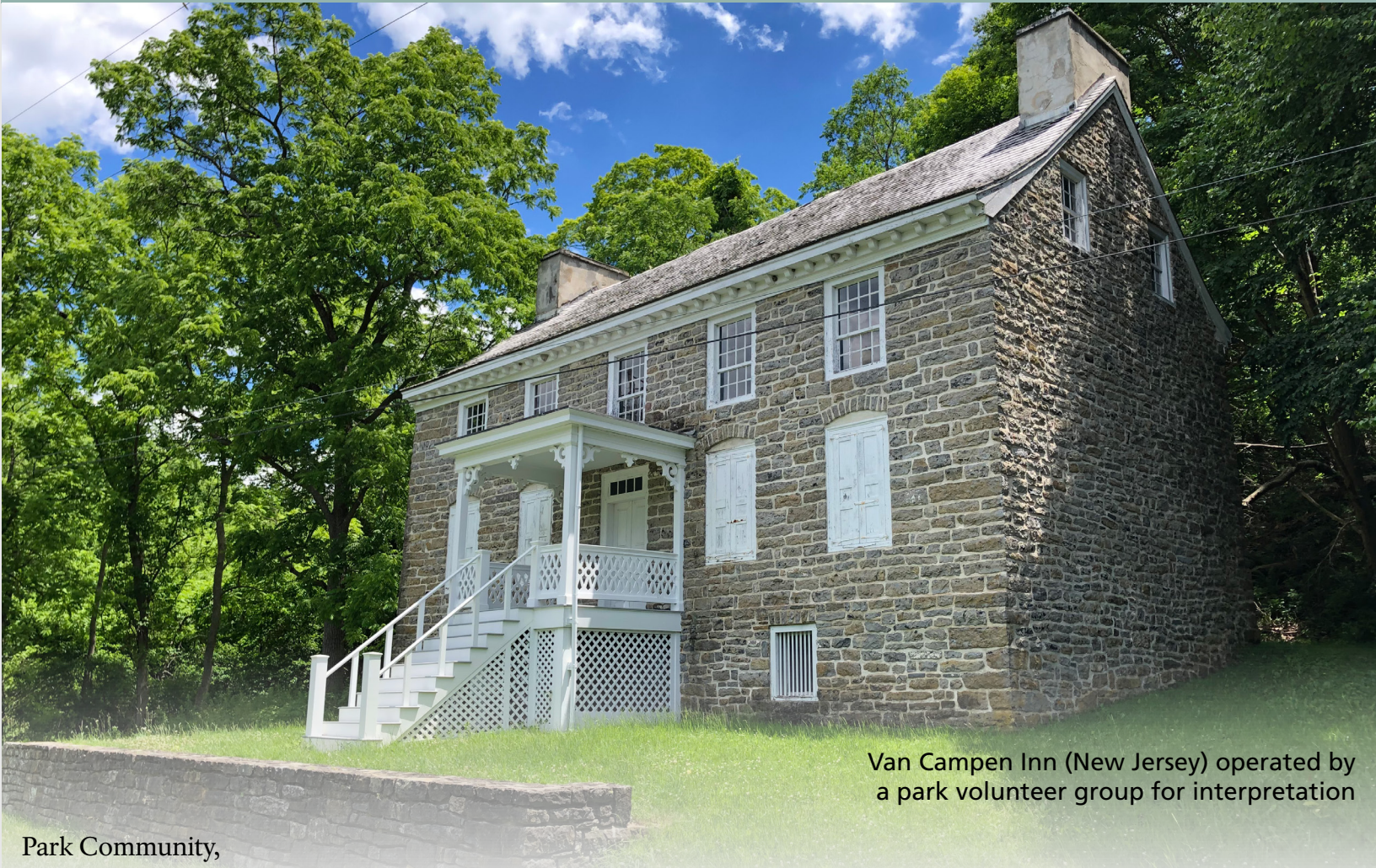
Van Campen Inn (New Jersey) operated by a park volunteer group for interpretation