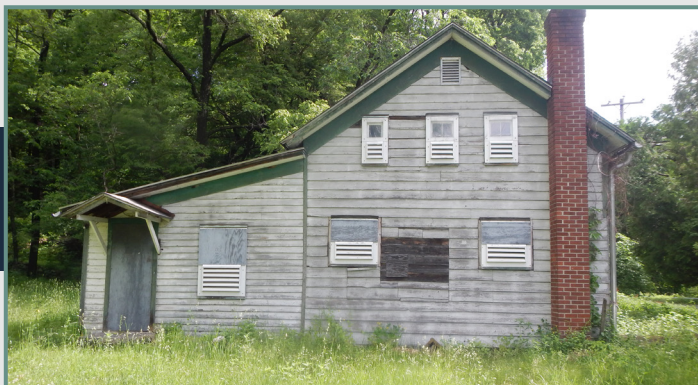
McCarty House (Pennsylvania), constructed in 1788 and the only remaining building on a former farmstead

Before you include your address, phone number, email address, or other personal identifying information in your comment, you should be aware that your entire comment, including your personal identifying information, may be made publicly available at any time. You may request that the NPS withhold your name and/or address from public disclosure. If you wish to do this, you must state this prominently at the beginning of your comment and make such a request by checking the box "keep my contact information private" on the website. The NPS will honor such requests to the extent allowable by law, but individuals should be aware that the NPS may still be required to disclose personal identifying information.