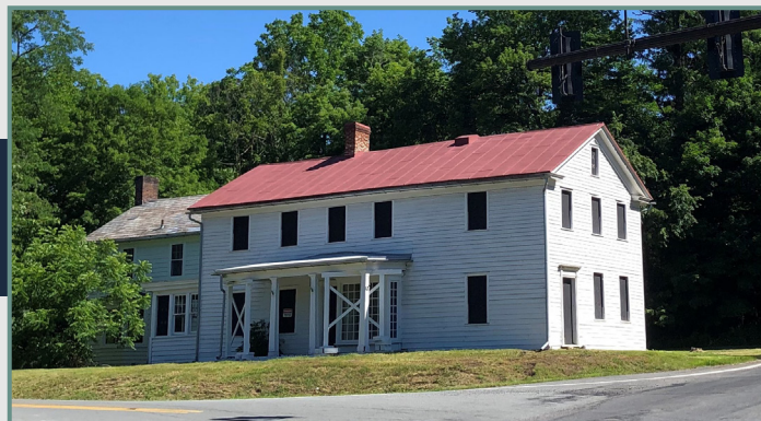
Peters House (Pennsylvania), one of two remaining historic properties in the Village of Bushkill