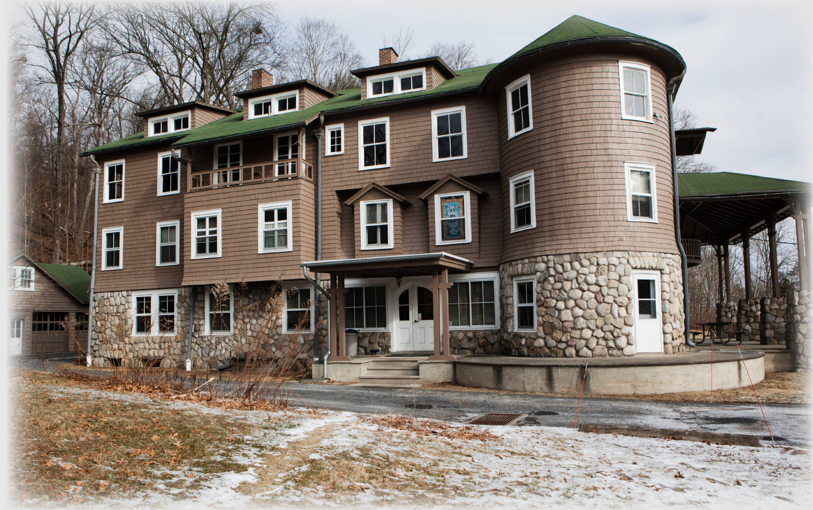
Peirce House, used by the National Park Service for offices

The draft HBS is a means to help the National Park Service prioritize which historic properties in the park will be preserved and maintained in the long term. To determine which properties to include in the plan and which priority to assign to each property, each was evaluated for historical significance, the physical condition of buildings, and their interpretive value related to their historic context.