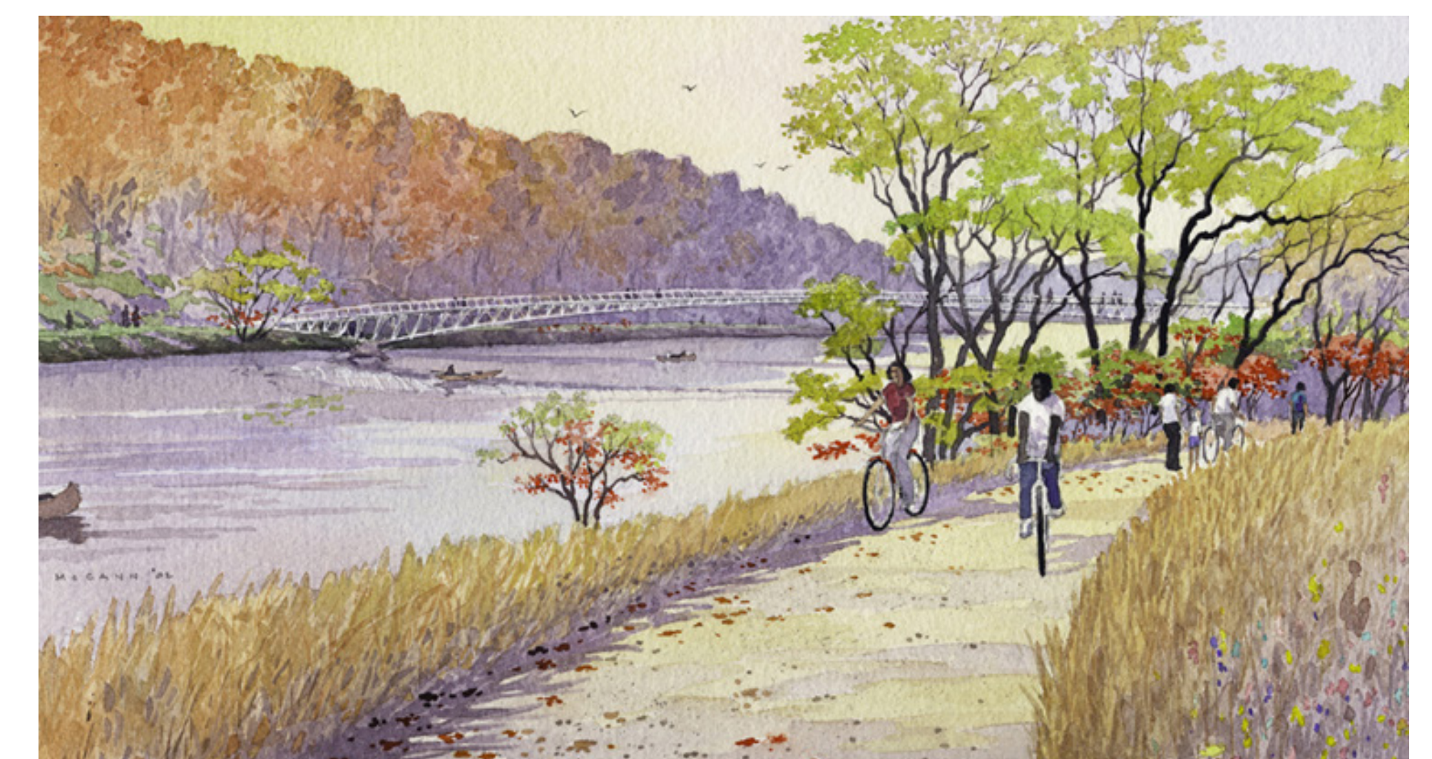
Illustration of Trail Along Upper Reach