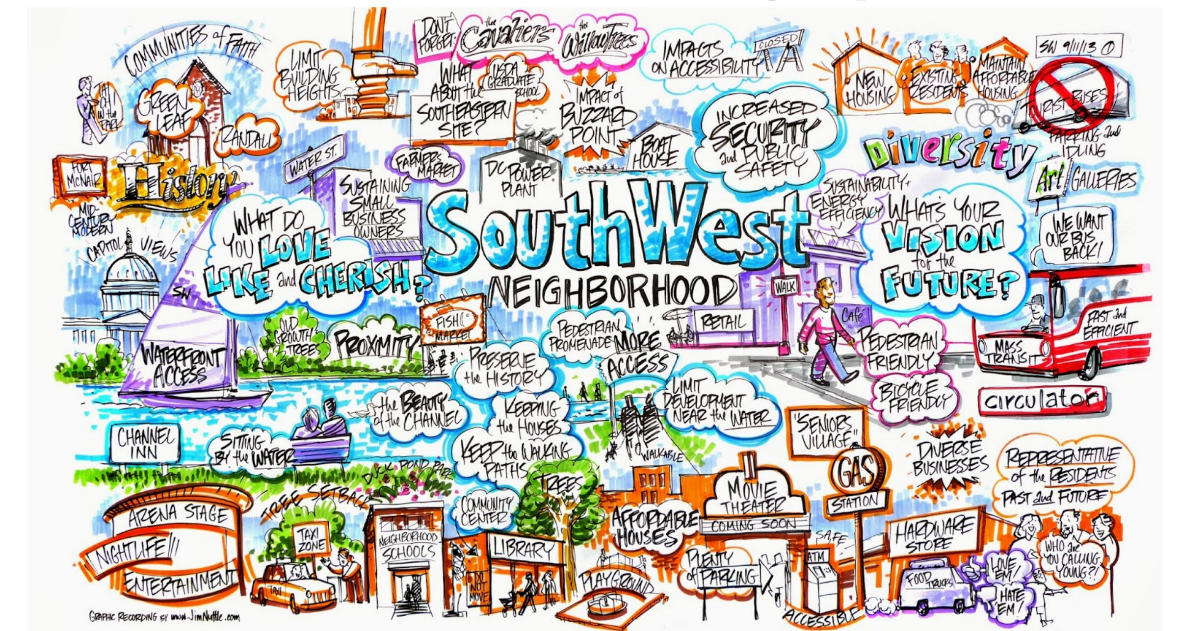
Illustrative depiction of Southwest Neighborhood