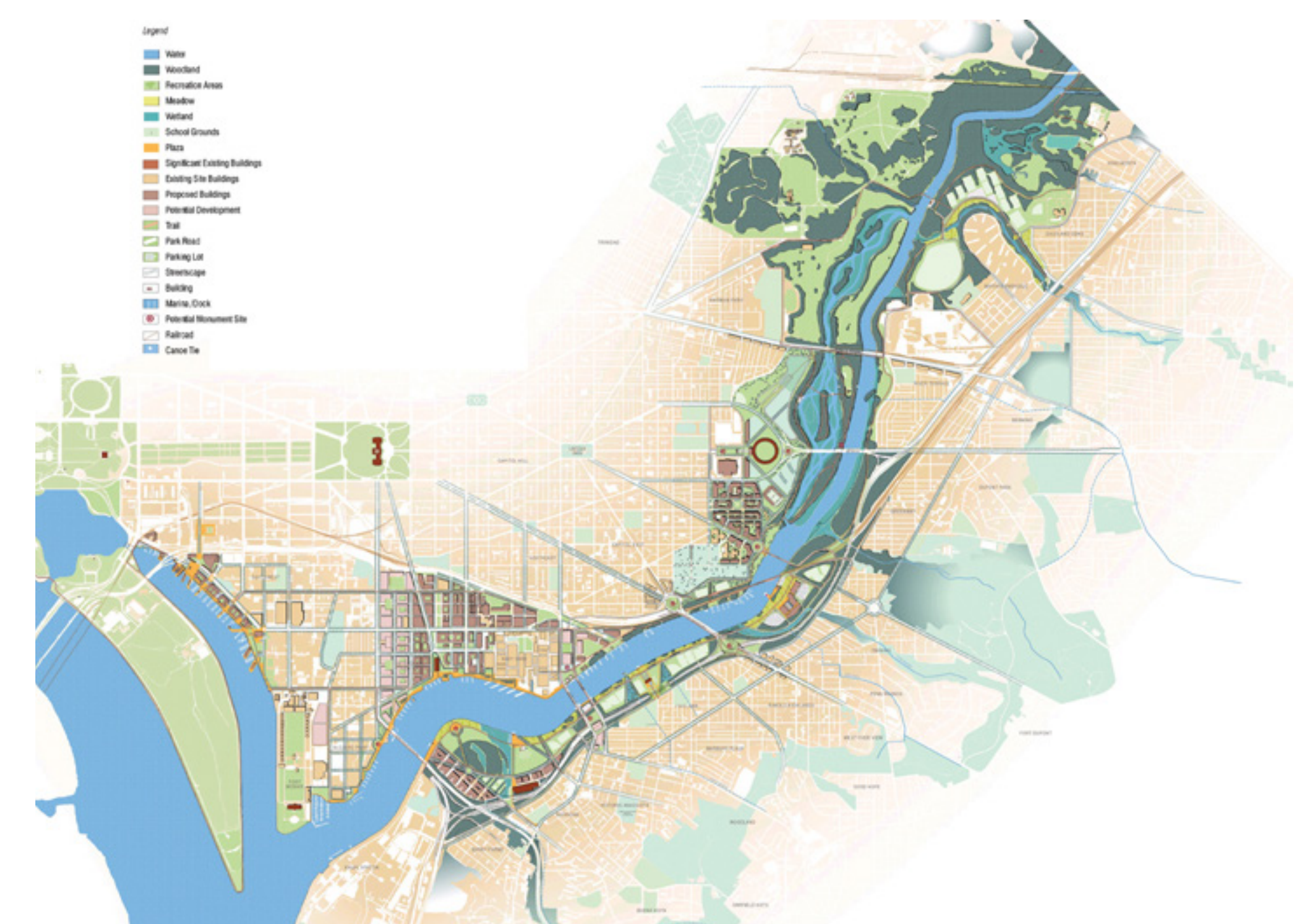
Aerial of Anacostia Waterfront Initiative Plan