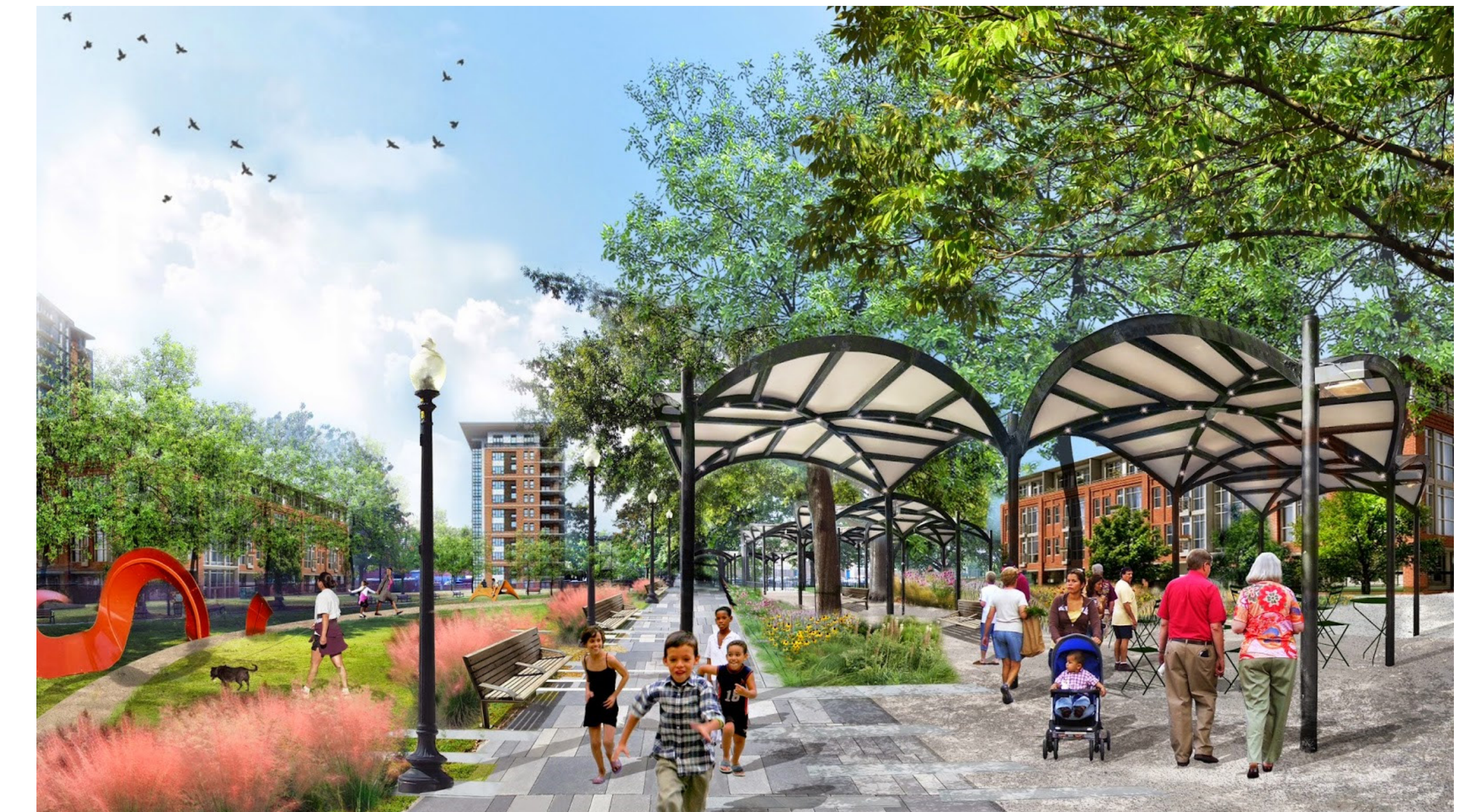
Rendering of Future Public Space Rendering: Capitol Riverfront BID