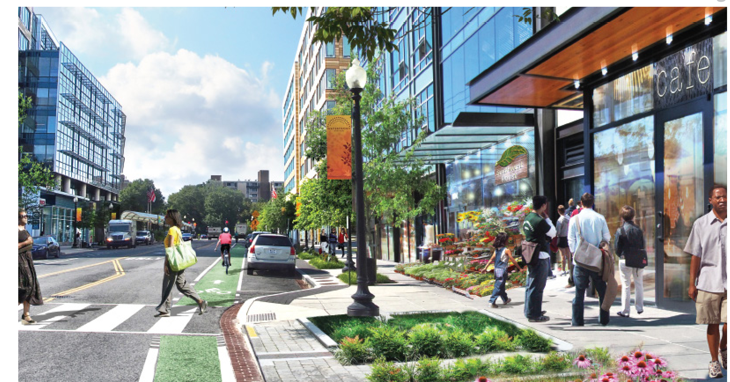
Rendering of implementation of design principles Photo: Wallace Roberts & Todd, LLC