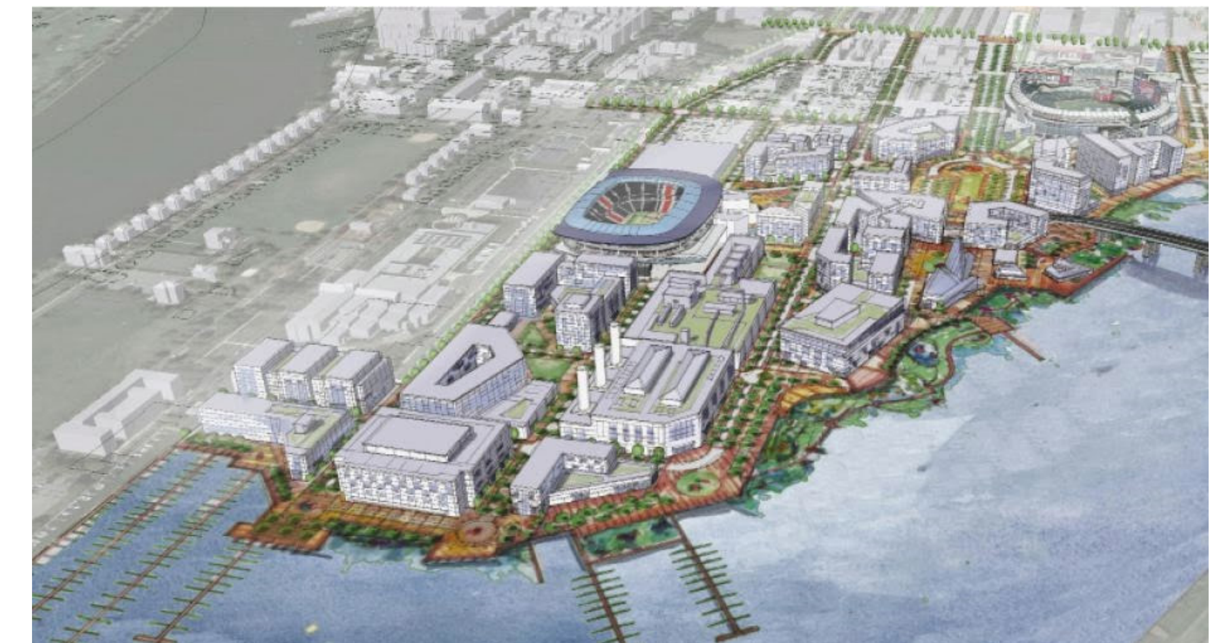
Rendering of Buzzard Point Redevelopment Rendering: District Office of Planning