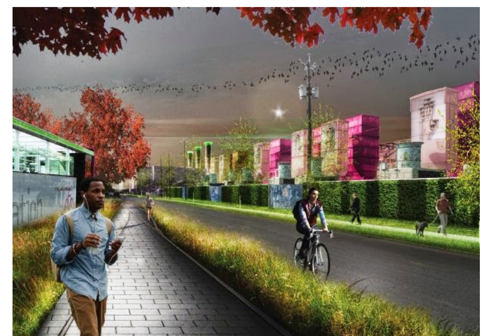
Rendering of Future Public Space on Half Street Rendering: Capitol Riverfront BID