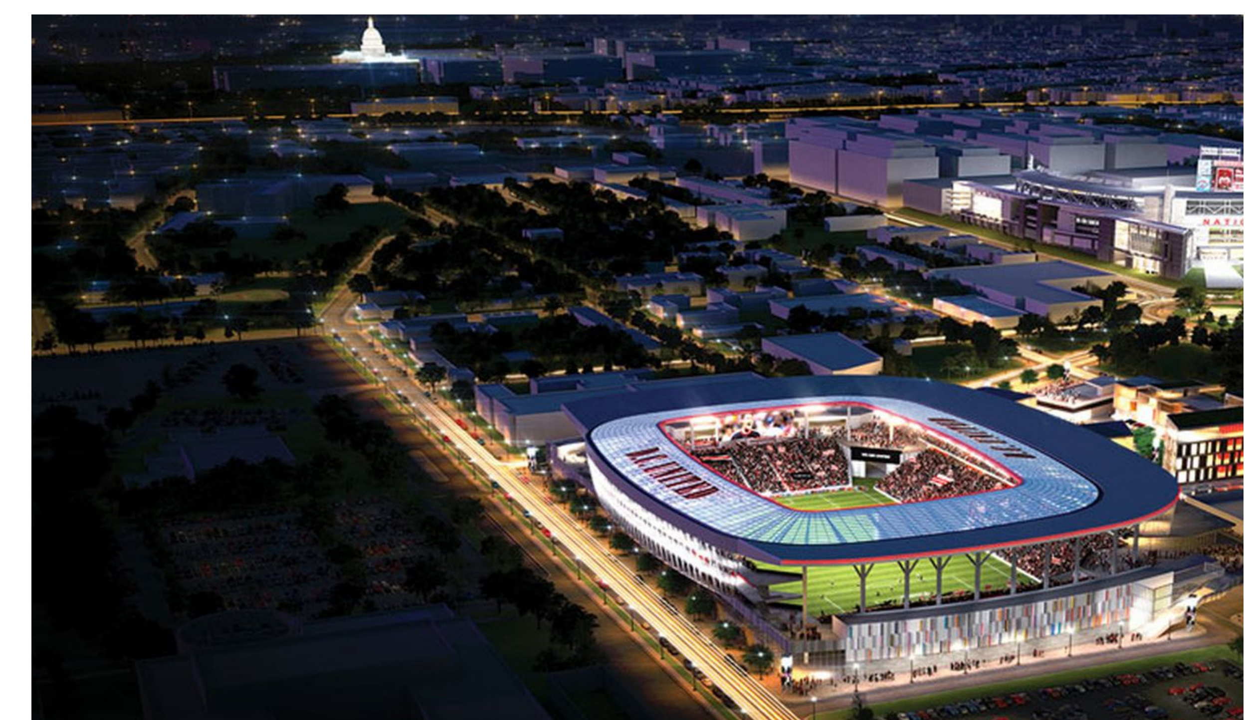
Rendering of Night Views from the Stadium Rendering: District Office of Planning