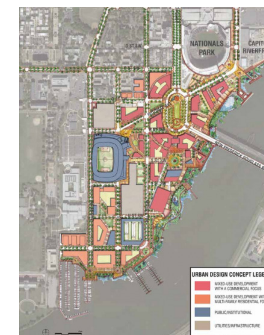
Urban Design Concept