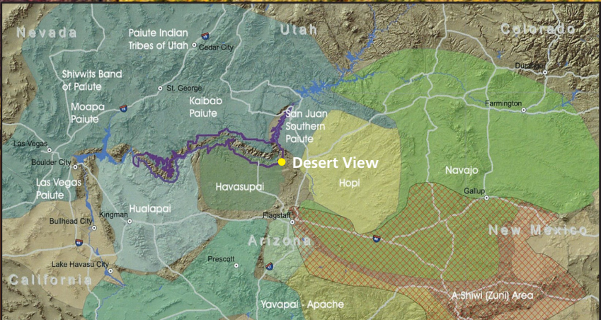
Map of Grand Canyon’s traditionally associated tribes, with Desert View. Purple line indicates boundary of Grand Canyon National Park.

“We share Desert View as a symbol to bond the peoples of yesterday, today, and tomorrow. The Watchtower serves as a connection to embrace the heartbeats of our peoples and visitors far and wide with the heartbeat of the canyon...We are still here.” - Inter-tribal Working Group Vision for Desert View