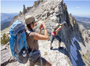
Backpackers on a guided trip in Yosemite's Wilderness.