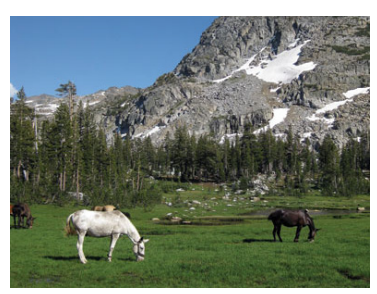
Pack stock grazing in Yosemite's high country.

The Wilderness Act requires that the National Park Service evaluate the need for commercial services within wilderness (i.e. guided hiking, climbing, and stock use). This project will determine an appropriate amount of commercial services in wilderness.