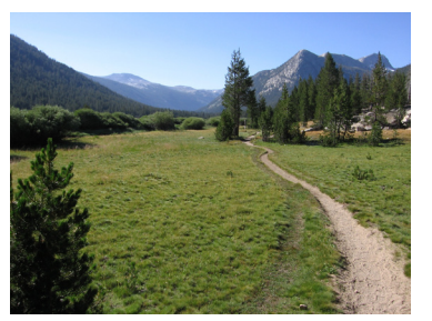
Popular trail through Lyell Canyon.