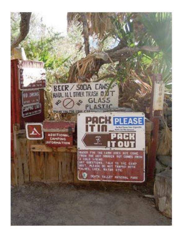
Signage at the library area of Lower Spring

Visitors also camp in the Middle and Upper Dispersed camping areas (appendix A, figure 10; appendix C), which contain sparse vegetation. Palm Spring contains very little natural habitat. Upper Spring provides a small (approximately 0.8 acre) area of habitat. The Upper Spring vegetation is dense, and the majority of the plants in this community are native. The habitat at Upper Spring is appropriate for supporting aquatic species, terrestrial invertebrates, small mammals, reptiles, and birds. Visitors infrequently explore Upper Spring, thus the impacts from trampling and disturbance would be minimal.