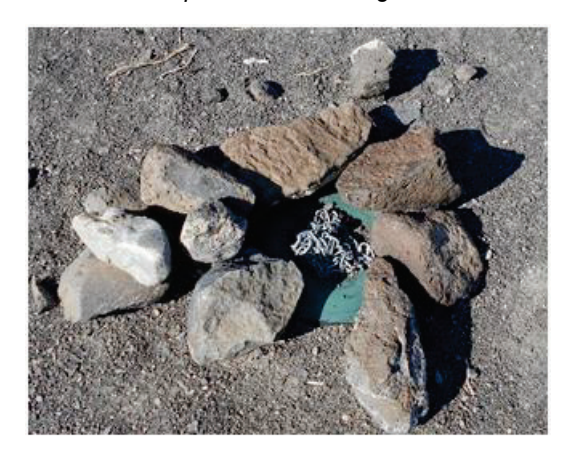
Airplane tiedown at the Chicken Strip airstrip