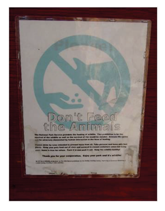
Sign on the book cabinet door of the library area at Lower Spring

Cumulative Impacts. Few past, present, or reasonably foreseeable projects have a detectable effect on wildlife. One project that may affect wildlife is the Saline Valley Road Borrow Sites and Gravel Management Plan (NPS 2011a), which was approved in 2011. This project would allow for the issuance of a permit to Inyo County for use of existing borrow pits along Saline Valley Road. If the