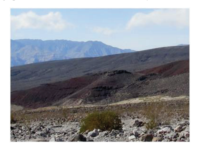
Upper peace sign, constructed in the 1990s

Visitors to the Saline Valley Warm Springs Area often enter the wilderness to participate in recreational activities. Adverse impacts to wilderness character could occur from visitor activities within the backcountry indirectly affecting the experience of wilderness visitors. Use of the facilities, high levels of visitation, and increased noise could affect the solitude or primitive and unconfined recreation quality of wilderness for other wilderness visitors and the intangible and symbolic values of the Timbisha Shoshone Tribe , especially during high-use times, such as Presidents Day and Thanksgiving.