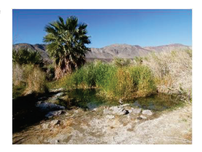
Upper Spring with native and nonnative vegetation species

The efforts of the National Park Service to reduce nonnative species could enhance or degrade the visitors' experience. As stated under alternative 2, visitors have differing desires for the vegetation and wildlife communities at the Saline Valley Warm Springs Area; some visitors enjoy the shade provided by the nonnative invasive palms and enjoy the presence of the feral burros while others would prefer a more natural environment. Additionally, the removal of the water diversion at Burro Spring could alter a popular camping area for visitors over time by potentially reducing or eliminating the line of mesquite that is sustained by this diversion. This would negatively affect the camping experience. However, as explained in the "Soils and Vegetation" section, it is likely that the existing