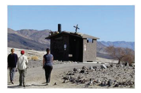
Vault toilet at Lower Spring

and Palm Spring (appendix A, figure 13). The perimeter of the four sections of fencing at Lower Spring would be approximately 1.0 mile and 0.32 mile at Palm Spring, encompassing a total of 6.9 acres. This fencing is irregular and would not require a great amount of soil displacement to install. In addition, food storage boxes could be installed at Lower and Palm Springs, additional airplane tie downs could be installed at the Chicken Strip airstrip, and additional vault toilets could be added to Lower Spring or Palm Spring, if necessary. The fence, food storage boxes, tie downs, and vault toilet would displace soils, and although the amount would be greater than that under alternative 2, the amount of soil would be small, and the impacts would be extremely localized.