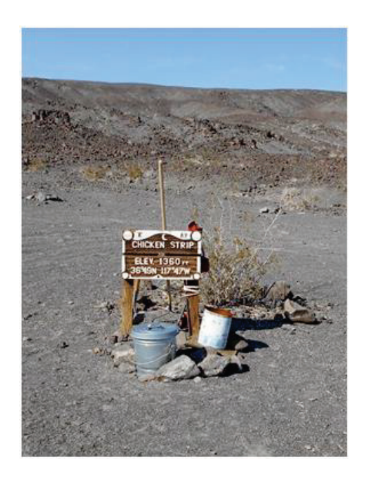
Sign at the Chicken Strip airstrip

The trends for vegetation and wildlife communities at the Saline Valley Warm Springs Area would remain unchanged. Native, nonnative, and nuisance species would persist and thrive on the diverted water (plants and wildlife) and intentional and accidental feedings (wildlife).