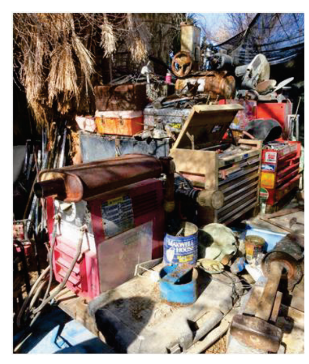
Vehicle repair supplies at the camp host site