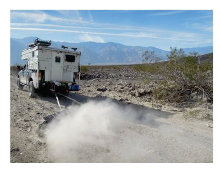
A visitor drags Warm Springs Road using his personal vehicle

While most of the impacts from visitors at the Saline Valley Warm Springs Area would be localized, visitors participate in many recreational activities once at the springs and all of these activities have the potential to trample soils and vegetation outside of the developed areas. Any activities that lead visitors away from the main developed areas of the Saline Valley Warm Springs Area would negatively affect soils and vegetation. There are no formal trails in Saline Valley due to the nature of the terrain; therefore, visitors are able to cross the landscape freely. including designated wilderness areas outside of the Saline Valley Warm Springs Area. (Impacts on wilderness character are discussed thoroughly in the "Wilderness