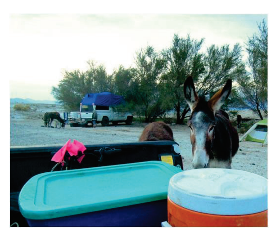
Feral burros in campsites at Burro Spring Camping Area

Alternative 2 would reduce the impacts on health and safety from hazardous materials. The vehicle support facility would be removed, and emergency vehicle assistance should not be expected by the visiting public. Removal of the facility would reduce the amount of hazardous