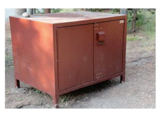
Example of a food storage box

Displacement of soils would be similar to alternative 2 in that visitors would continue to drive their vehicles on the dirt road, the airstrip would be maintained by the users with a drag, and creation of new fire rings and artwork would be prohibited. Warm Springs Road would be graded or otherwise maintained by the National Park Service under alternative 3, which would continue to displace soils, though the frequency of maintenance may be less than experienced under current conditions. Under alternative 3, the fence restricting feral burro access would be an extension of the wooden artistic fencing currently surrounding the lawn at Lower Spring. The fencing would be placed around the soaking tubs, source springs, and riparian areas at Lower Spring