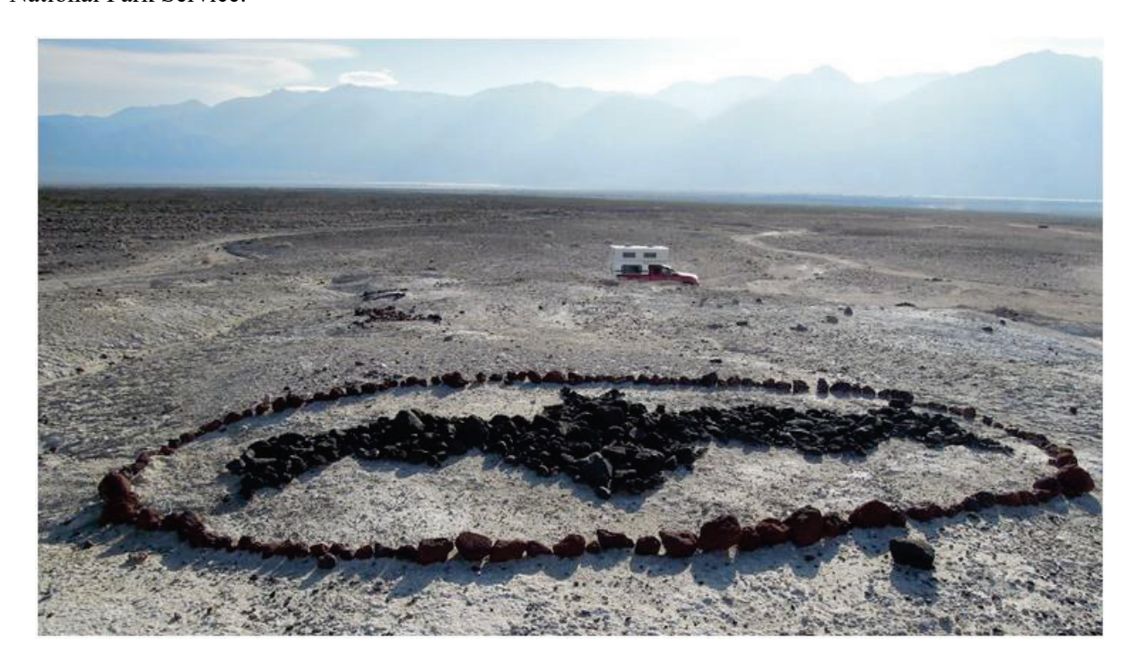
Artwork of a bat at the art board / rock alignment area at Lower Spring

Visitor use and experience at the Saline Valley Warm Springs Area under the no-action alternative would reflect a continuation of current management, maintenance of existing opportunities, and current levels of access. Visitors would continue to be able to camp unrestricted at the springs without a permit. Campfires in user-created fire rings built with rocks or NPS-provided fire enclosures, grates, or grills would not be restricted. While the visitors and volunteers would not be allowed to construct new tubs at the springs per the Superintendent's Compendium, all current water diversions would continue, the users and camp host would be responsible for maintenance and cleaning the facilities, and visitors could continue to create new artwork. The vault toilets would remain in their current locations; the visitors would continue to clean the facilities and the NPS maintenance staff would continue to pump the toilets once or twice a year. Use of the Chicken Strip airstrip would continue with two sets of tiedowns, and maintenance of the airstrip would be performed by Recreational Aviation Foundation (RAF) in coordination with the National Park Service.