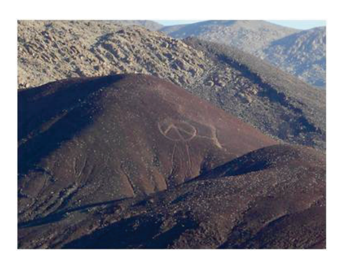
Lower peace sign, constructed in the 1960s

Visitors to the Saline Valley Warm Springs Area create artwork by collecting rocks of different colors and constructing art on the desert floor. One piece of art, the lower peace sign, was constructed in the 1960s (New South 2015). The peace sign was made by removing the top layer of soil and rock by walking the area repeatedly or by using hand tools and exposing the different colored surface below (Bonstead 2011). Visitors have maintained the peace sign and a social trail has formed due to the number of people that visit the peace sign; both the peace sign and the trail are in wilderness. Visitors commonly create new artwork in the art board area (appendix C).