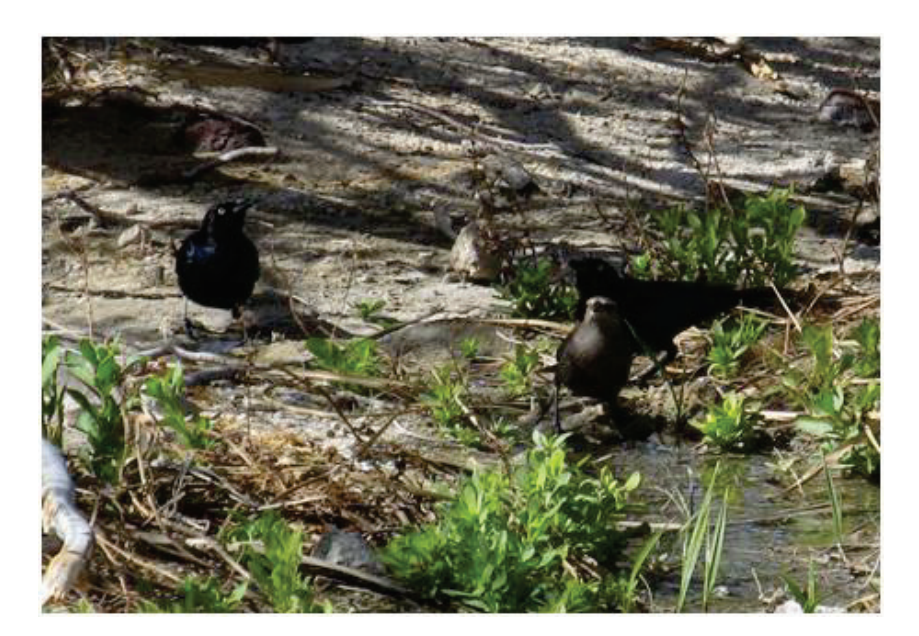
Grackles in a drainage area at Palm Spring

In addition to searching for human food, feral burros and other habituated wildlife contribute to the degradation of water quality from the introduction of pathogens from their waste. The source springs are not protected from runoff and potentially contaminated water could be diverted to the soaking tubs. showers, or the sinks where visitors wash their dishes. Presence of animal waste at the campsites can lead to an increase in insects and rodents, which could potentially carry diseases such as hantavirus.