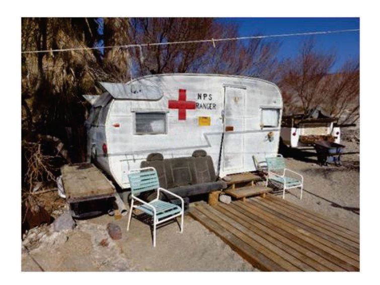
Trailer at the camp host site at Lower Spring

Camping regulations under alternative 2 would be similar to those described for alternative 1 with few differences. Alternative 2 would implement a mandatory no-cost permit system modeled after the Visitor Use Permit System proposed in the Death Valley National Park Wilderness and Backcountry Stewardship Plan (NPS 2013a), and an overnight camping fee could be implemented in the future. Visitors would be able to have campfires at their campsites, but the National Park Service would remove user-created fire rings, encourage visitors to use NPS-provided firepans or other fire enclosures, and require visitors to haul ash and charcoal from the Saline Valley Warm Springs Area