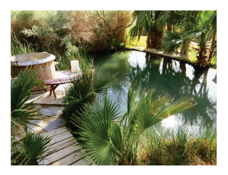
Settling pond and Children's Play Tub at Lower Spring

At Lower Spring, wetland 2 (0.027 acre) is the settling pond, an artificial wetland that persists due to the runoff from the tubs, sinks, shower, and lawn (appendix A, figure 7; appendix C). Under alternative 1, there would be no changes to the settling pond, as the diversions would continue, and visitation levels are expected to remain the same as current conditions. These factors would result in approximately the same amount of water provided to wetland 2.