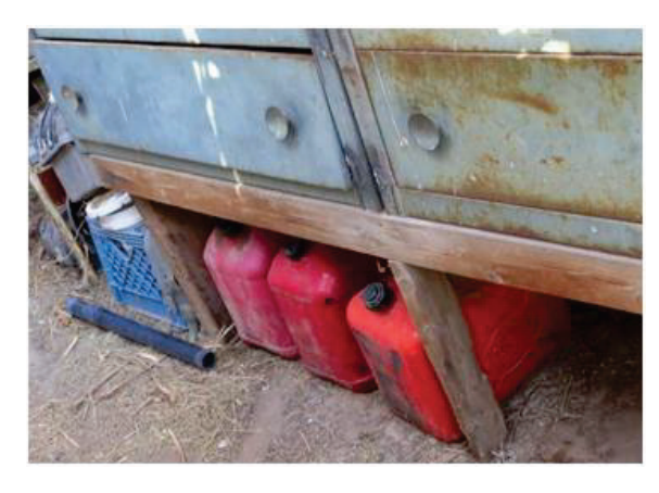
Improperly stored gasoline cans at camp host site

Flood Risk. Because there would not be a change in camping trends and the number of visitors to the