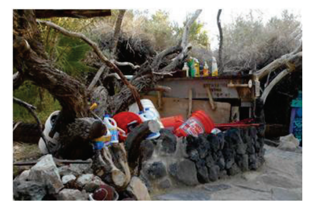
Bleach and cleaning supplies at Lower Spring

Saline Valley Warm Springs Area is expected to remain constant, the risks to human safety from flash