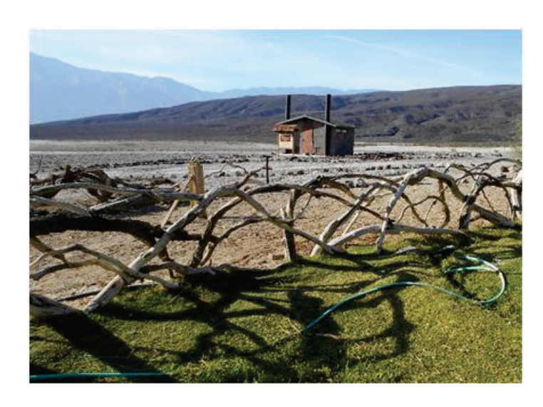
Artistic fence currently at Lower Spring

In addition to vehicle use and airstrip dragging and road maintenance, displacement of soils would occur under this alternative during installation of the artistic wooden fencing around the source springs at Lower and Palm Springs (appendix A, figure 11). The perimeter of the four sections of fencing at Lower Springs would be approximately 0.072 mile (301 feet) and 0.014 mile (74 feet) at Palm Spring, encompassing a total of approximately 0.044 acre. This fencing is irregular and would not require a great amount of soil displacement to install. While this action would permanently displace soils, the effects would be extremely localized and immeasurable. Although the existing fencing at Lower