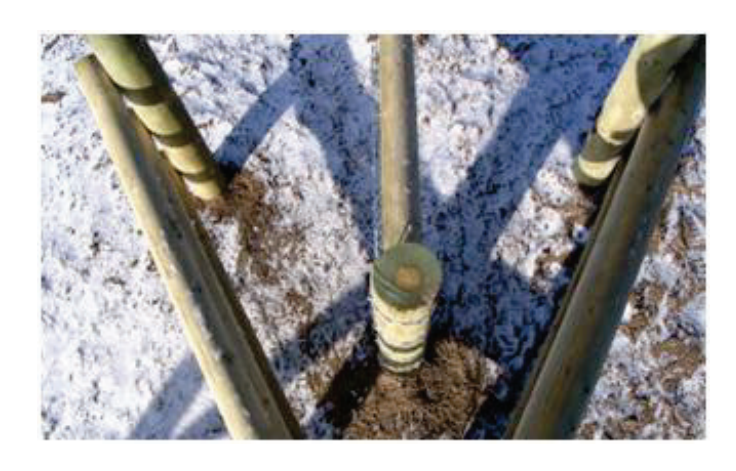
Example of a visitor entrance through wire and wooden post fencing that would prohibit feral burros from entering the Saline Valley Warm Springs Area

Removal of the developed features (e.g., soaking tubs, showers, sinks, plumbing; presented in photographs and figures in appendix C) at the Saline Valley Warm Springs Area would disturb soils and expose them to wind and water erosion: however, removal of the infrastructure would provide beneficial effects over the long term from removal of impermeable materials and an increase in natural substrates. Warm Springs Road would be maintained by the National Park Service, as needed, to allow visitors to access the Saline Valley Warm Springs Area, resulting in some soil disturbance. Fencing to exclude feral burros would be installed