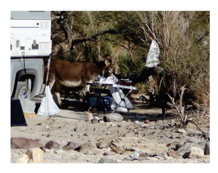
Feral burro eating visitors' food at a campsite at the Cool Pool Camping Area

Feral Burros. Burros were introduced to the California desert in the late 1800s by settlers and miners (BLM and NPS 1999). Feral burros are well adapted to survive in the desert environment. Mountain lions (Puma concolor) will occasionally prey on feral burros, but this does not occur often enough to reduce the feral burro population. In some areas, feral burros can compete with native wildlife, such as bighorn sheep (Ovis canadensis) for food, water, and space. Although feral burros are not directly competing with other wildlife at the Saline Valley Warm Springs Area, they have become habituated to the visitors, often raiding campsites for food. After the development of the alternatives for the draft plan/EIS, the National Park Service entered into a 5-