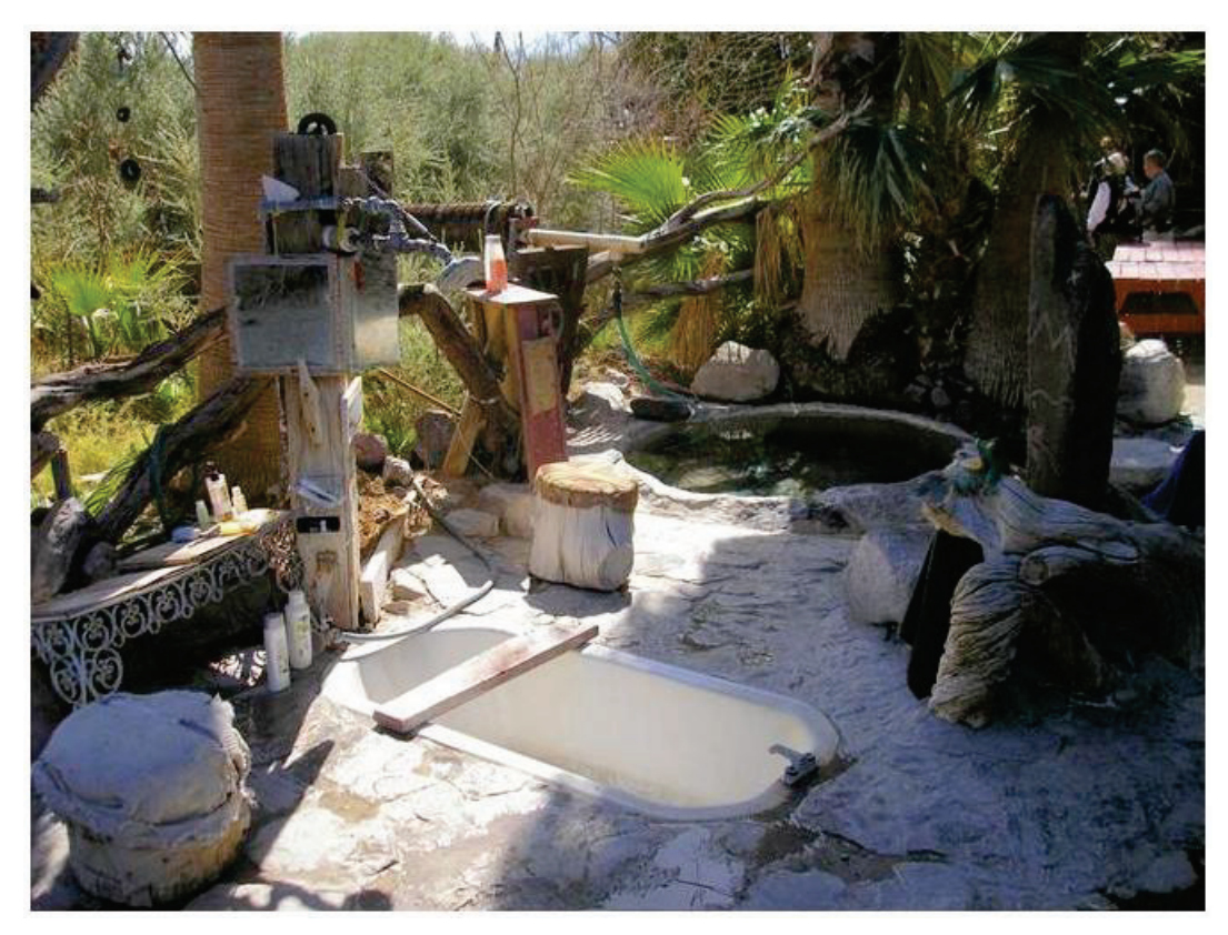
Bathtub and shower at Lower Spring, contributing elements to the area of historic significance for the recreational users

Vegetation" section and presented in appendix C. Visitors to the Saline Valley Warm Springs Area can unknowingly impact archeological resources from activities such as driving through the Saline Valley Warm Springs Area, moving rocks to create fire rings and art, and dragging Warm Springs Road with a heavy tire or other device. Continued visitor use in the current manner in the Saline Valley Warm Springs Area would allow easy access for hikers into more remote, designated wilderness areas where more intact archeological sites may be located, thereby providing a potential for impacts on these sites.