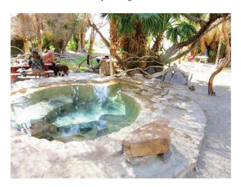
The Crystal Pool and visitors at Lower Spring

All non-historic artwork would be removed from the developed areas and wilderness, and restrictions on creating new artwork would be enforced so that natural or cultural resources would not be manipulated for the purpose of art. Only the bat pole that marks the entrance to the Saline Valley Warm Springs Area on South Pass and the lower peace sign would remain.