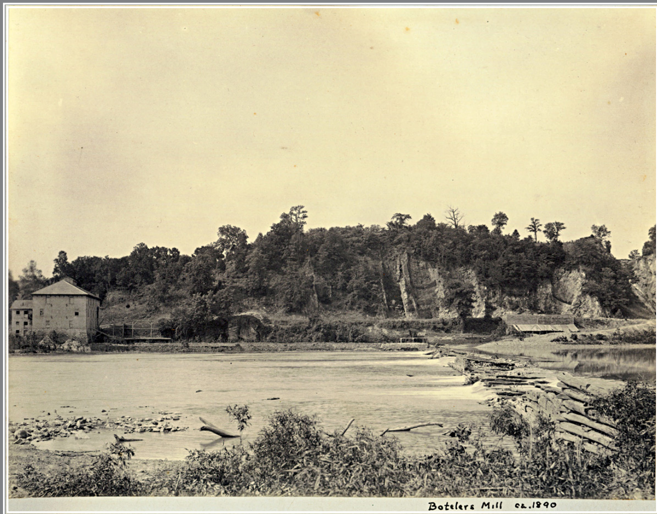
Botlers Mill ca. 1890