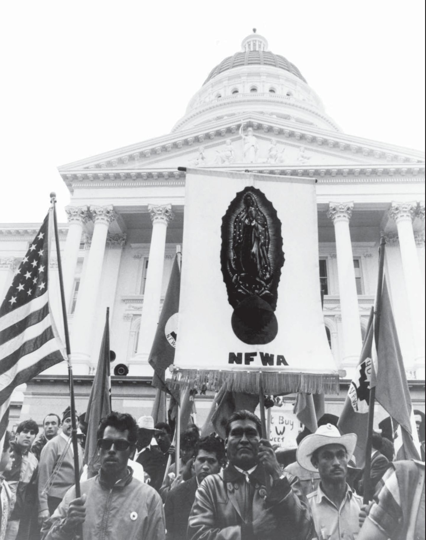
Farm workers and United Farm Worker (UFW) supporters gather at the steps of the State Capitol in Sacramento, California at the end of the 1966 Delano to Sacramento march.