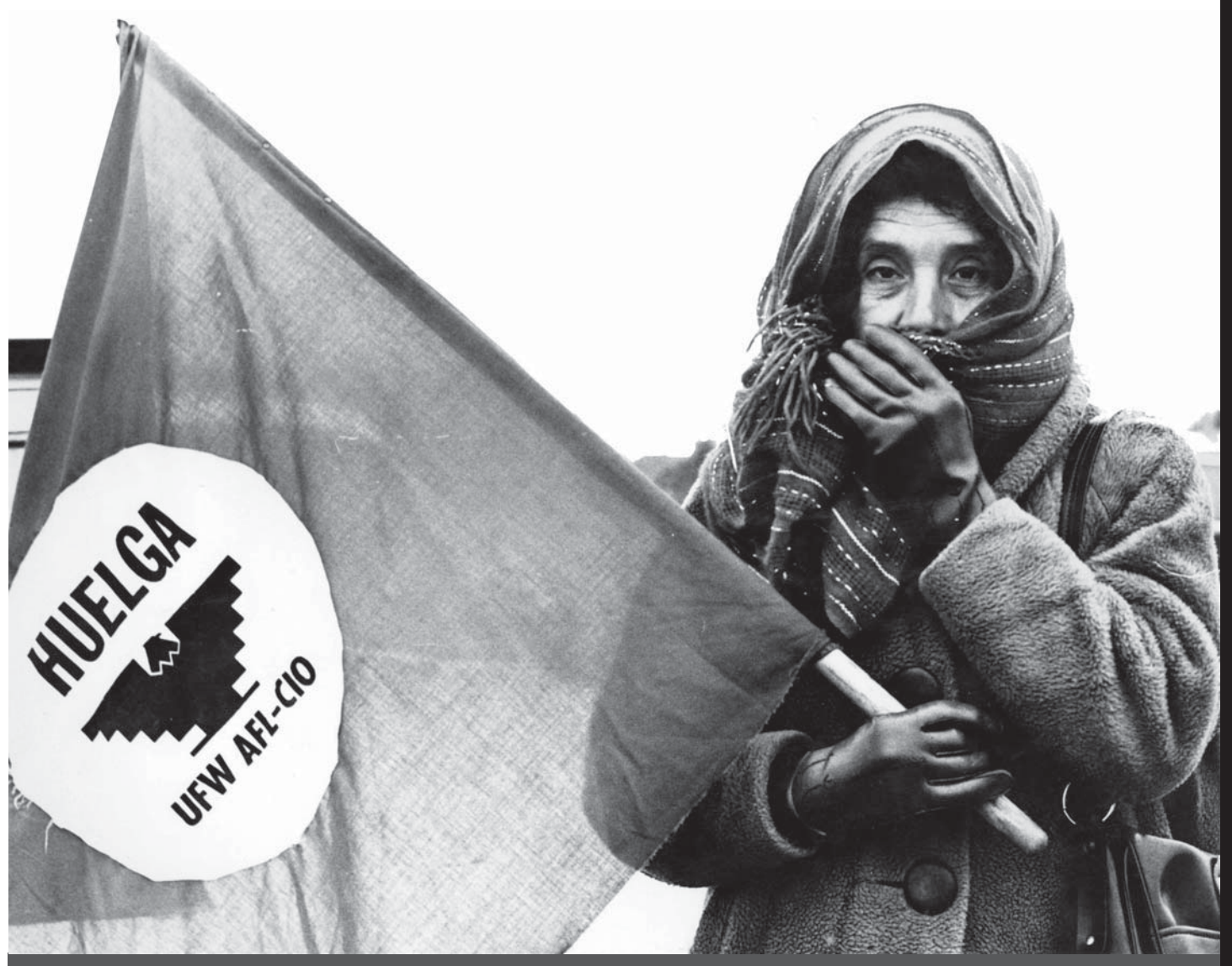
A female striker holds a UFW eagle flag and covers her face to hide her identity during a strike in San Luis, Arizona, 1974.