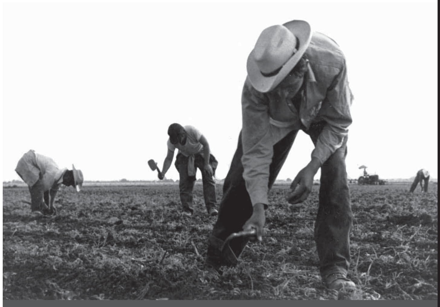
Farm workers in a field use short handled hoes to harvest crops.