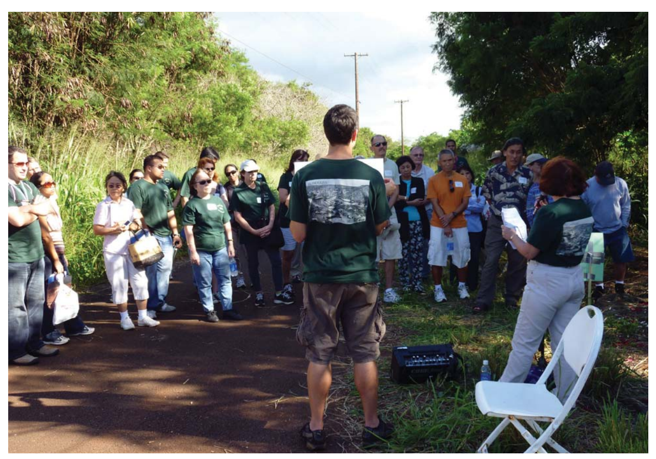
Onsite presentation, 2011 Day of Remembrance Pilgrimage to Honouliuli Internment Camp.

Because potential development of a visitor center is uncertain, many of the visitor use opportunities in alternative B would be dependent on WWII Valor in the Pacific