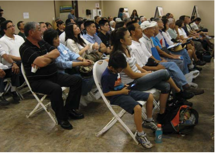
Honouliuli Day of Remembrance, 2011.