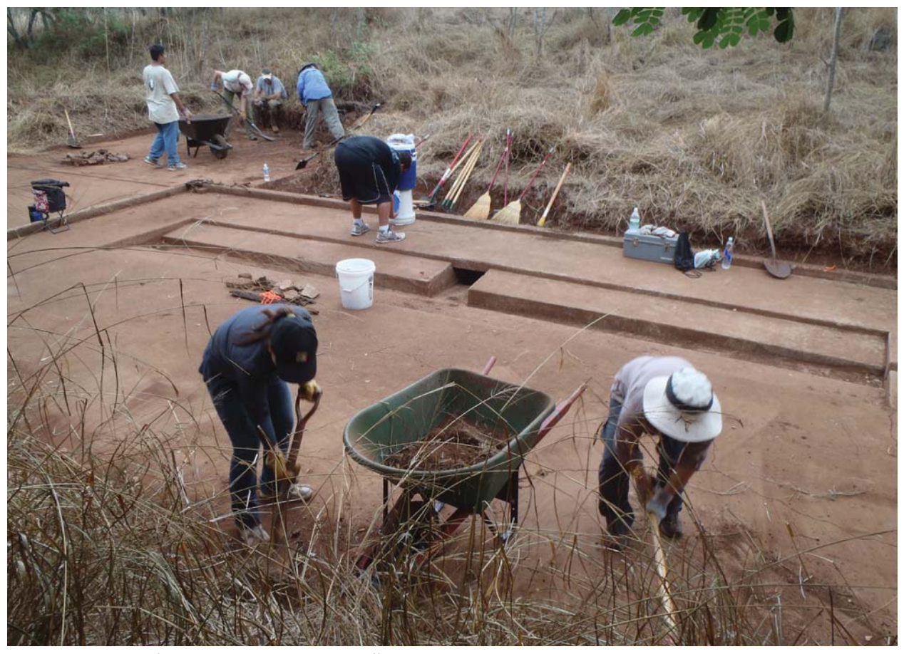
Summer archeological field school, Honouliuli.

Alternative B would have minor to moderate cumulative adverse effects from vegetation management activities needed to preserve the historic landscape features (irrigation ditches, concrete slabs, pier footings, etc.), as well as historic viewsheds documented in period photographs. The likely removal of extensive portions of the (primarily nonnative) vegetation will impact the existing flora and fauna habitats found in Honouliuli Gulch. A vegetation management plan (as a component of a cultural landscape report) would need to be developed under alternative B and would require further environmental compliance review and include a more in-depth survey of biological resources and potential impacts.