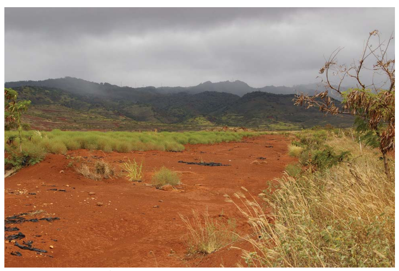
Looking north into Honouliuli Gulch from the proposed administrative access road. Photo: NPS, 2013.