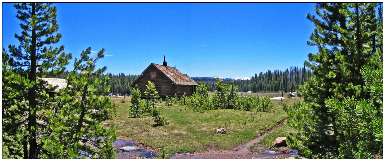
Hockett Meadow Ranger Station