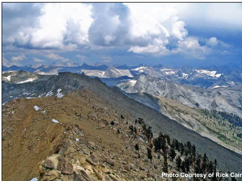
Looking east over the Great Western Divide from 11,204-foot-high Alta Peak