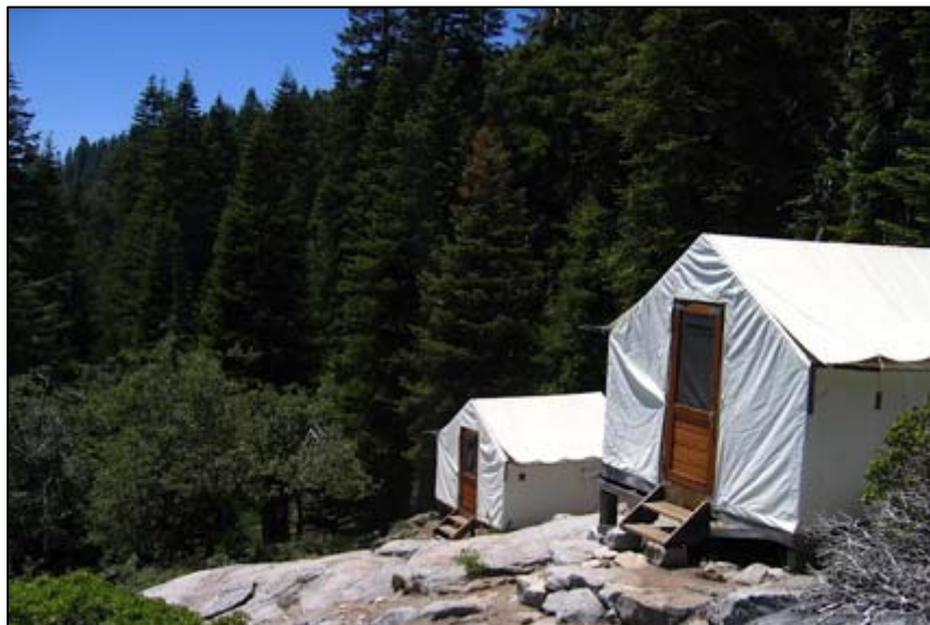
Bearpaw Meadow High Sierra Camp in Sequoia National Park

The private lands, non-conforming uses, and retained rights on lands adjacent to or surrounded by wilderness, and therefore most relevant to this WSP/FEIS, are summarized below: