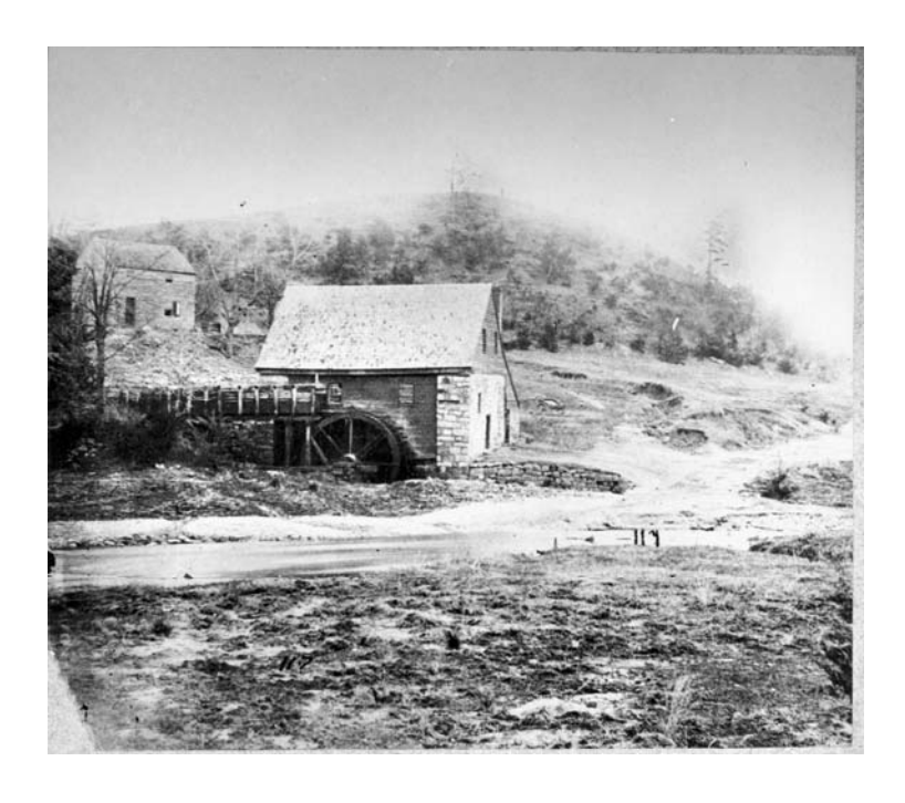
1865 View of Howison's Mill and the proposed project area, looking northeast. Willis Hill and the National Cemetery are visible in the background. Note cleared nature of the site.