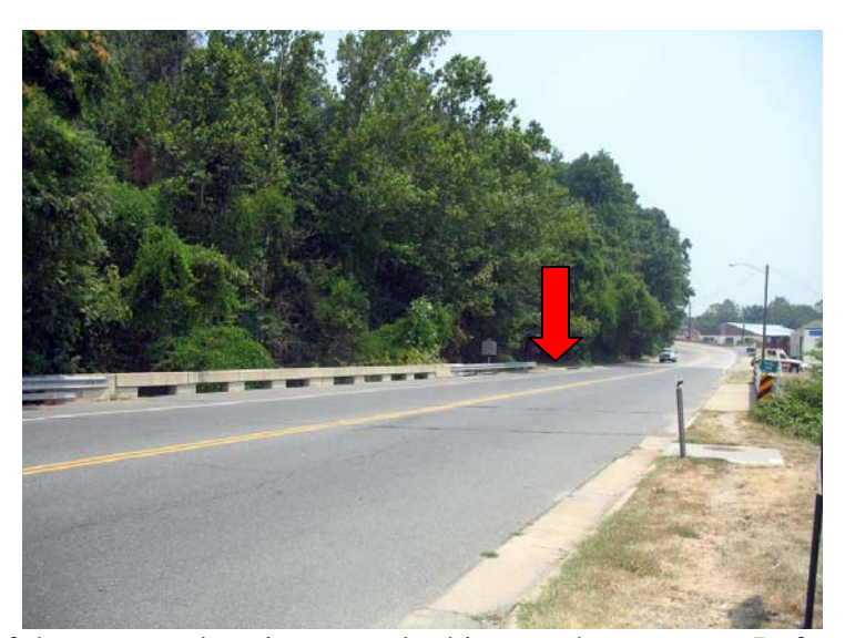
Current view of the proposed project area, looking northeast across Lafayette Boulevard. Red arrow indicates location of proposed trail.

Note cleared nature of the site and the modern access road off Lafayette Boulevard.