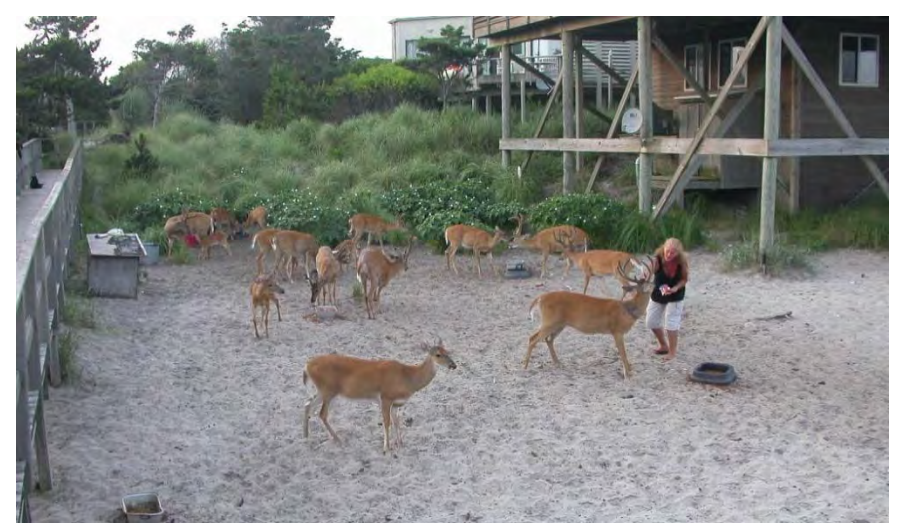
Human-deer Interaction