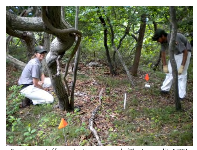
Seashore staff conducting research

An additional study (Forrester, Leopold, and Underwood 2008) used exclosures to conclude that deer are the dominant herbivore in the Sunken Forest. Past data sets compiled by the science team indicate that changes in the density of shrub layer species correspond to changes in the deer density for the same time interval. The data sets indicate that much of the impacts on vegetation from heavy browsing had already occurred by the mid-1980s. These impacts from heavy browsing by white-tailed deer continue today.