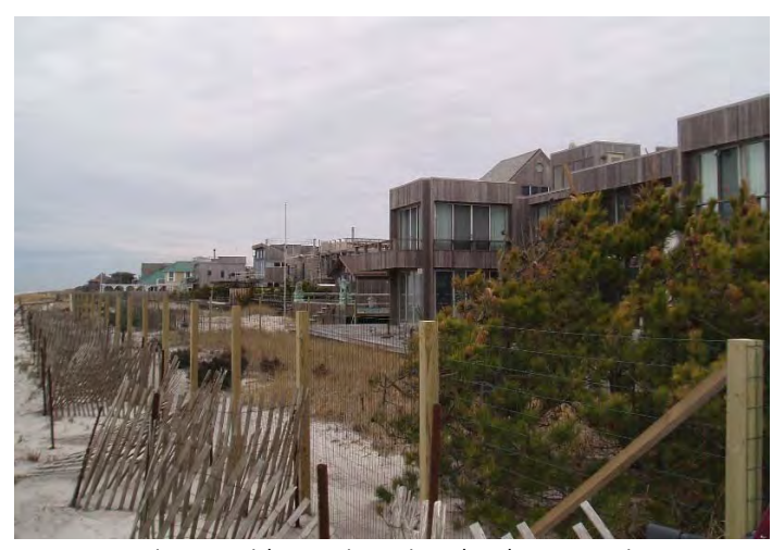
Private residences in a Fire Island community

An important component of this plan would be improving the cooperative effort between the Fire Island communities and the Seashore in addressing the behaviors of residents and vacationers who promote food conditioning of deer. During the 2008–2011 deer density counts, biologists recorded instances in which deer were being fed by humans or foraging through unsecured garbage. During surveys, approximately 11% of deer were observed feeding from overturned trashcans, and approximately 11% of deer were being directly fed by a person. A desired condition of the Seashore is to reduce these undesirable human-deer