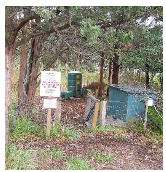
4-Poster Device

In 2011 Cornell University completed a three-year study on the use of 4-Poster baiting stations to treat deer with the pesticide permethrin when they feed, with the intent of killing ticks on the deer. The baiting stations were located on nonfederal lands on Fire Island and used whole kernel corn as a lure to attract the deer. In January of 2012, the New York State Department of Environmental Conservation registered 4-Poster Tickicide along with assigning a special local need supplemental labeling for the device. This resulted in two Fire Island communities located within Fire Island National Seashore's boundaries requesting deployment of a total of three devices; two devices in the village of Saltaire and one device in Fair Harbor. The Seashore issued a Letter of Authorization for both communities as requested. From 2008 through 2012, deer consumed 28 tons of whole kernel corn at the Saltaire devices, with 11.2 tons distributed in 2012 alone (NPS 2013a).