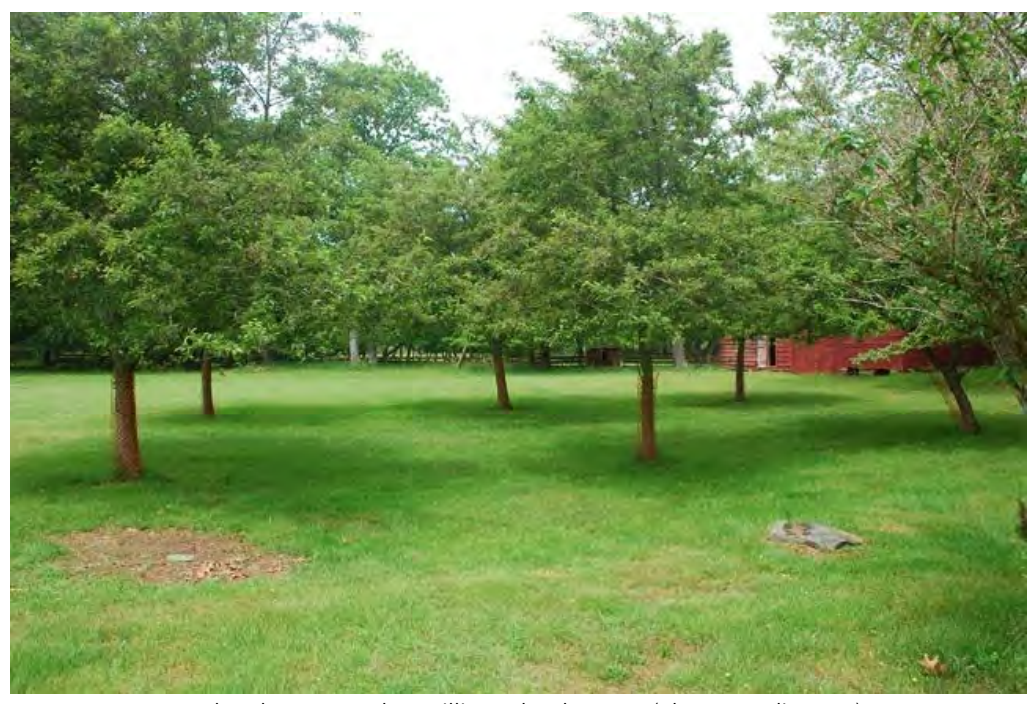
Orchard trees on the William Floyd Estate

The 613-acre William Floyd Estate (figure 2) consists of the historic house and surrounding fields of about 20 acres ("historic core" area), forests ("lower acreage"), small fields scattered among the forest setting, and a broad marsh associated with Narrow Bay. The historic core area of the William Floyd Estate experiences browsing impacts by deer at a level that causes repeated mortality of ornamental plants. Desired conditions for landscaping would be focused primarily on the historic core area. Specific character-defining features of vegetation at the William Floyd Estate are identified in the cultural landscape inventory (NPS 2006b), including the lopped tree line, the West Garden, a small orchard in the West Garden, planted trees southwest of the Mastic House, and ornamental trees and shrubs. A desired condition is sustainable management of those same ornamental plants or comparable alternatives and full restoration of the character of the historic core area for aesthetics and public interpretation. The Seashore would also like to promote native forest regeneration, particularly oaks and hickories within the William Floyd Estate forests.