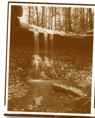
Cuyahoga Valley National Park