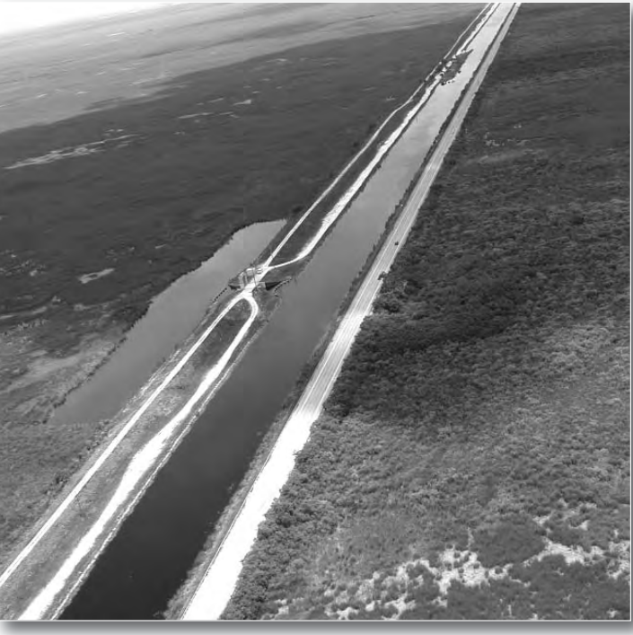
Aerial view of the Tamiami Trail.

Dan B. Kimball Superintendent, Everglades National Park