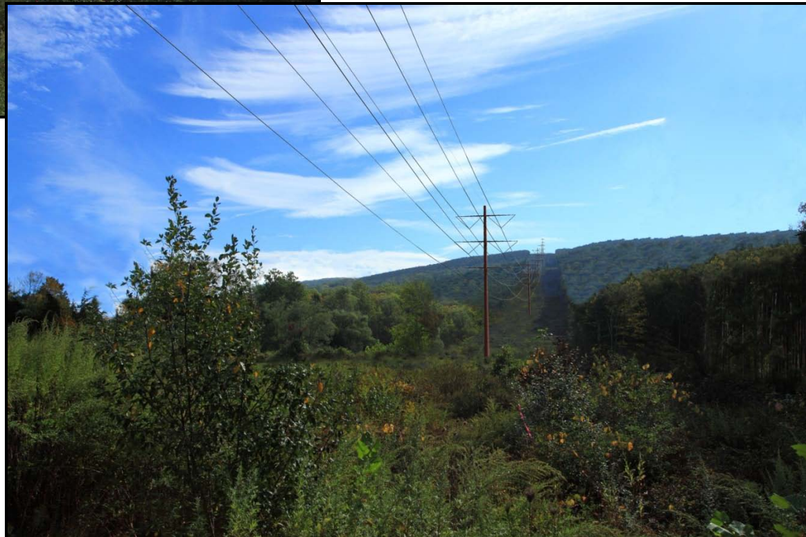
Alternatives 2 and 2b