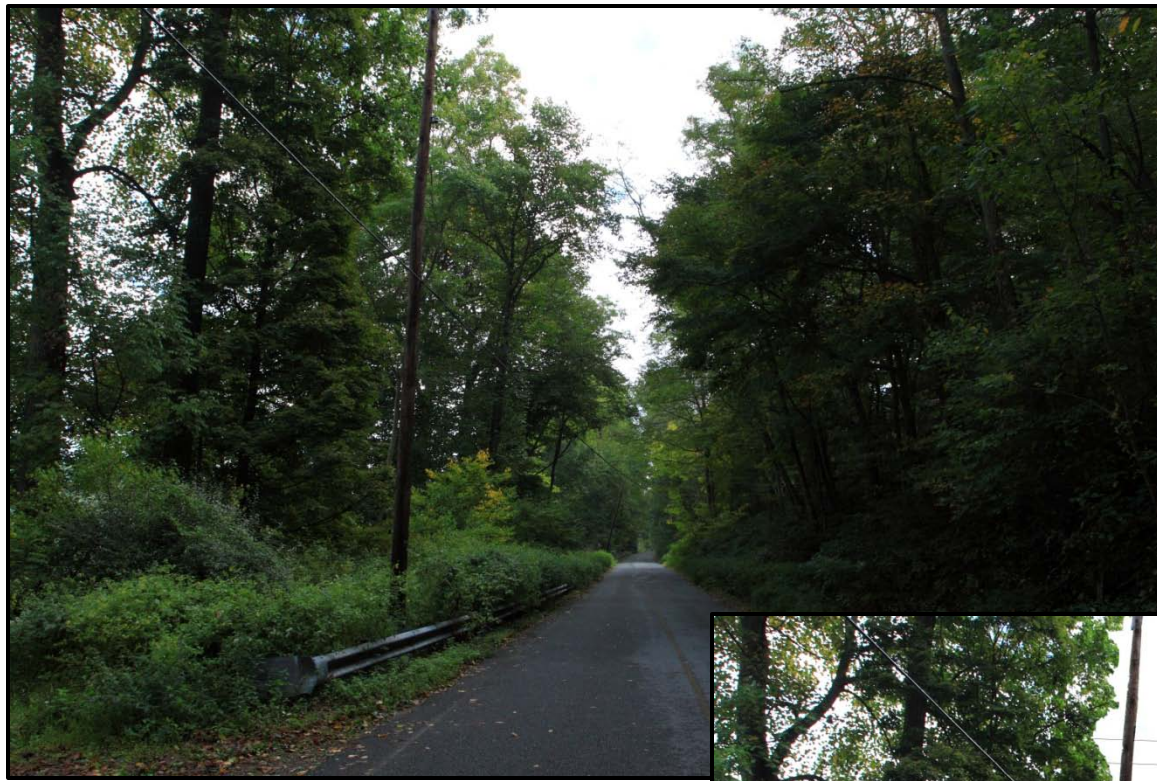
Existing Transmission Line at Old Mine Road Crossing