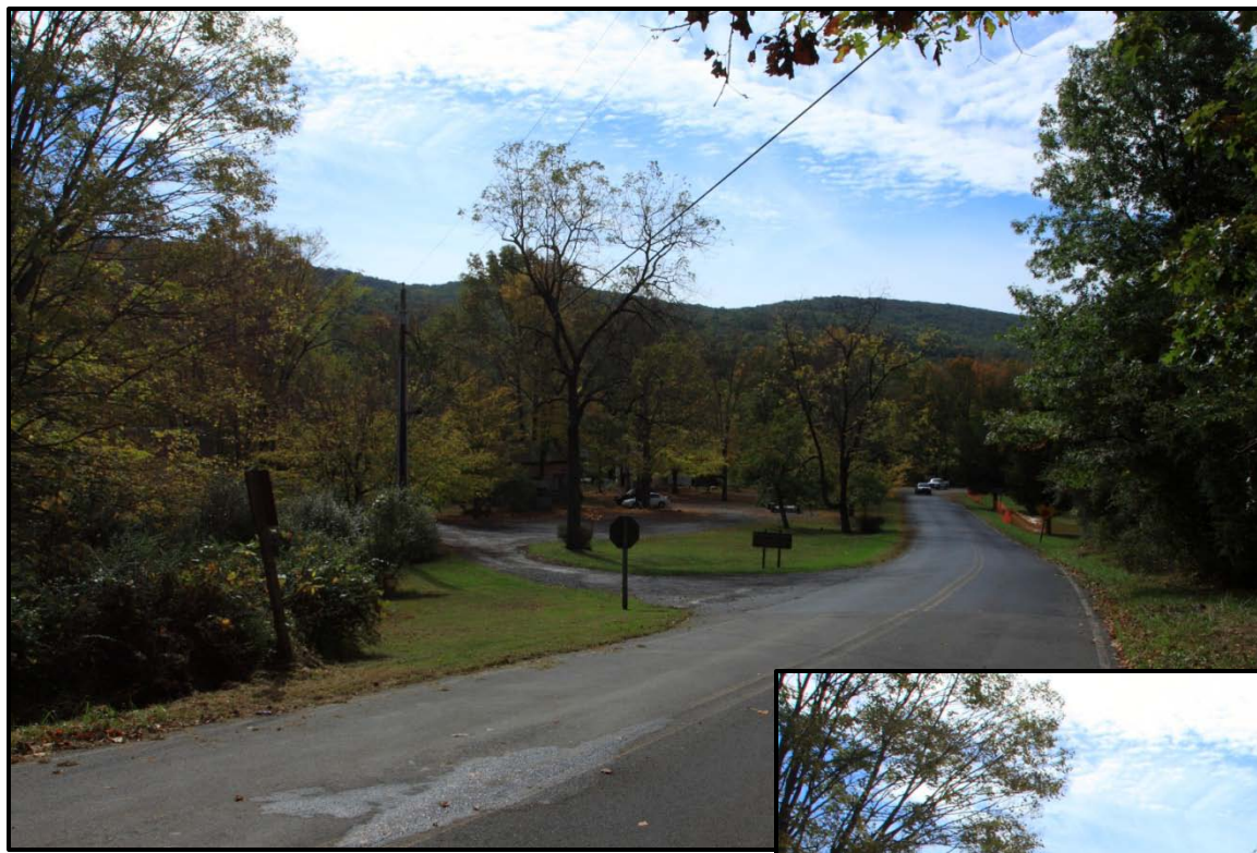
Existing Transmission Line at Millbrook Village