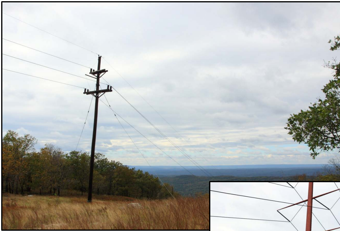
Existing Transmission Line at Appalachian Trail Crossing