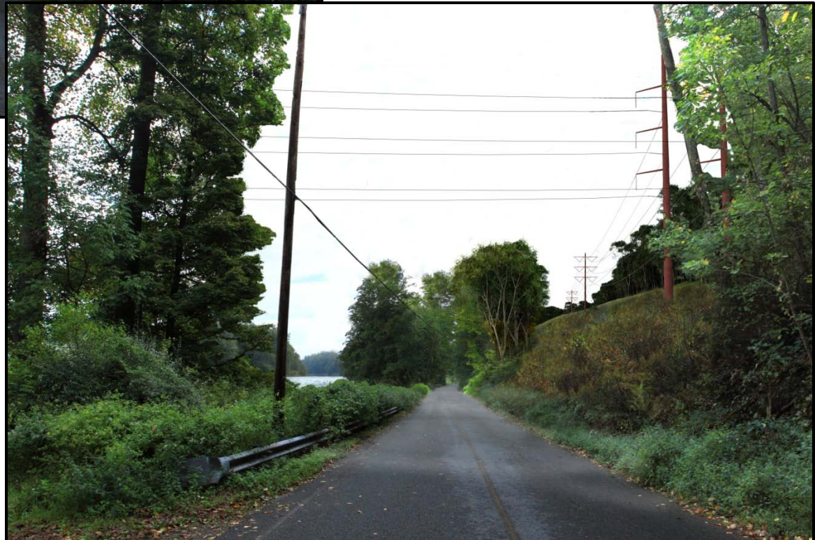
Proposed Transmission Line at Old Mine Road Crossing