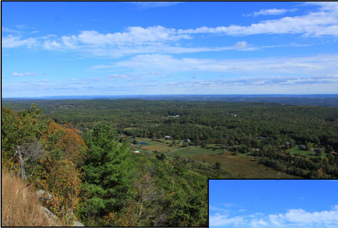
Proposed Transmission Line at Rattlesnake Ridge