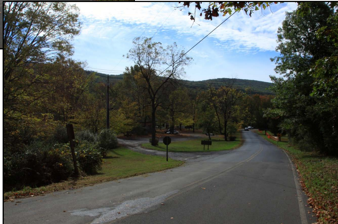
Alternatives 2 and 2b