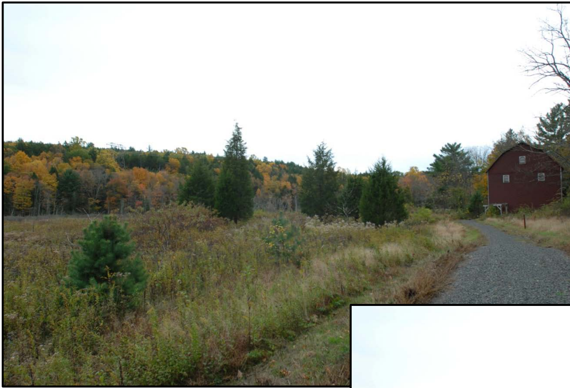
Proposed Transmission Line at McDade Trail, Schoonover House