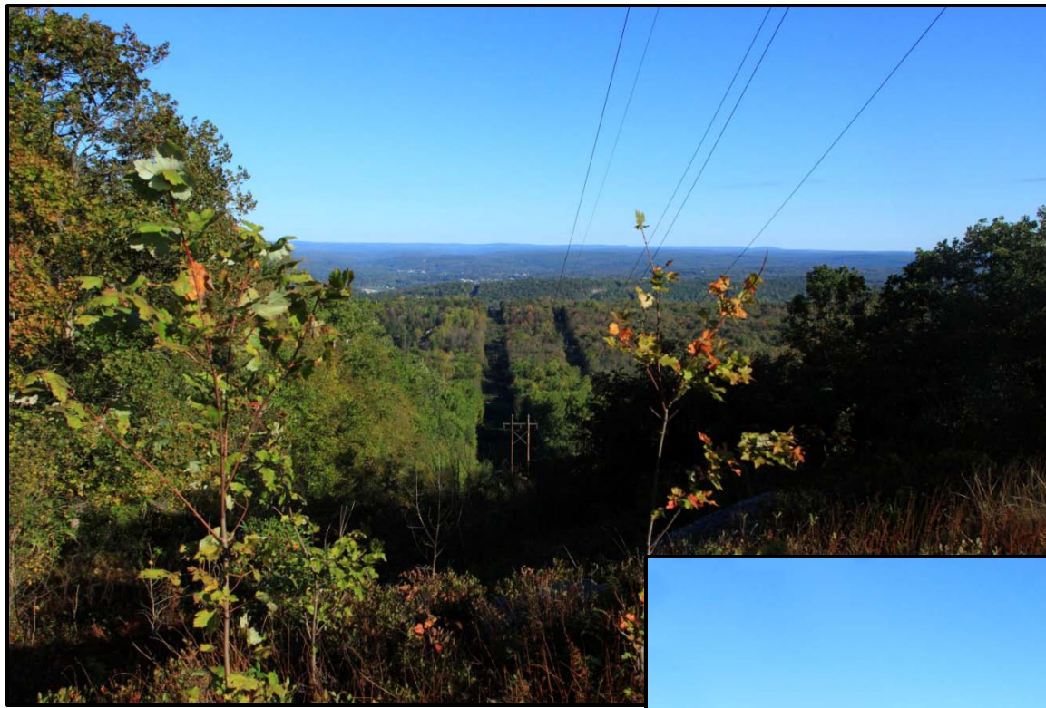
Proposed Transmission Line at Appalachian Trail Crossing