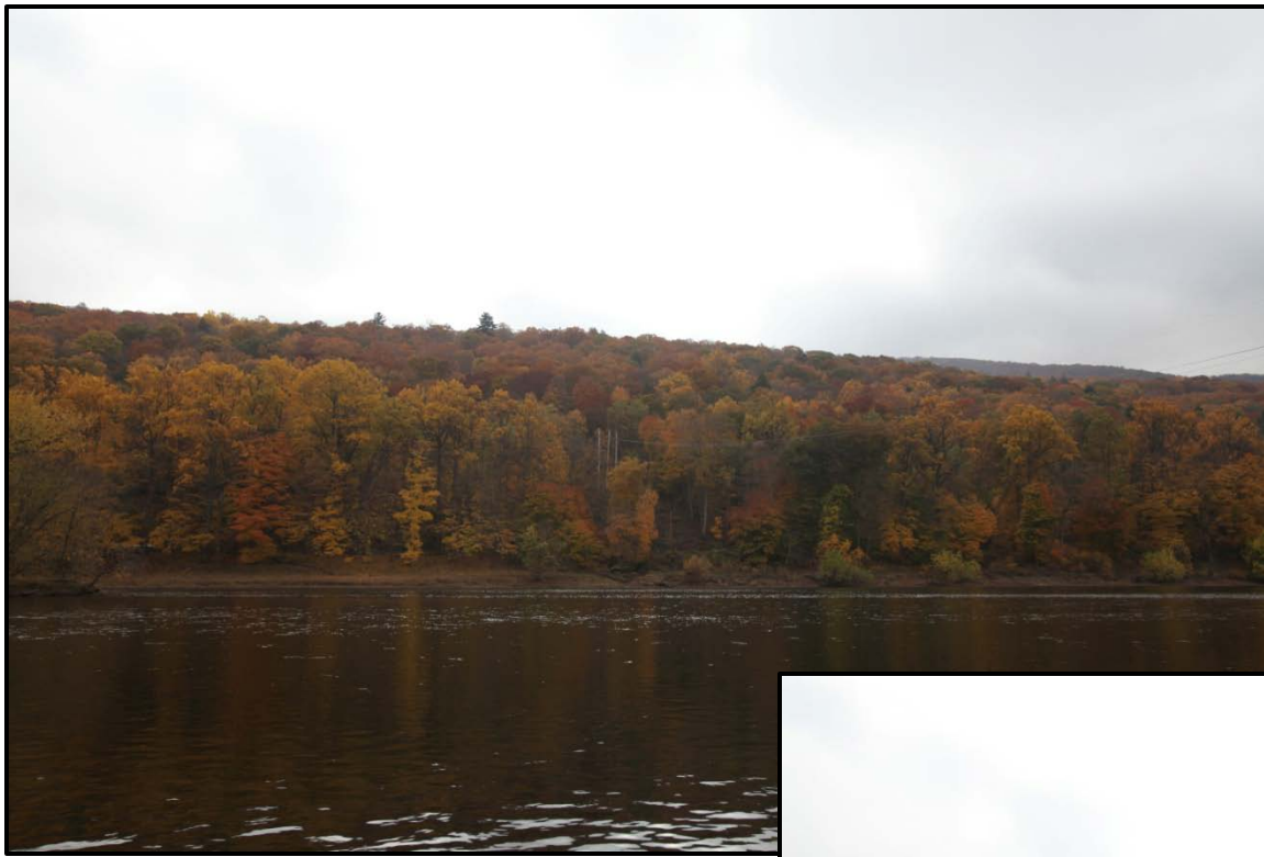
Proposed Transmission Line at Delaware River Crossing