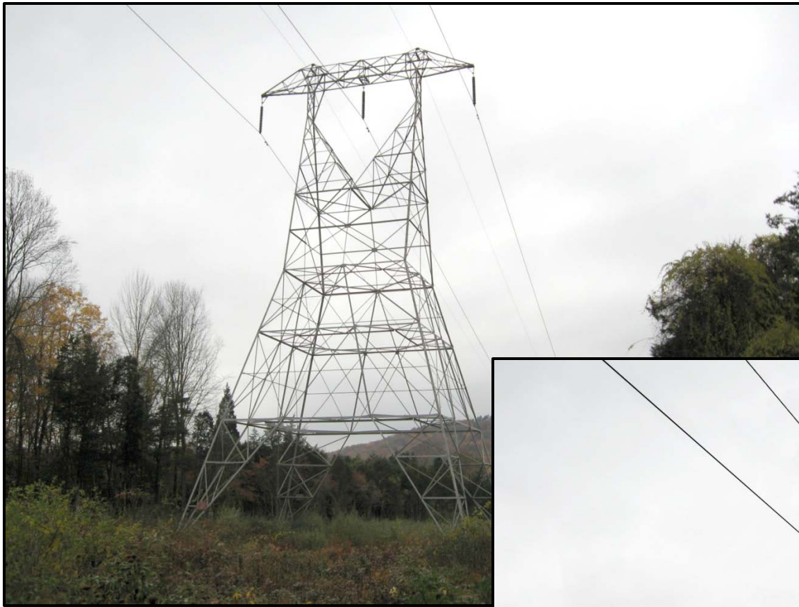
Existing Transmission Line at Pioneer Trail