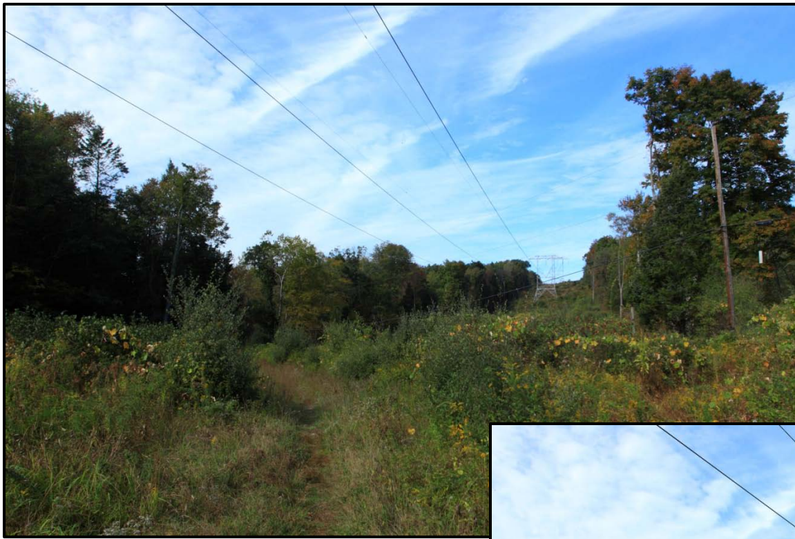
Existing Transmission Line at Van Campens Trail