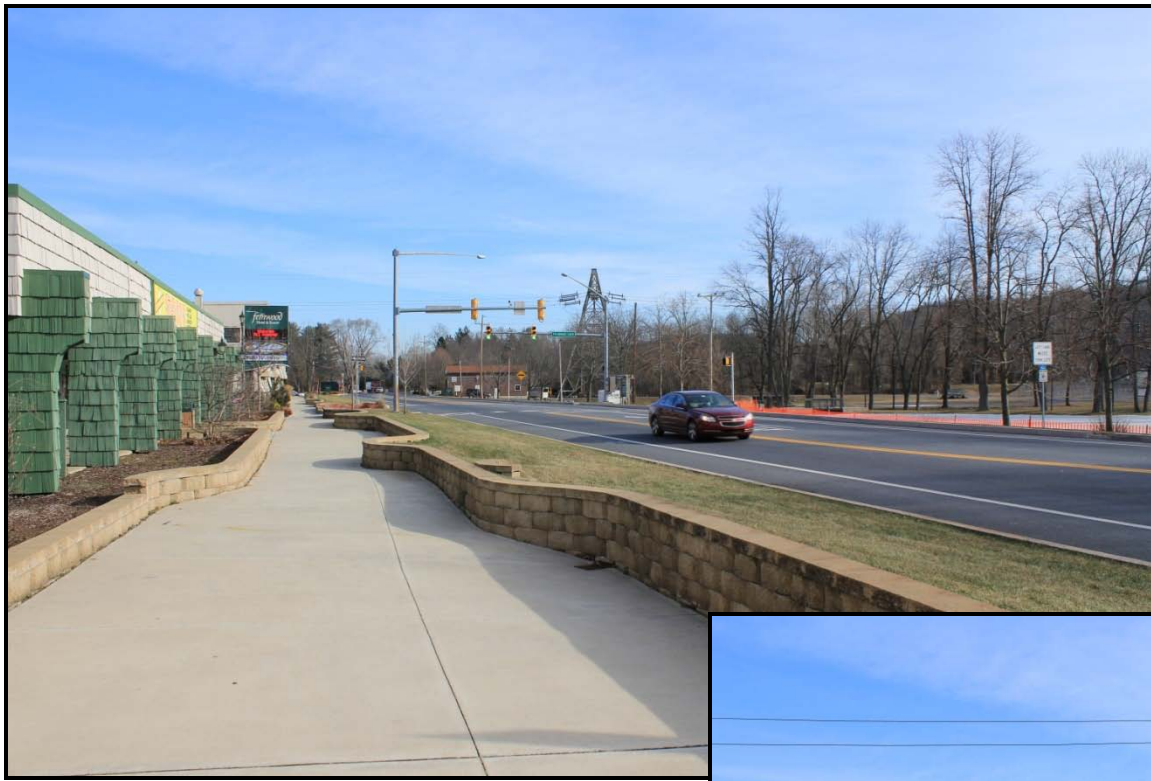
Existing Transmission Line at Fernwood