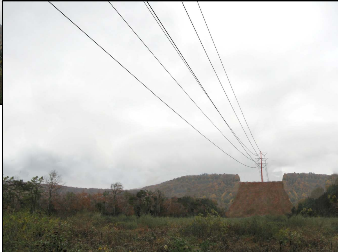
Alternatives 2 and 2b