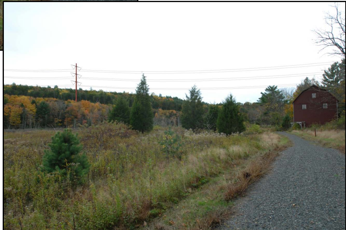
Alternatives 2 and 2b