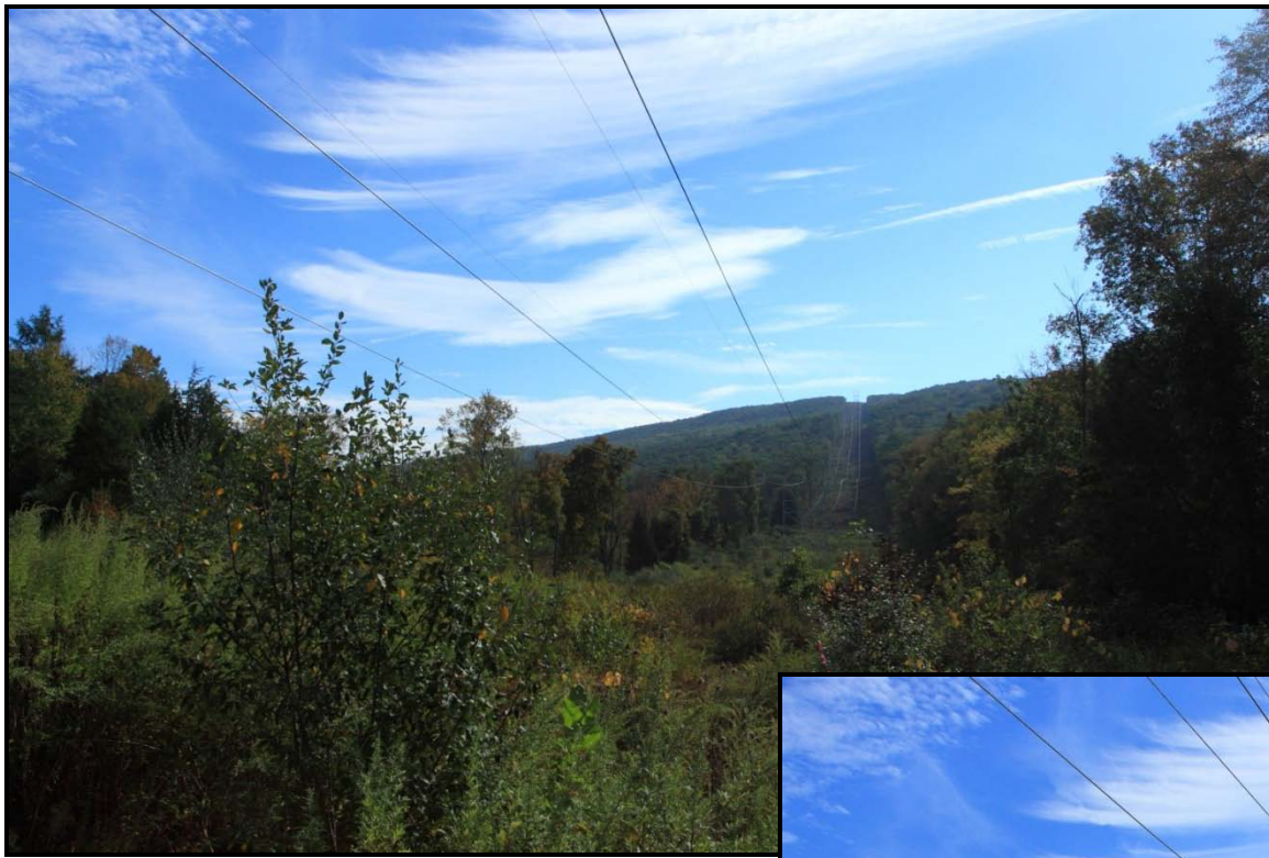
Proposed Transmission Line at Old Mine Road