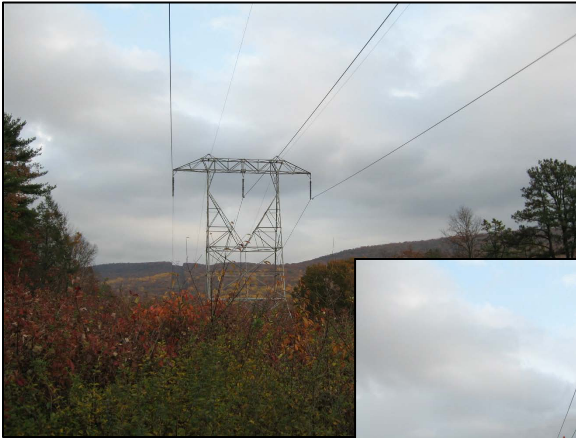
Existing Transmission Line at Hamilton Ridge Trail