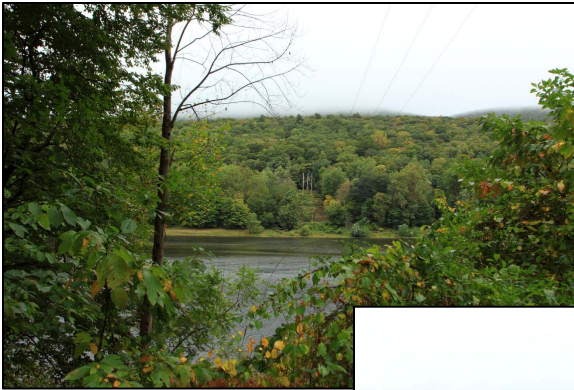
Proposed Transmission Line at McDade Trail Crossing