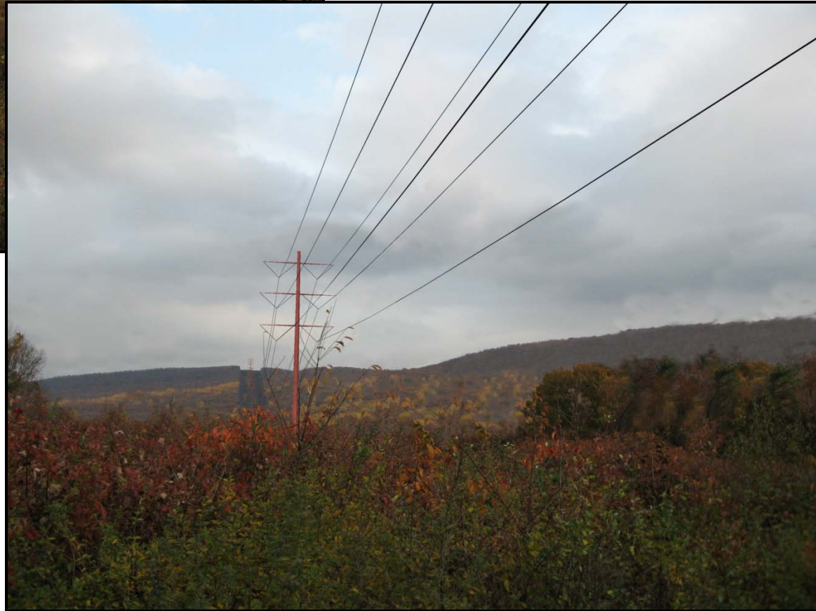
Alternatives 2 and 2b