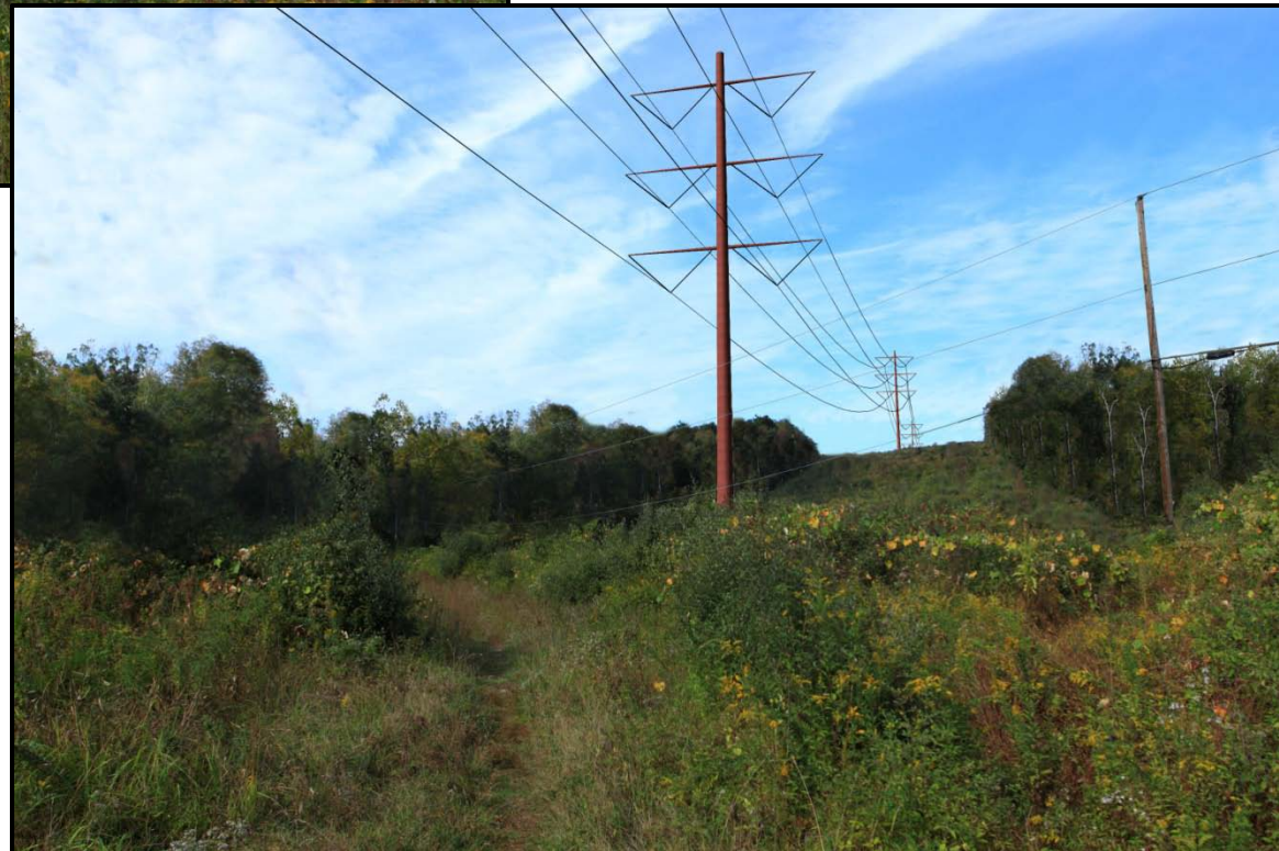
Alternatives 2 and 2b