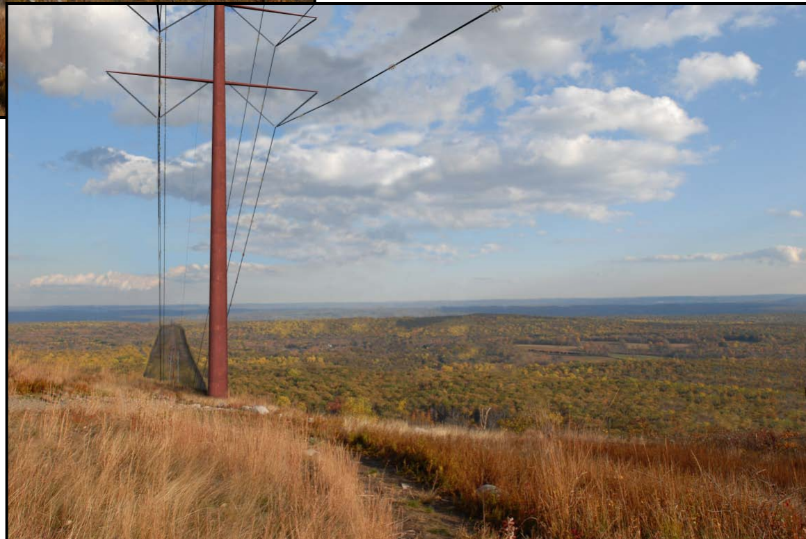
Alternatives 2 and 2b