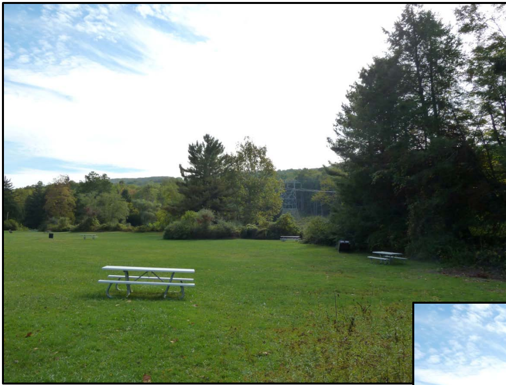
Proposed Transmission Line at Watergate Picnic Area