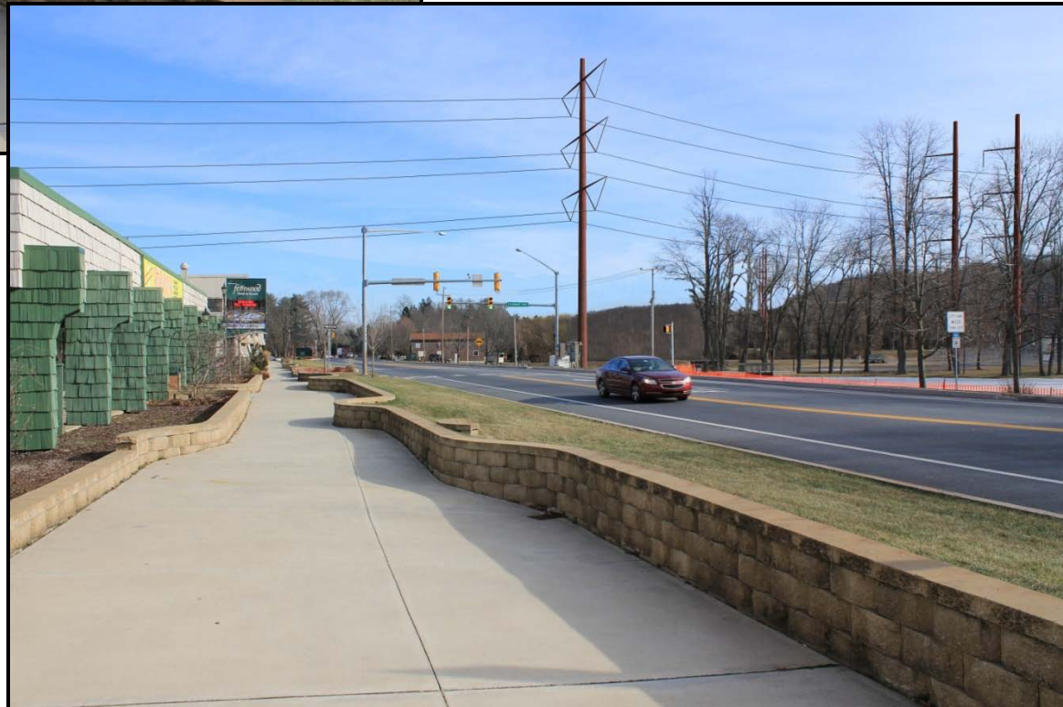
Proposed Transmission Line at Fernwood