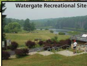
Watergate Recreational Site