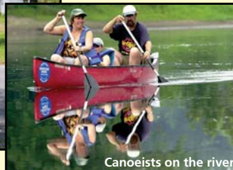
Canoeists on the river