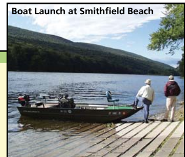
Boat Launch at Smithfield Beach