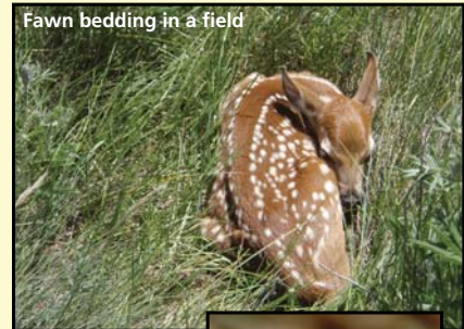
Fawn bedding in a field