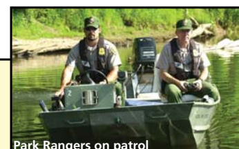
Park Rangers on patrol