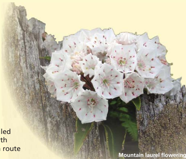
Mountain laurel flowering

Planning for the S-R Line EIS is progressing. The NPS has compiled relevant data, conducted scoping and focus group meetings with park stakeholders, and developed and refined the transmission route alternatives based on your input received earlier in the year.