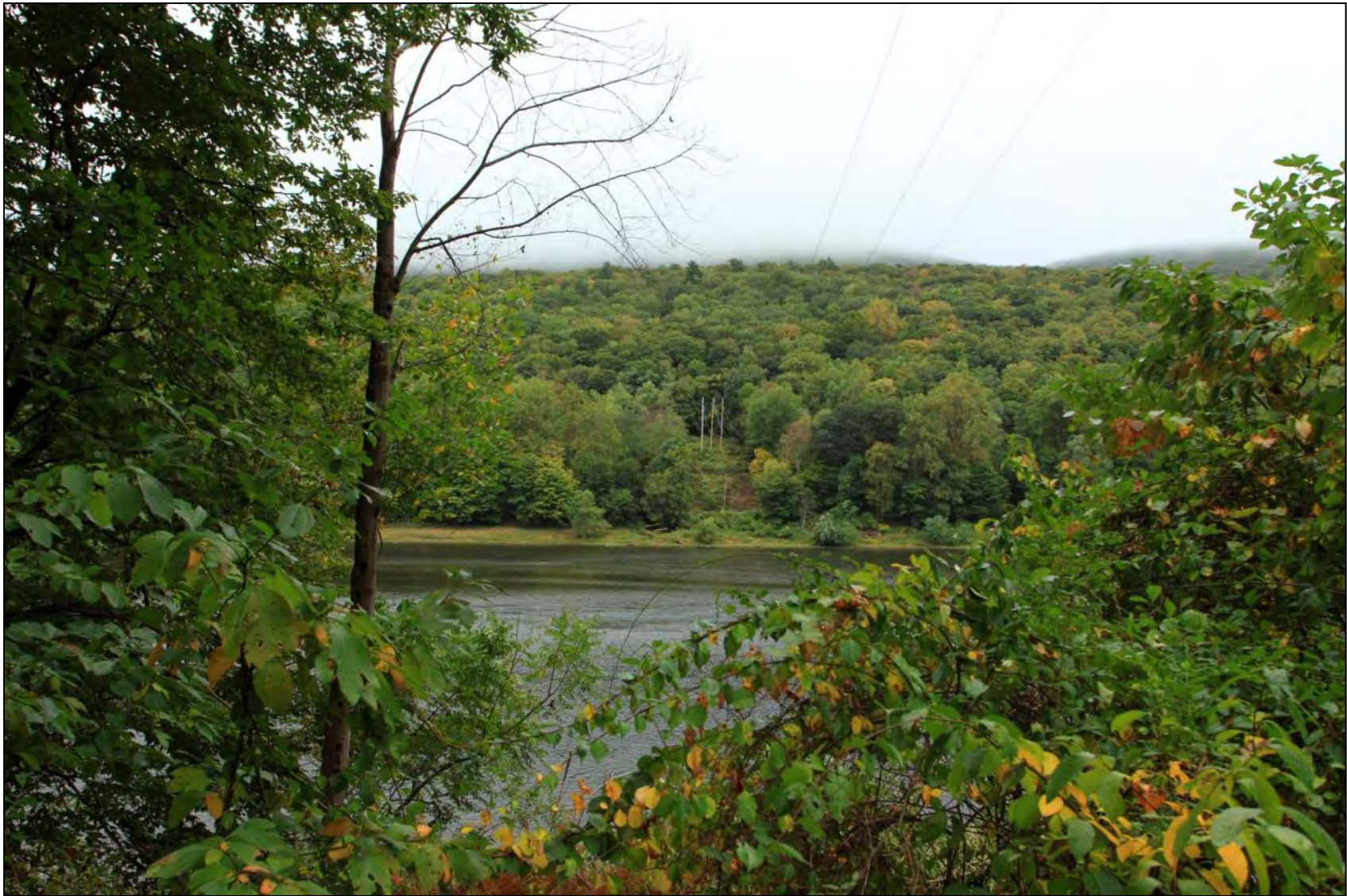
FIGURE 3-4, EXISTING: MCDADE TRAIL