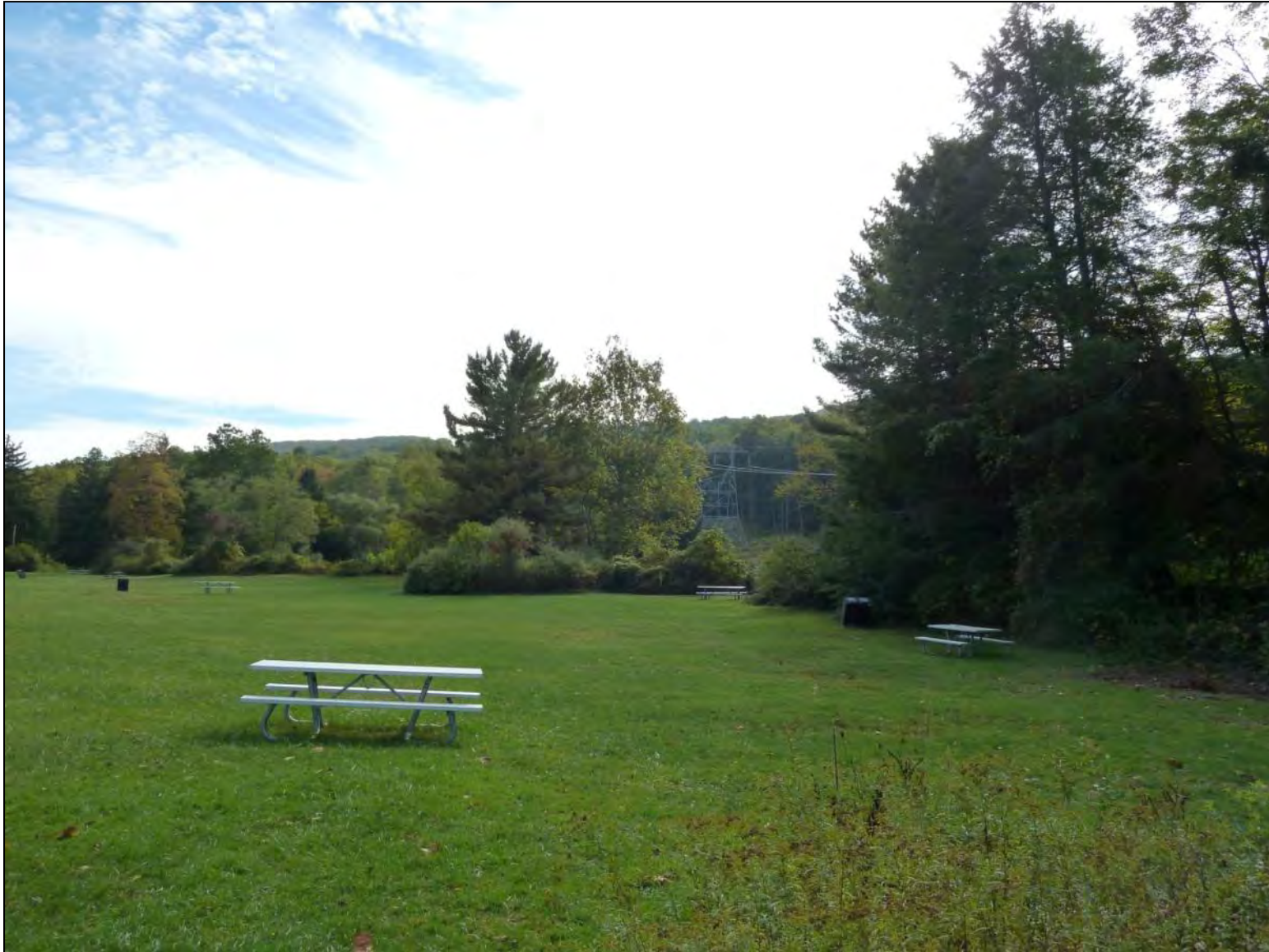
FIGURE 2B-8, EXISTING: WATERGATE RECREATION SITE