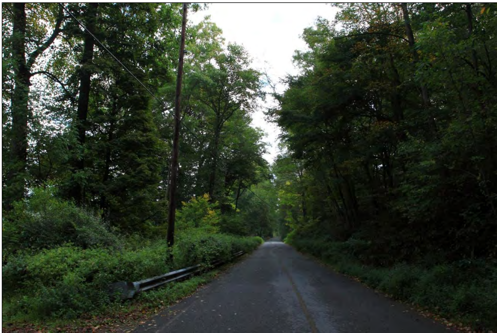
FIGURE 3-5, EXISTING: OLD MINE ROAD, AT ALTERNATIVE 3 CROSSING