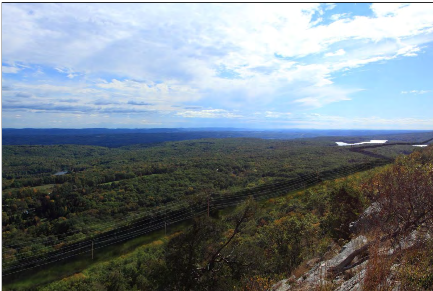
FIGURE 3-17, PROPOSED