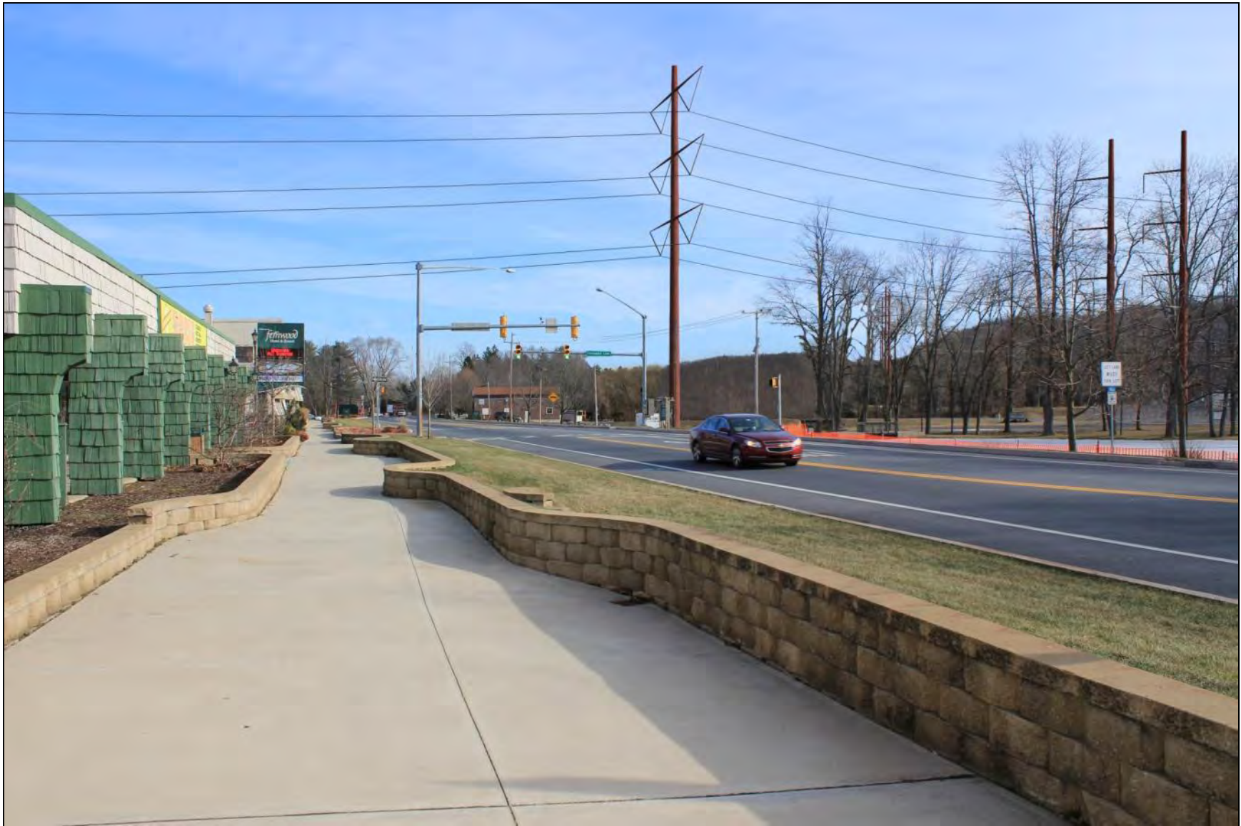
FIGURE 2-1, PROPOSED