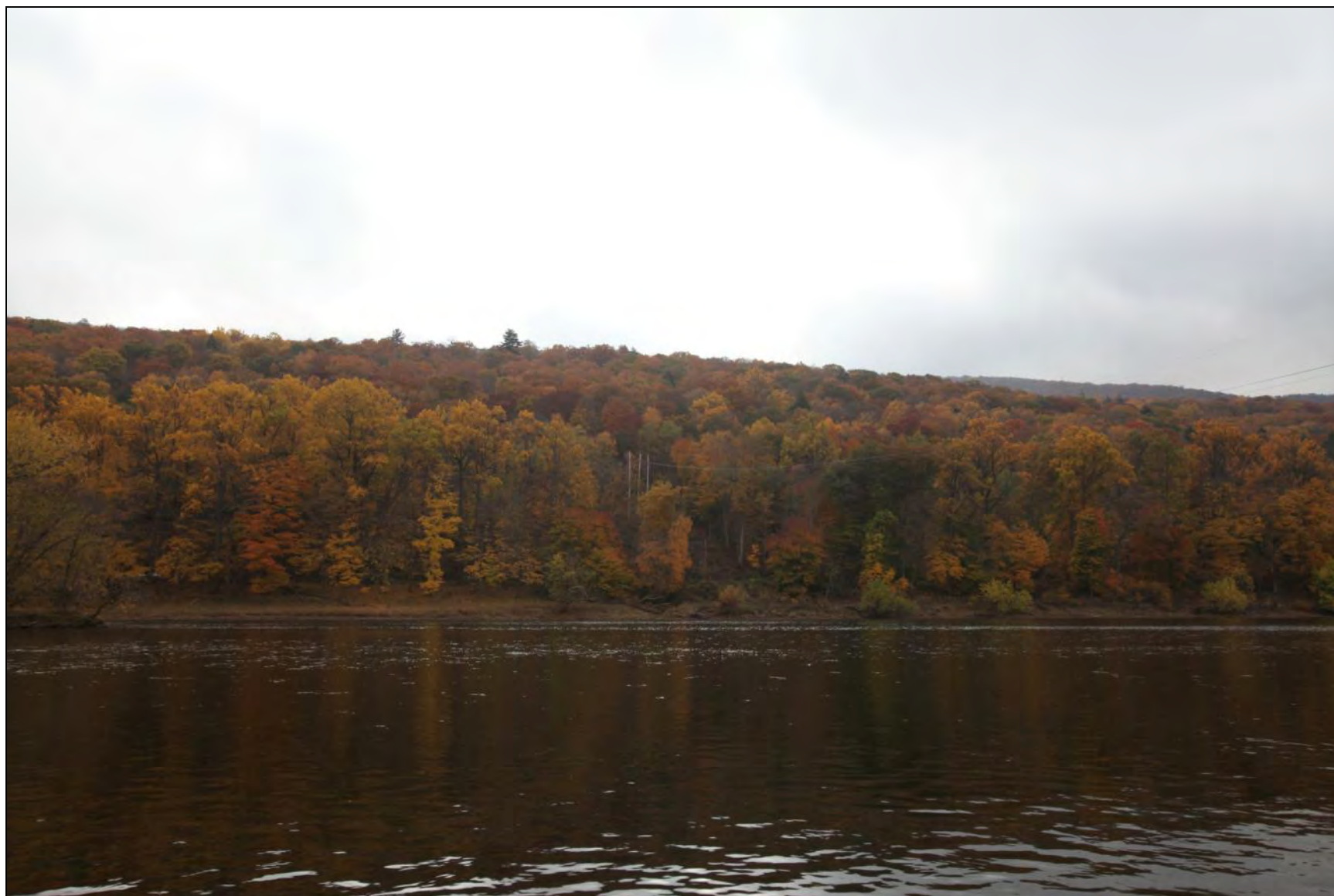
FIGURE 3-9, EXISTING: MDSR AT ALTERNATIVE 3 CROSSING