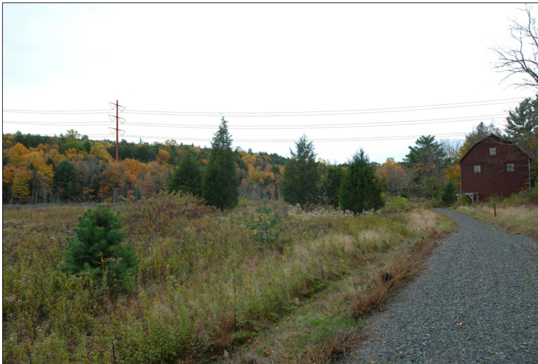
FIGURE 2B-2, PROPOSED