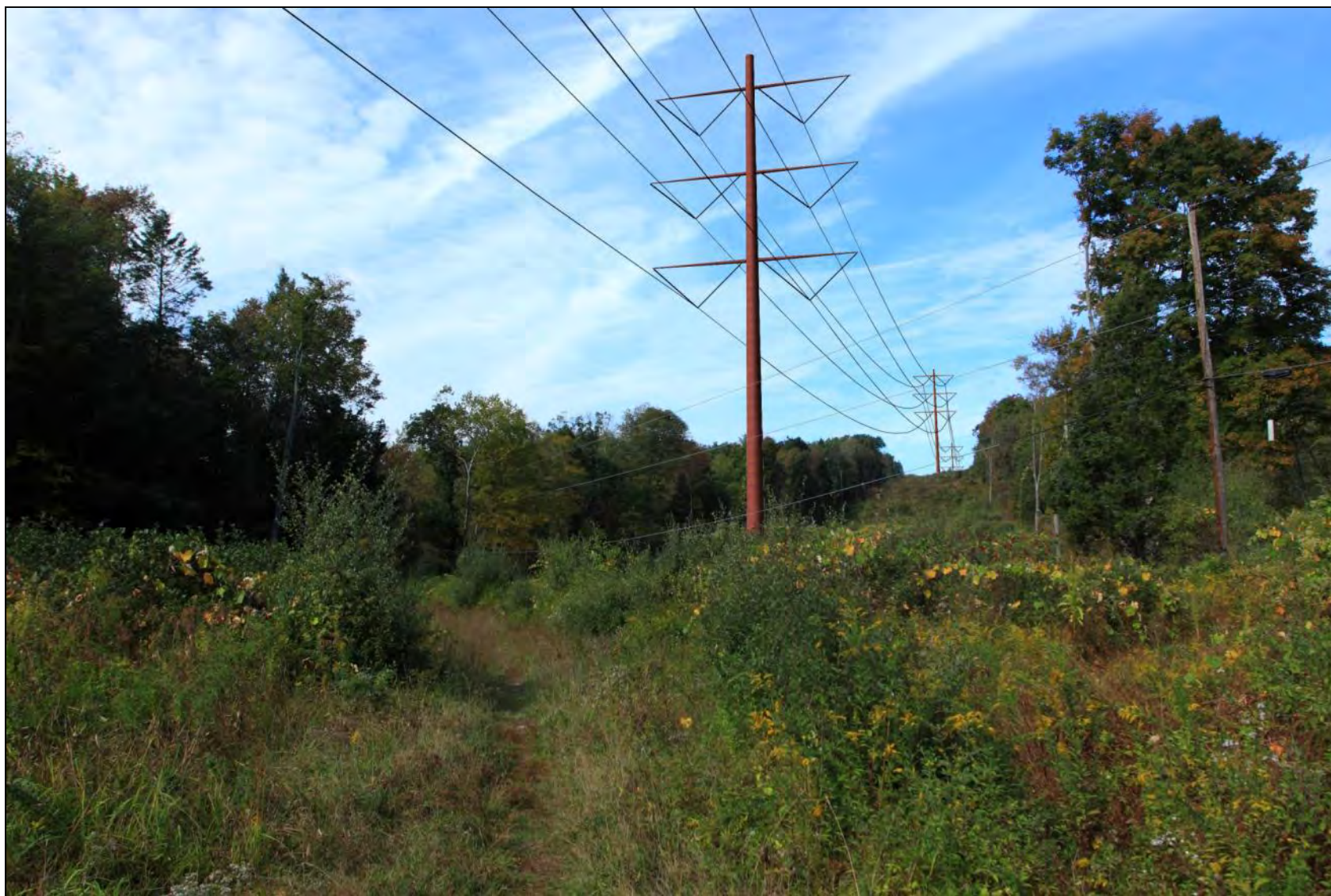
FIGURE 2B-9, PROPOSED