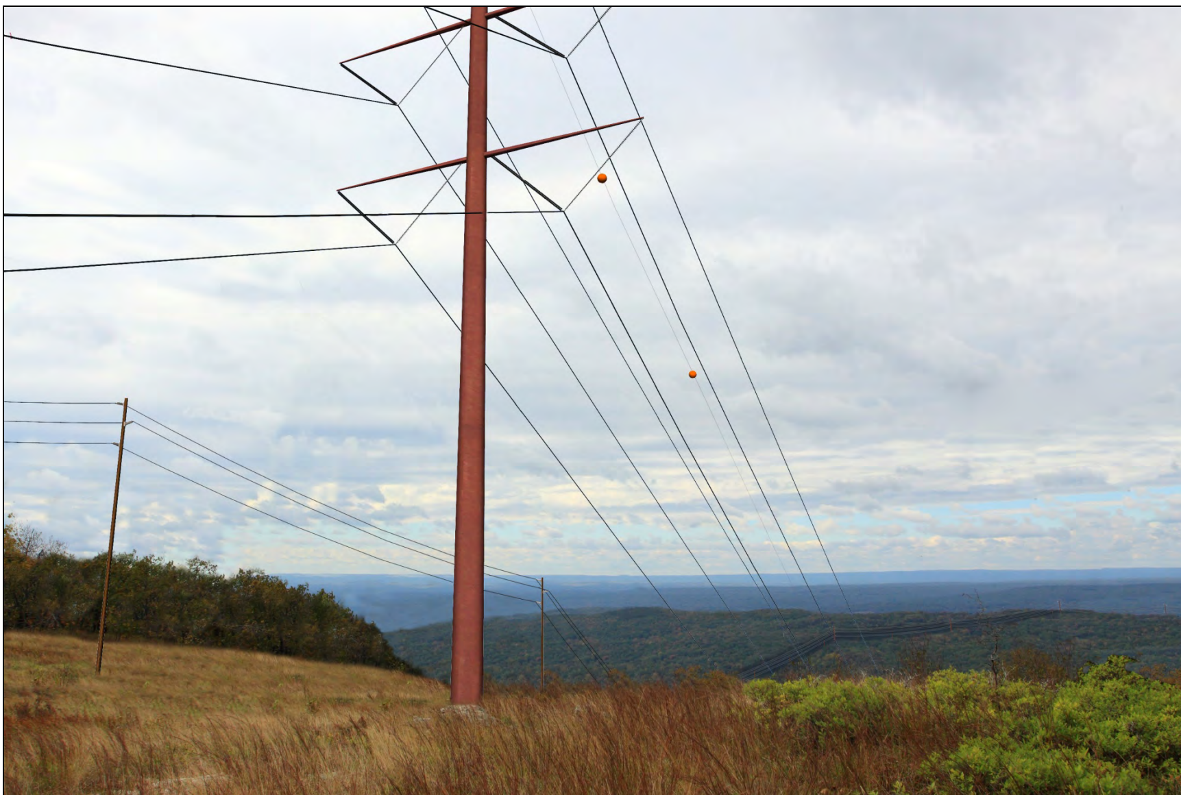
FIGURE 3-13B, PROPOSED REPRESENTATIVE OF MIGRATORY BIRD DIVERter DEVICES (MARKER BALLS) ON THE STATIC WIRE. APLIC-APPROVED BIRD DIVERter DEVICES OF SOME TYPE WOULD BE REQUIRED WHERE ANY ALTERNATIVE ALIGNMENT CROSSES MDSR AND KITTATINNY RIDGE.