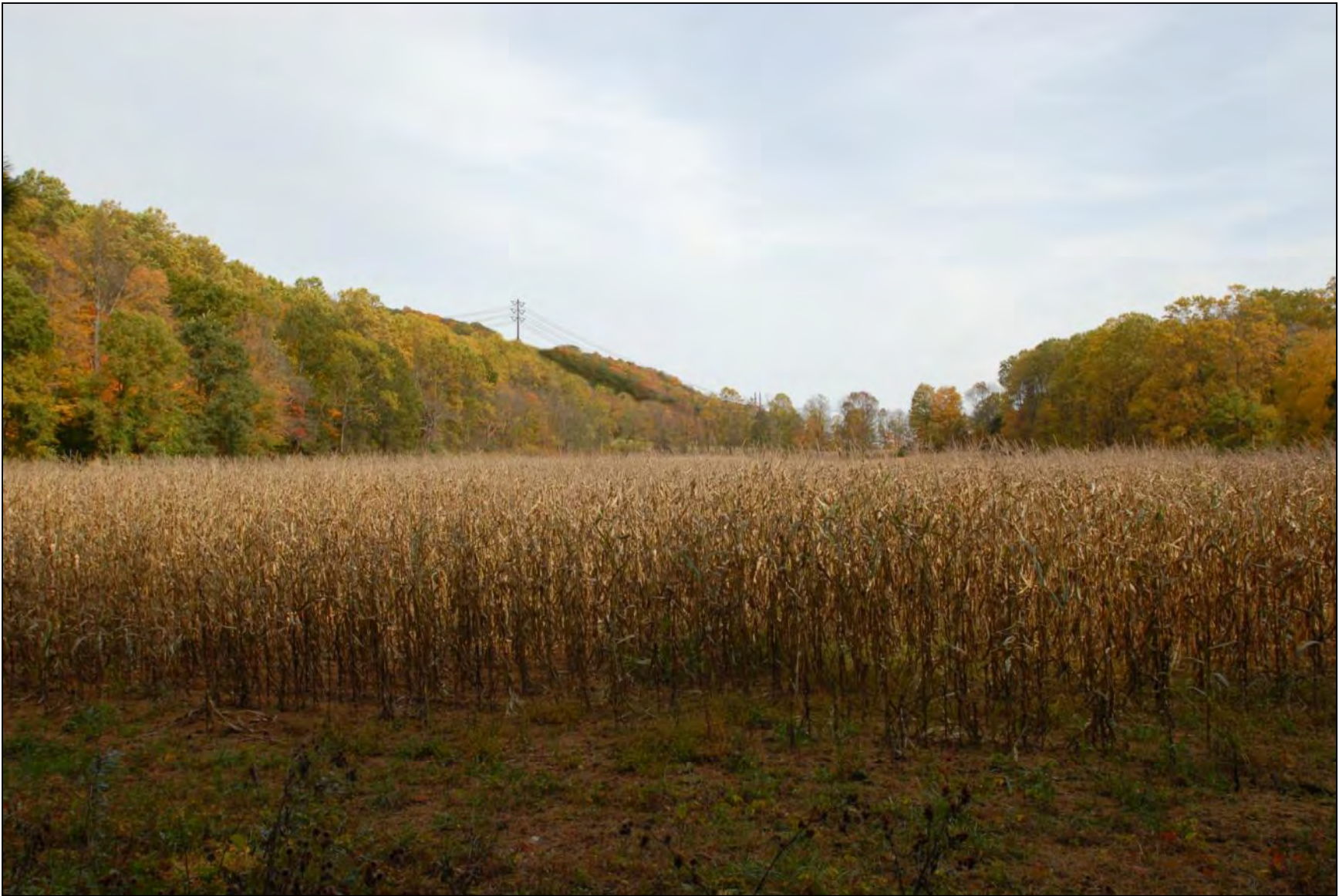
FIGURE 3-7, PROPOSED