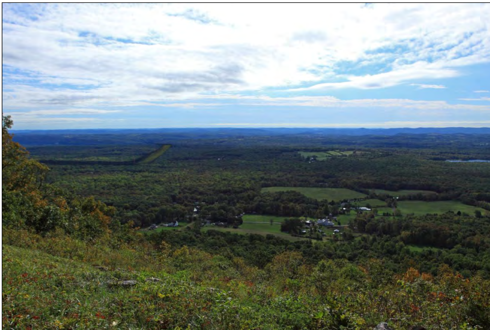
FIGURE 4-6, PROPOSED