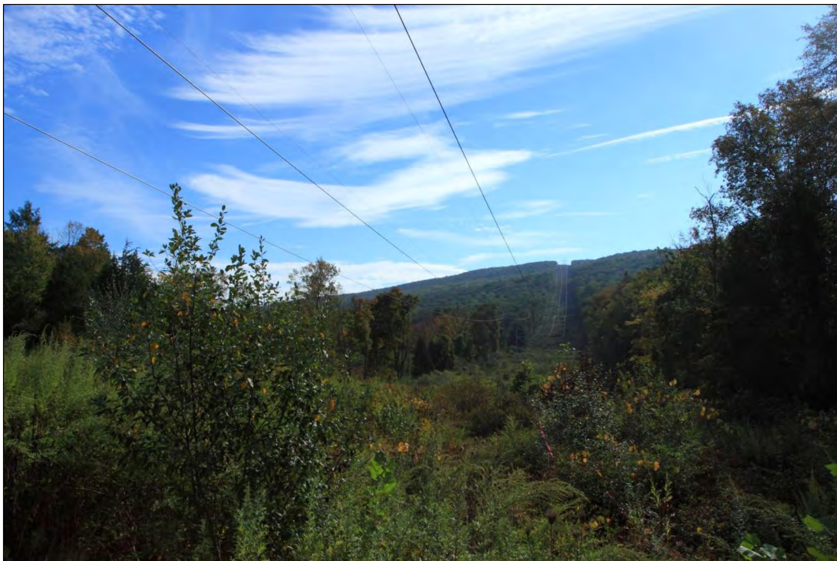
FIGURE 2-7, EXISTING: OLD MINE ROAD AT ALTERNATIVE 2 CROSSING