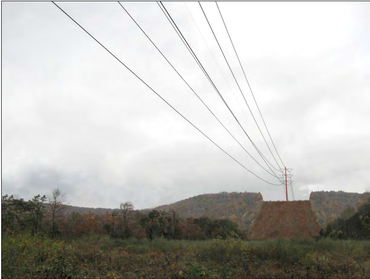
FIGURE 2-5, PROPOSED