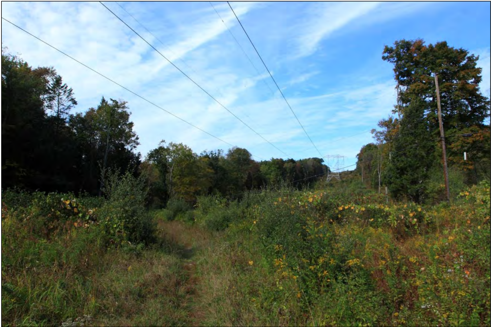
FIGURE 2B-9, EXISTING: VAN CAMPENS GLEN TRAIL