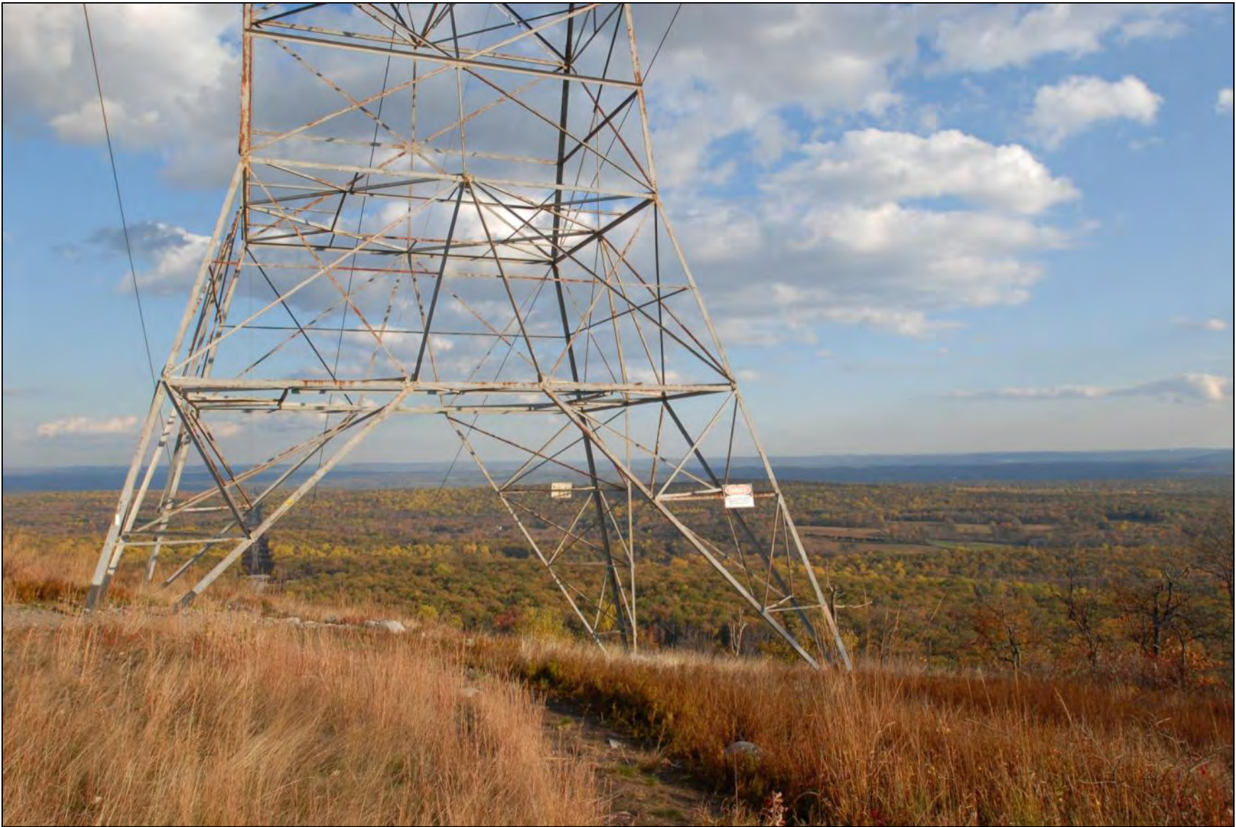
FIGURE 2-11, EXISTING: APPA AT ALTERNATIVE 2 CROSSING