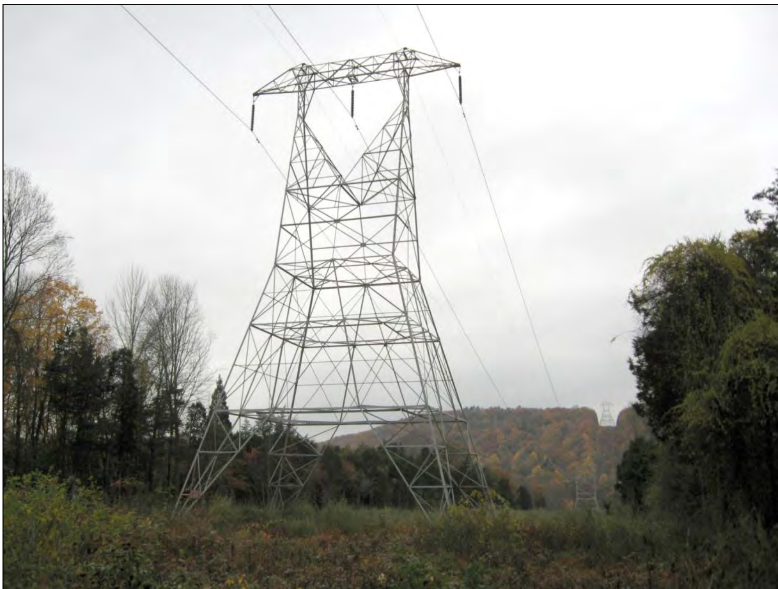
FIGURE 2-5, EXISTING: PIONEER TRAIL