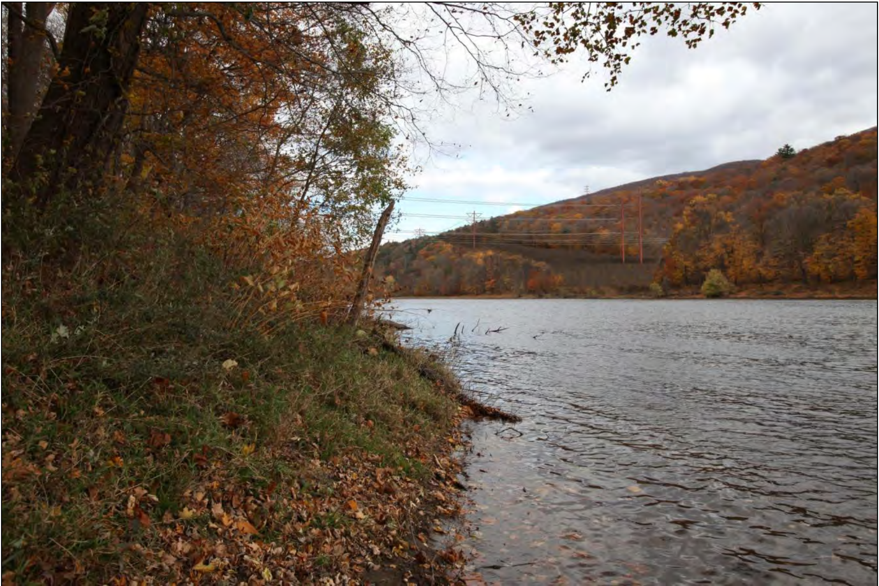
FIGURE 3-6, PROPOSED