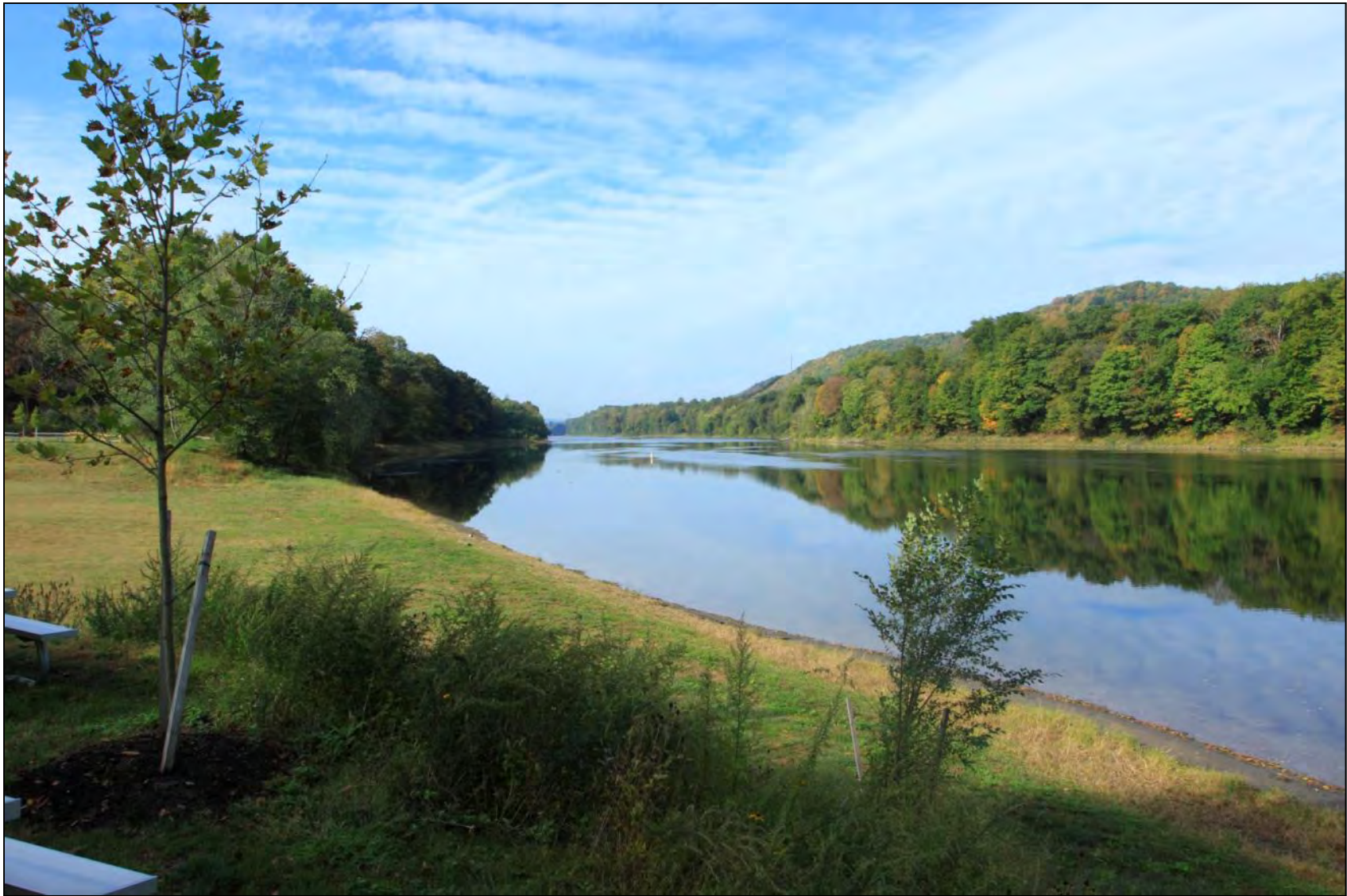
FIGURE 3-11, PROPOSED