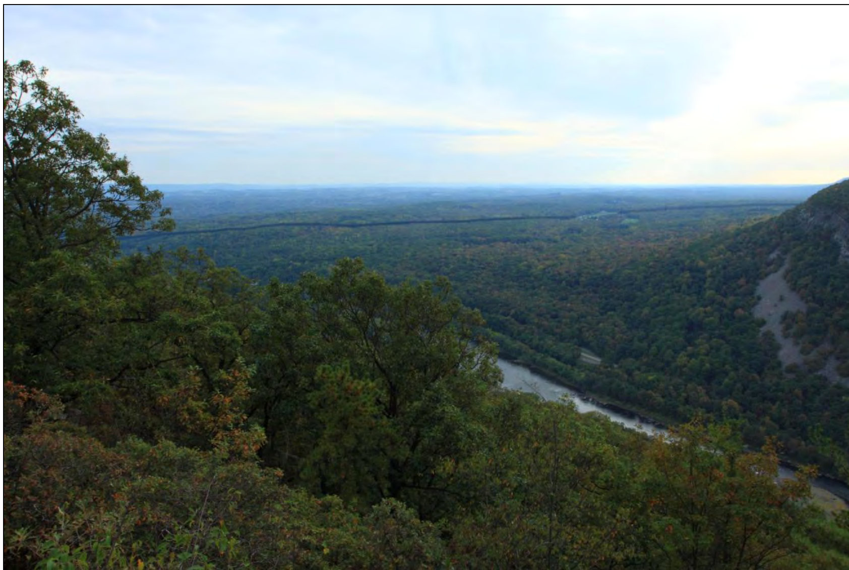
FIGURE 4-1, PROPOSED