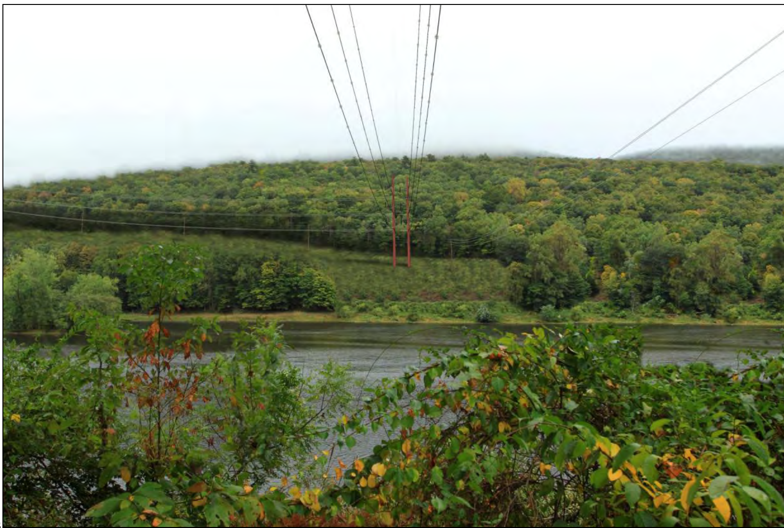
FIGURE 3-4A, PROPOSED, REPRESENTATIVE OF MIGRATORY BIRD DIVERTER DEVICES (SPIRAL WIRE) ON THE 500-kV CONDUCTORS. APLIC-APPROVED BIRD DIVERTER DEVICES OF SOME TYPE WOULD BE REQUIRED WHERE ANY ALTERNATIVE ALIGNMENT CROSSES MDSR AND KITTATINNY RIDGE.