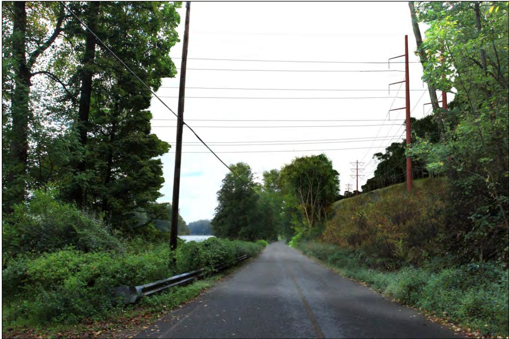
FIGURE 3-5, PROPOSED