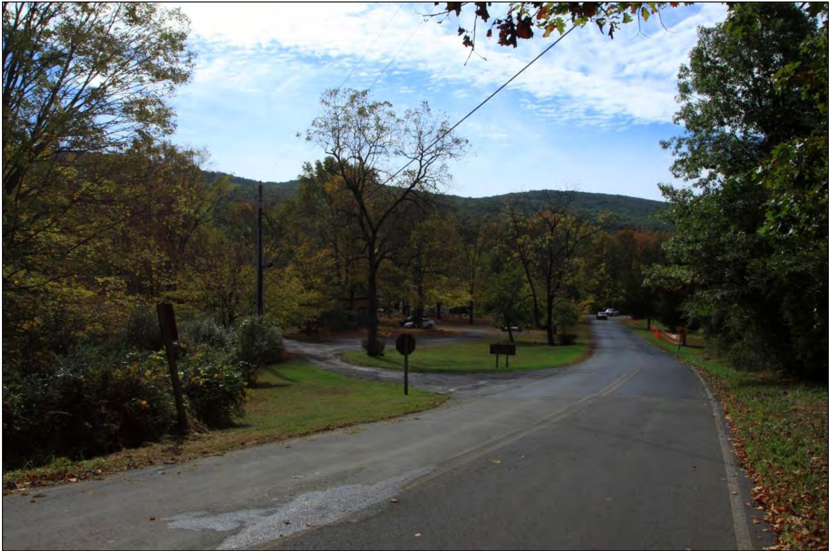
FIGURE 2-10, EXISTING: MILLBROOK VILLAGE