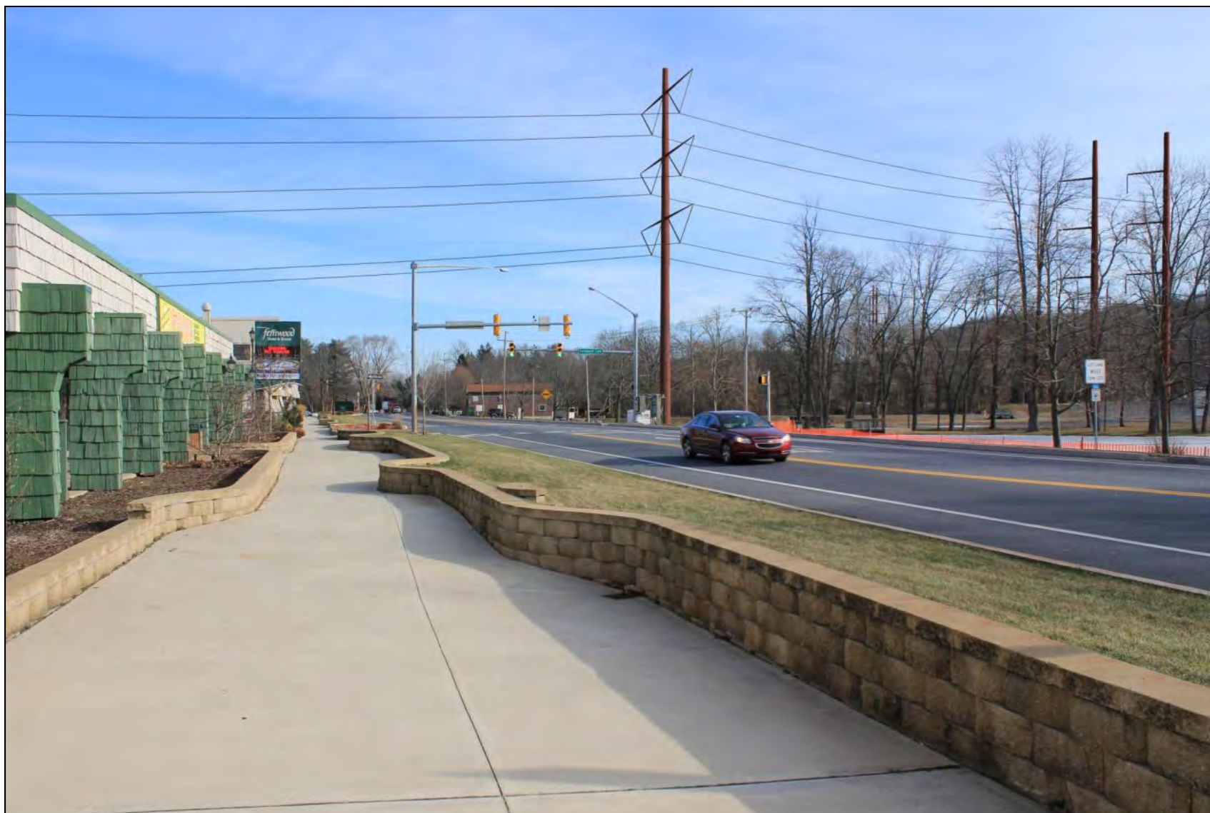
FIGURE 2B-1, PROPOSED: FERNWOOD RESORT, PA HWY 209