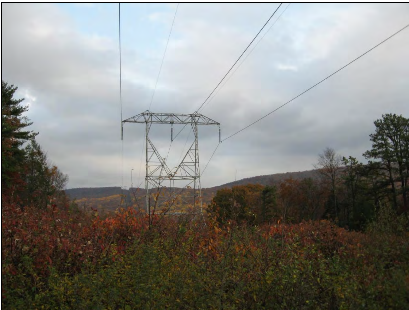
FIGURE 2-6, EXISTING: HAMILTON RIDGE TRAIL