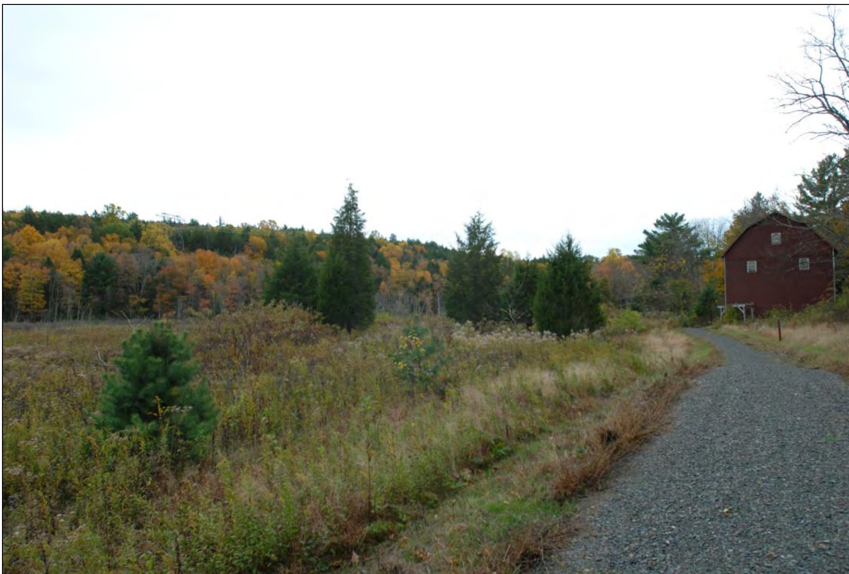
FIGURE 2-2, EXISTING: JOSEPH M. MCDADE RECREATIONAL TRAIL, NEAR SCHOONOVER HOUSE