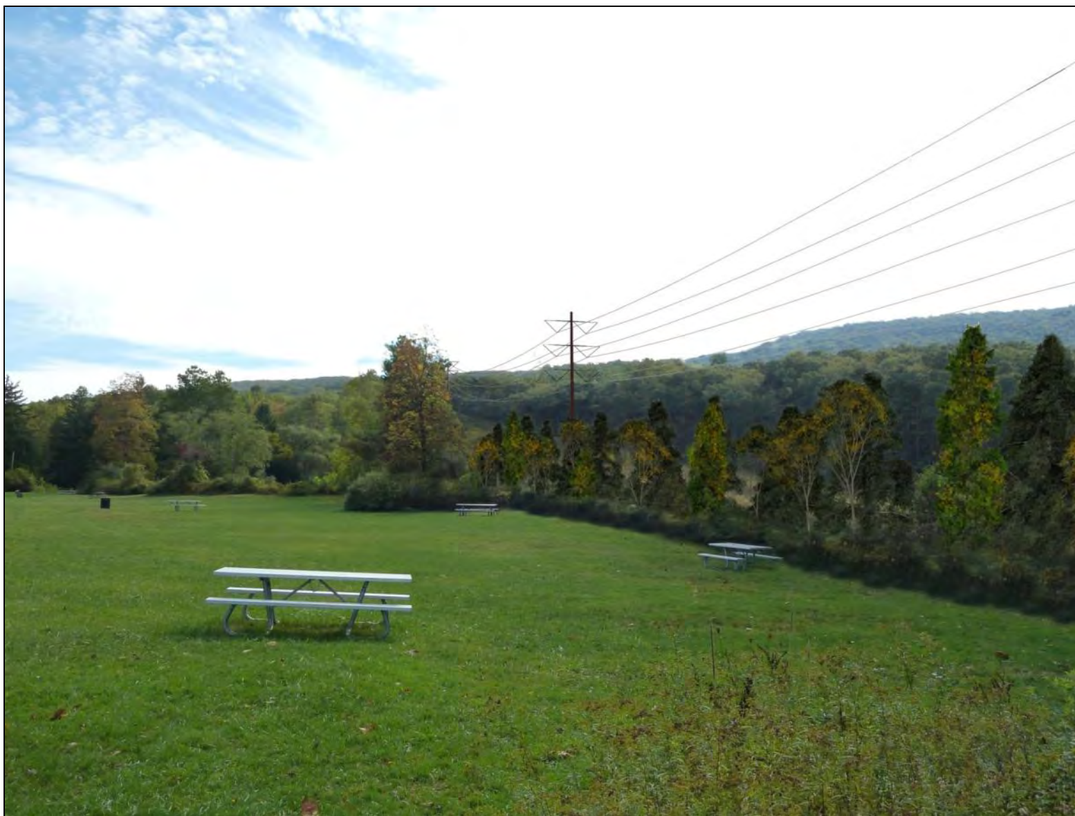
FIGURE 2-8, MITIGATION: CONCEPTUAL MITIGATION MEASURES AT WATERGATE RECREATION SITE