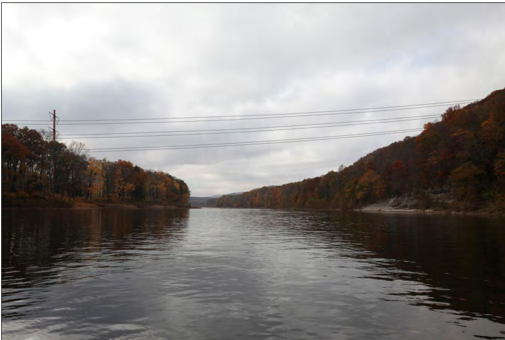
FIGURE 2B-3, PROPOSED