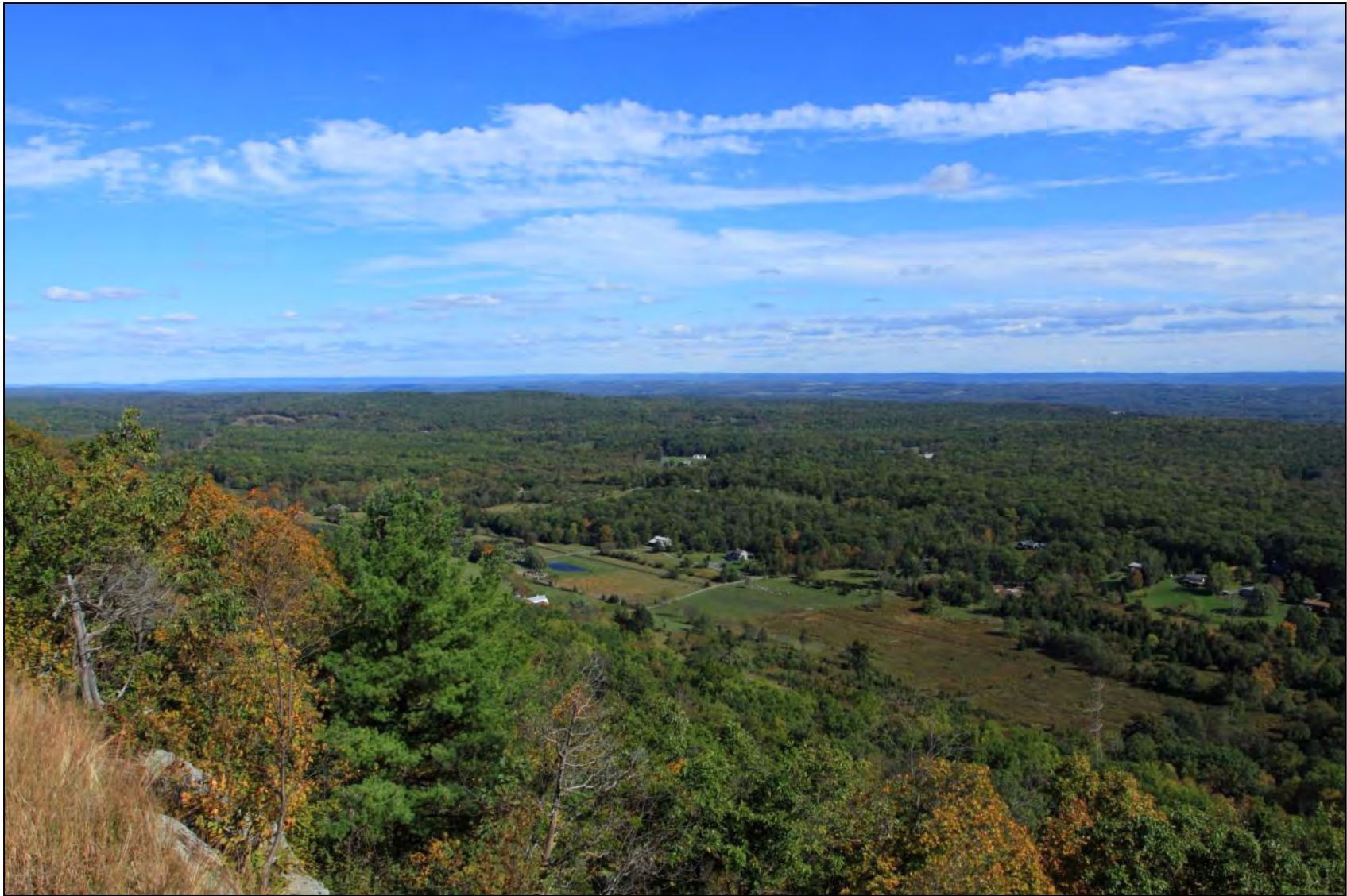
FIGURE 3-16, EXISTING: VISTA FROM RIDGE NEAR RATTLESNAKE SWAMP, NO. 1