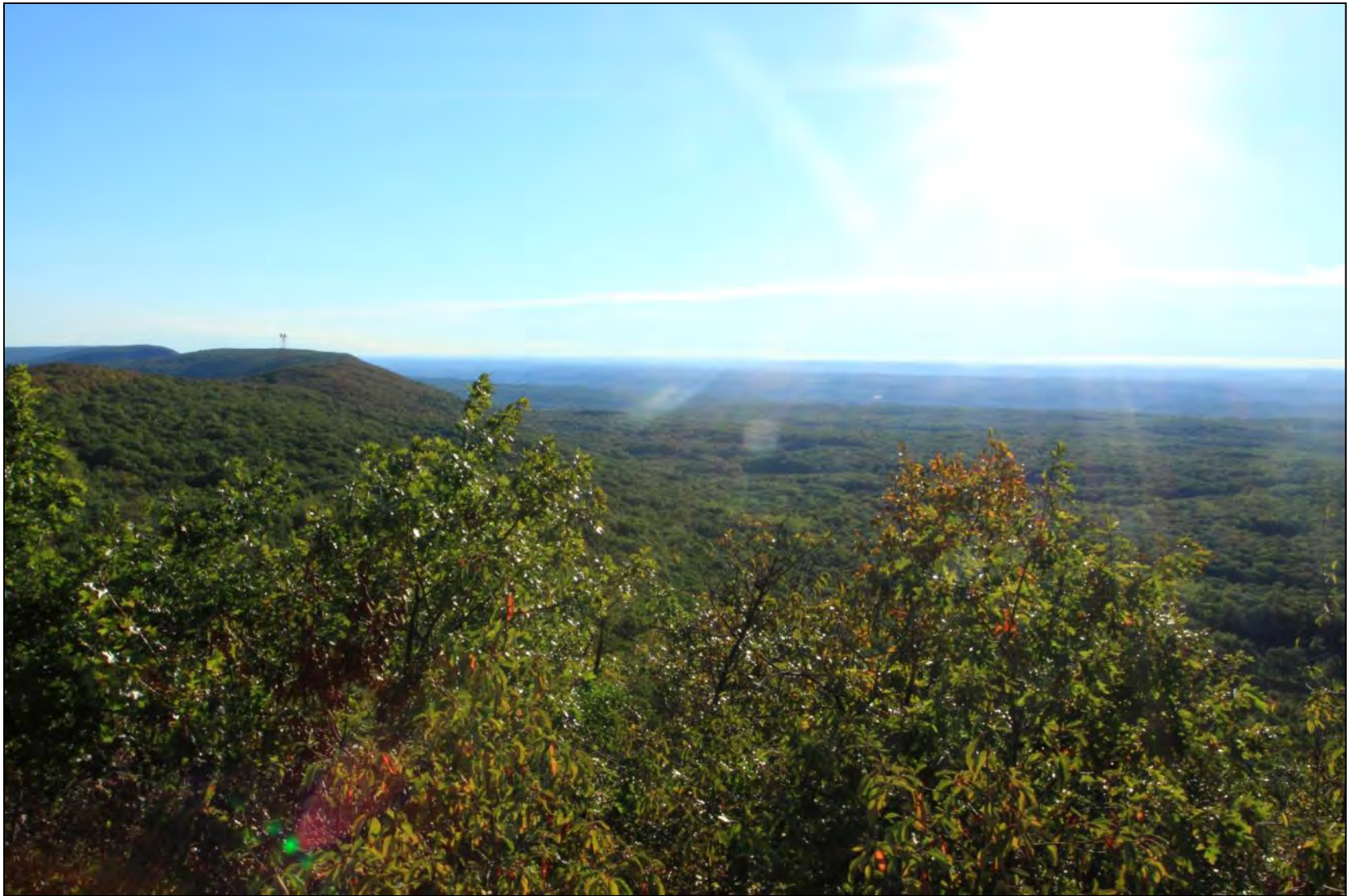
FIGURE 4-5, EXISTING: APPA AT LUNCH ROCKS