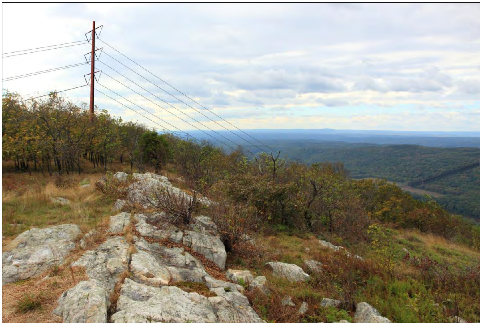
FIGURE 3-14, PROPOSED