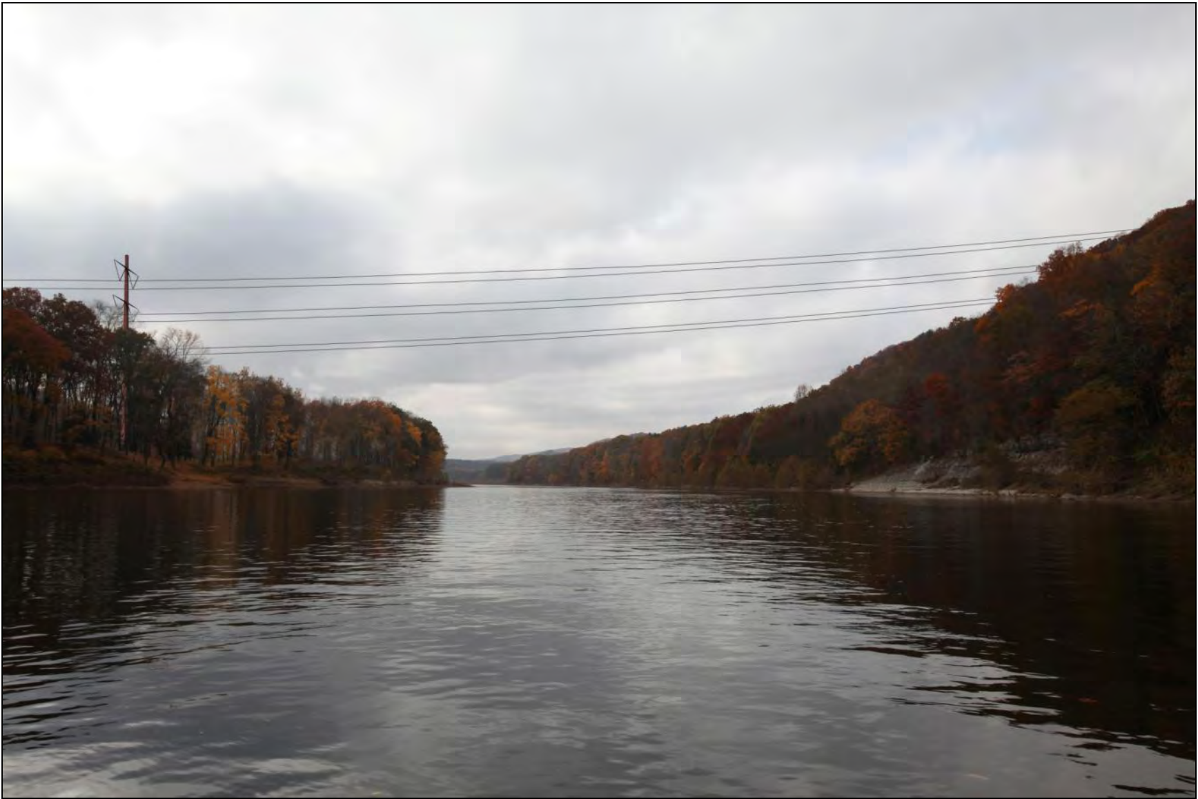
FIGURE 2-3, PROPOSED