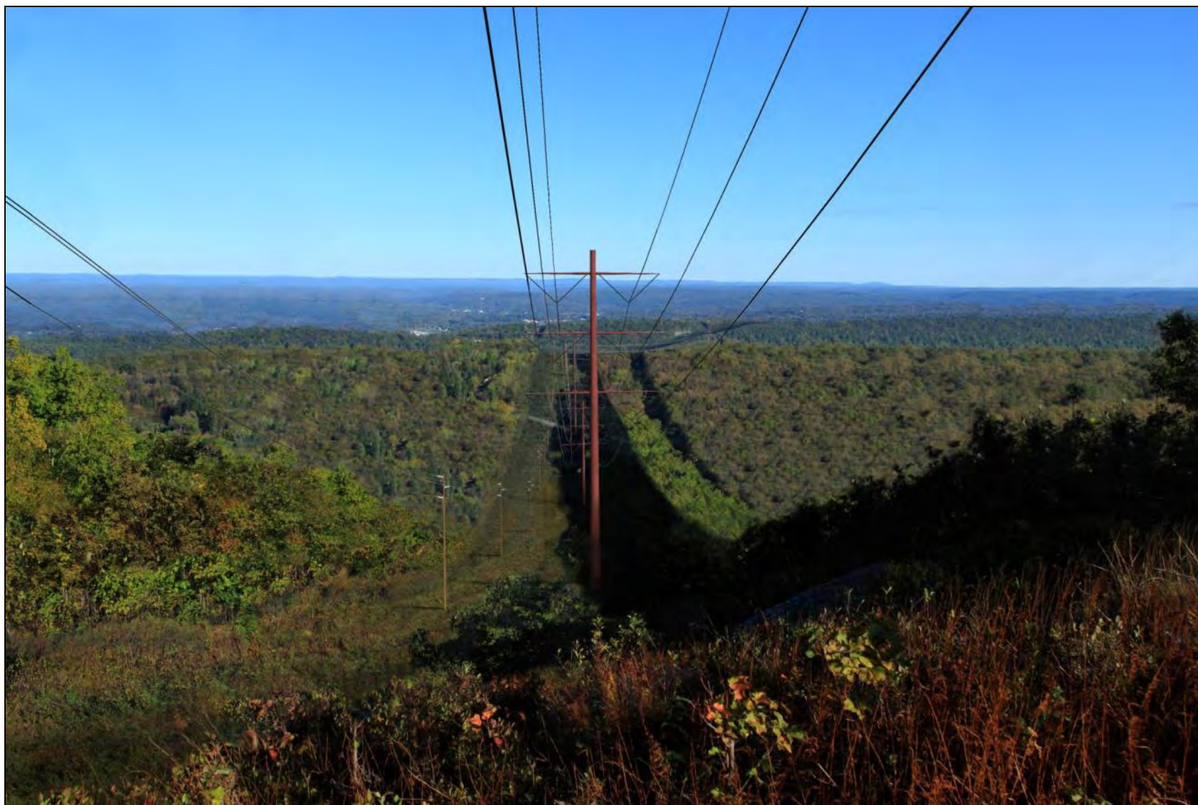
FIGURE 4-4, PROPOSED