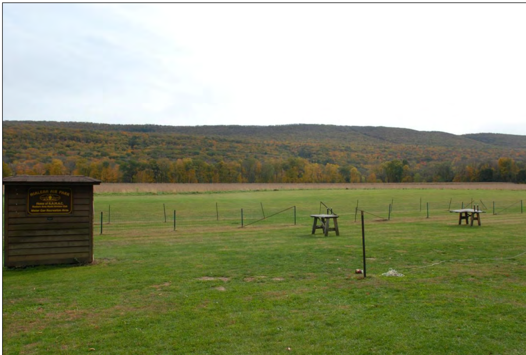
FIGURE 3-8, EXISTING: HIALEAH AIR PARK