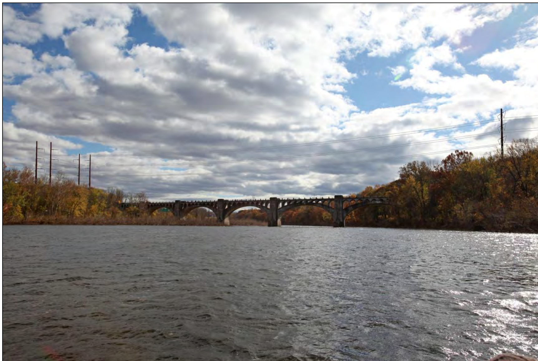
FIGURE 4-2, PROPOSED