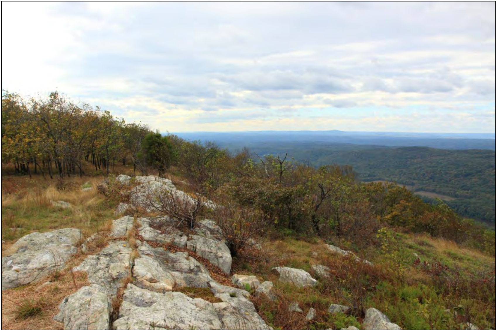
FIGURE 3-14, EXISTING: APPA AT RACCOON RIDGE