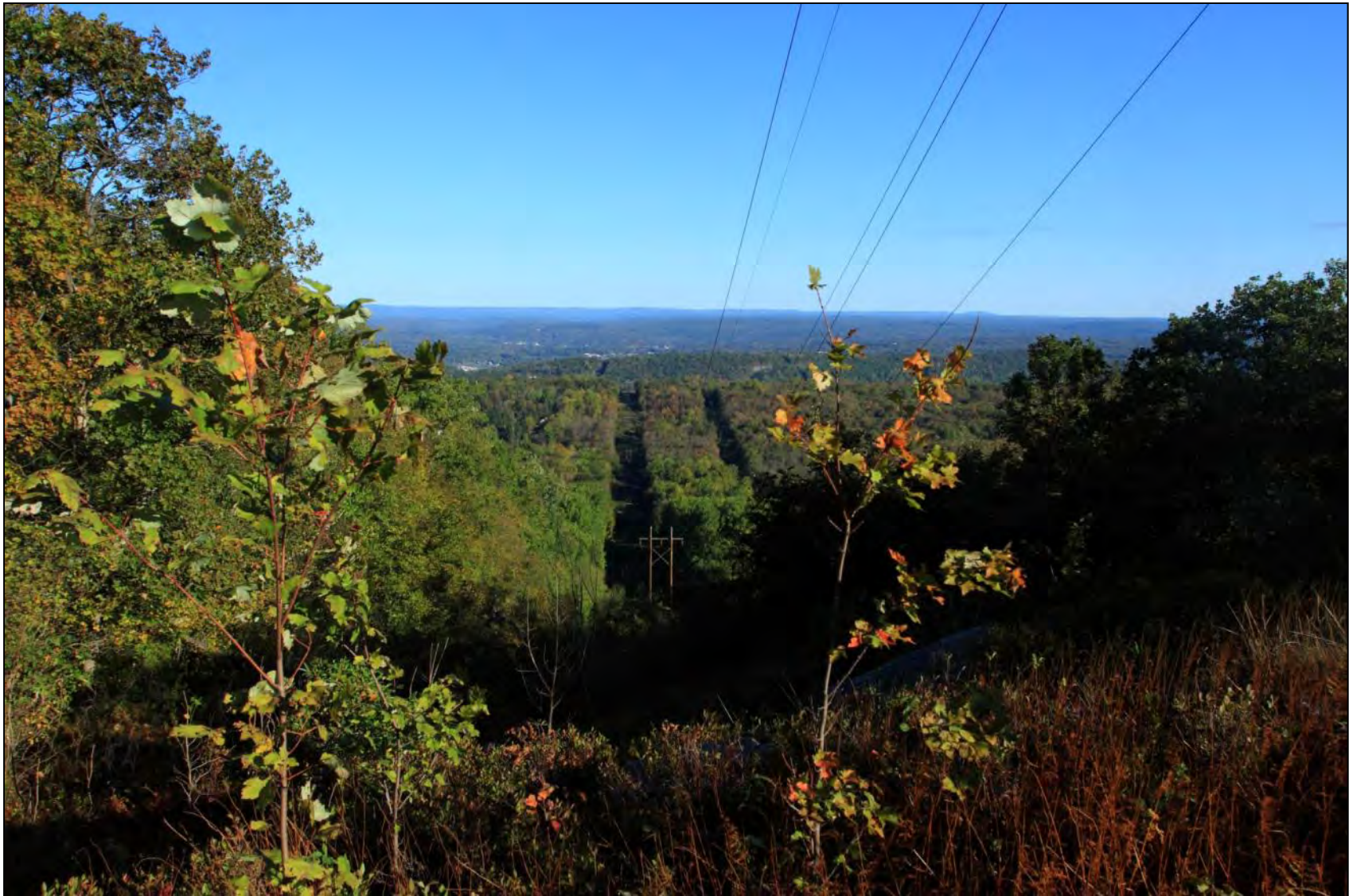
FIGURE 4-4, EXISTING: APPA AT ALTERNATIVE 4/5 CROSSING