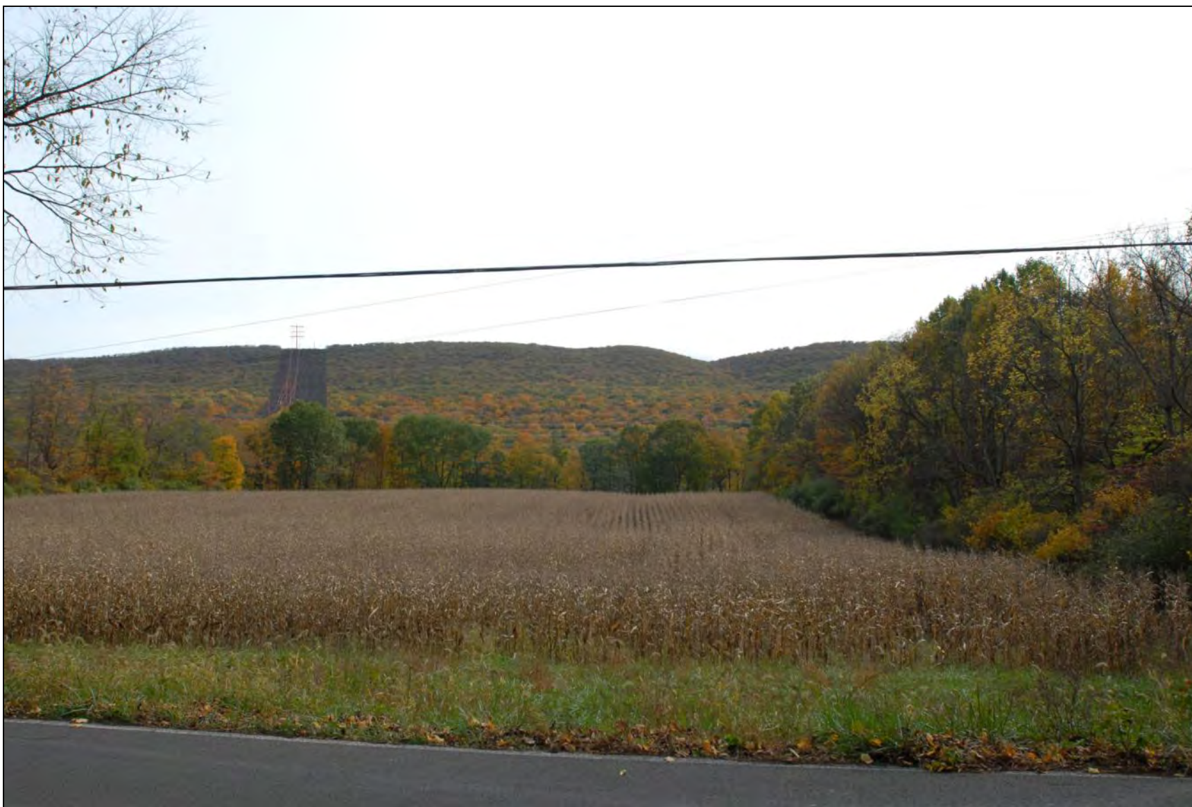
FIGURE 3-3, PROPOSED