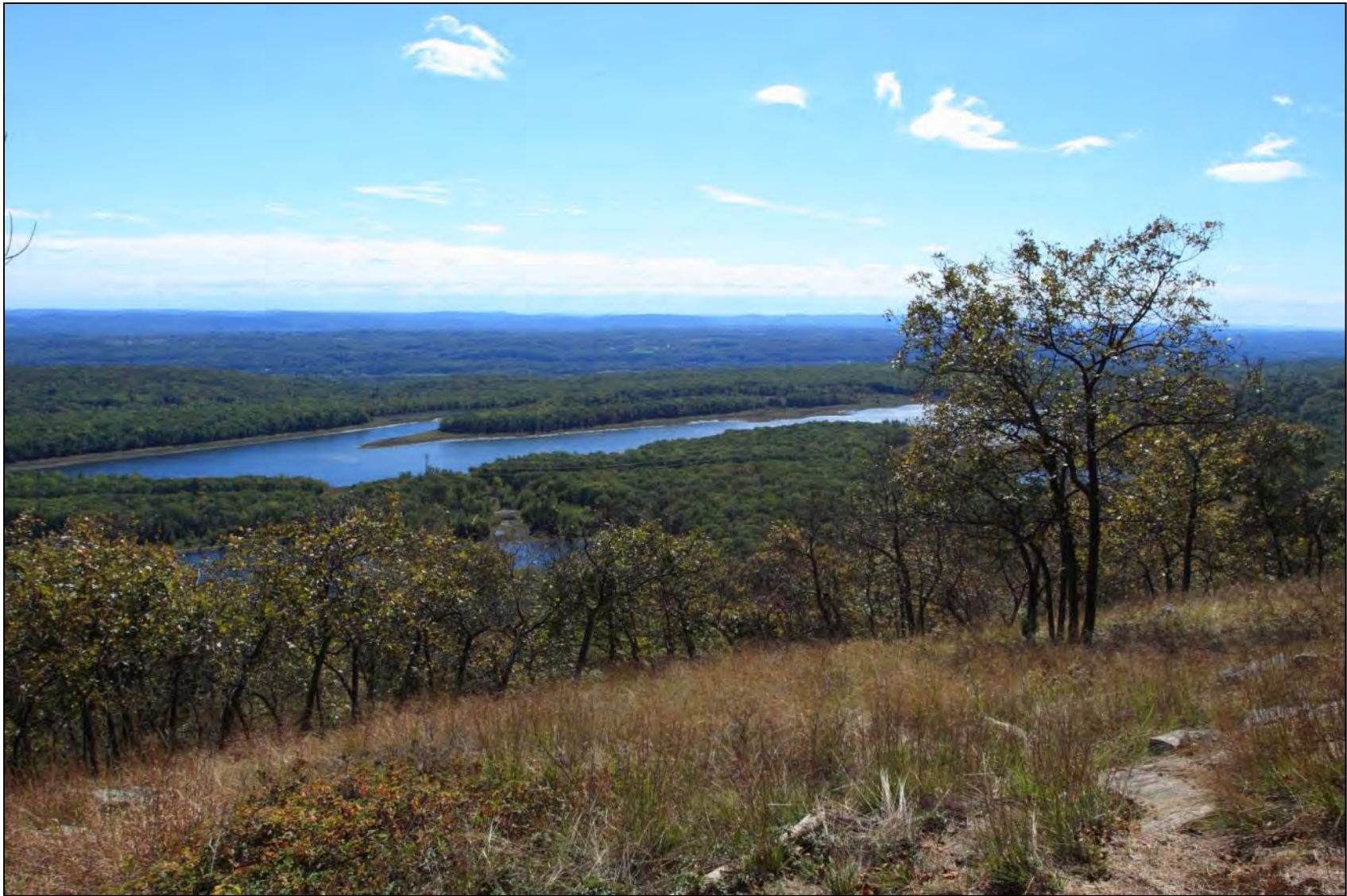
FIGURE 3-15, EXISTING: APPA, VIEW OVERLOOKING LOWER YARDS CREEK RESERVOIR