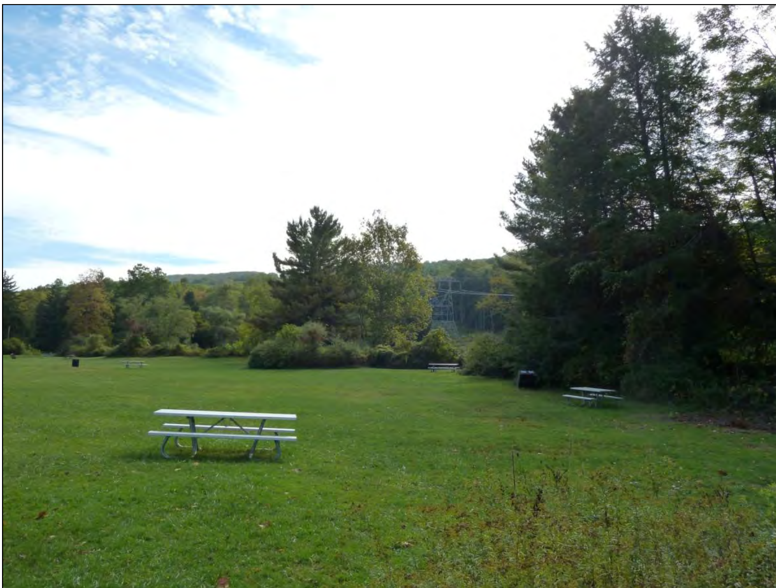
FIGURE 2-8, EXISTING: WATERGATE RECREATION SITE