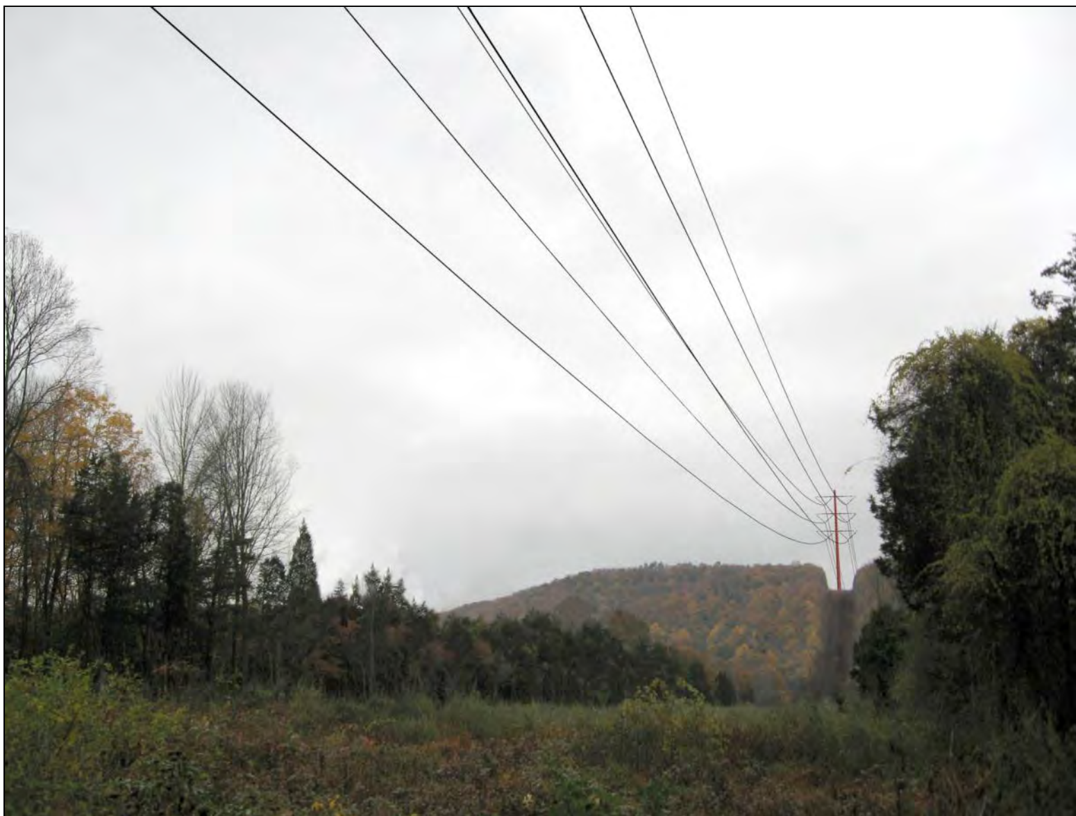
FIGURE 2B-5, PROPOSED