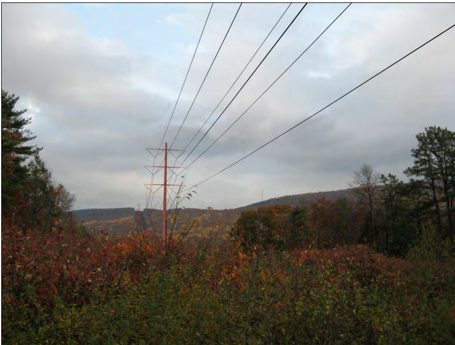
FIGURE 2B-6, PROPOSED