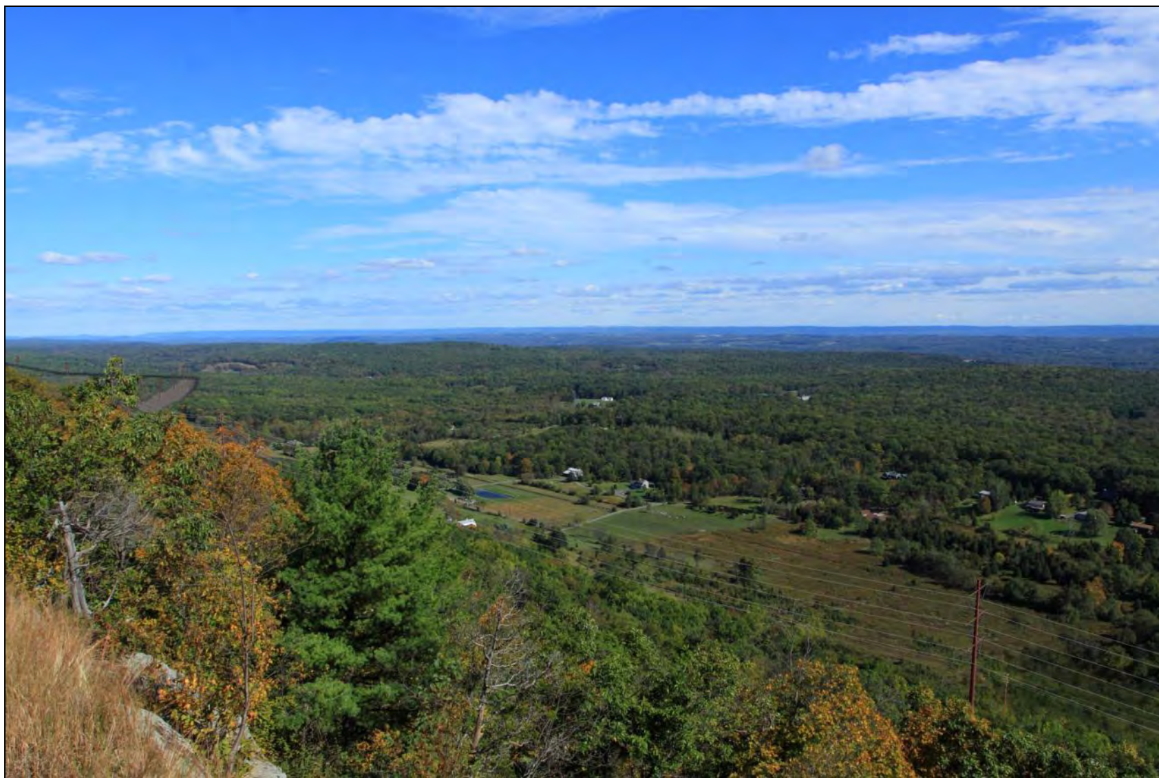
FIGURE 3-16, PROPOSED