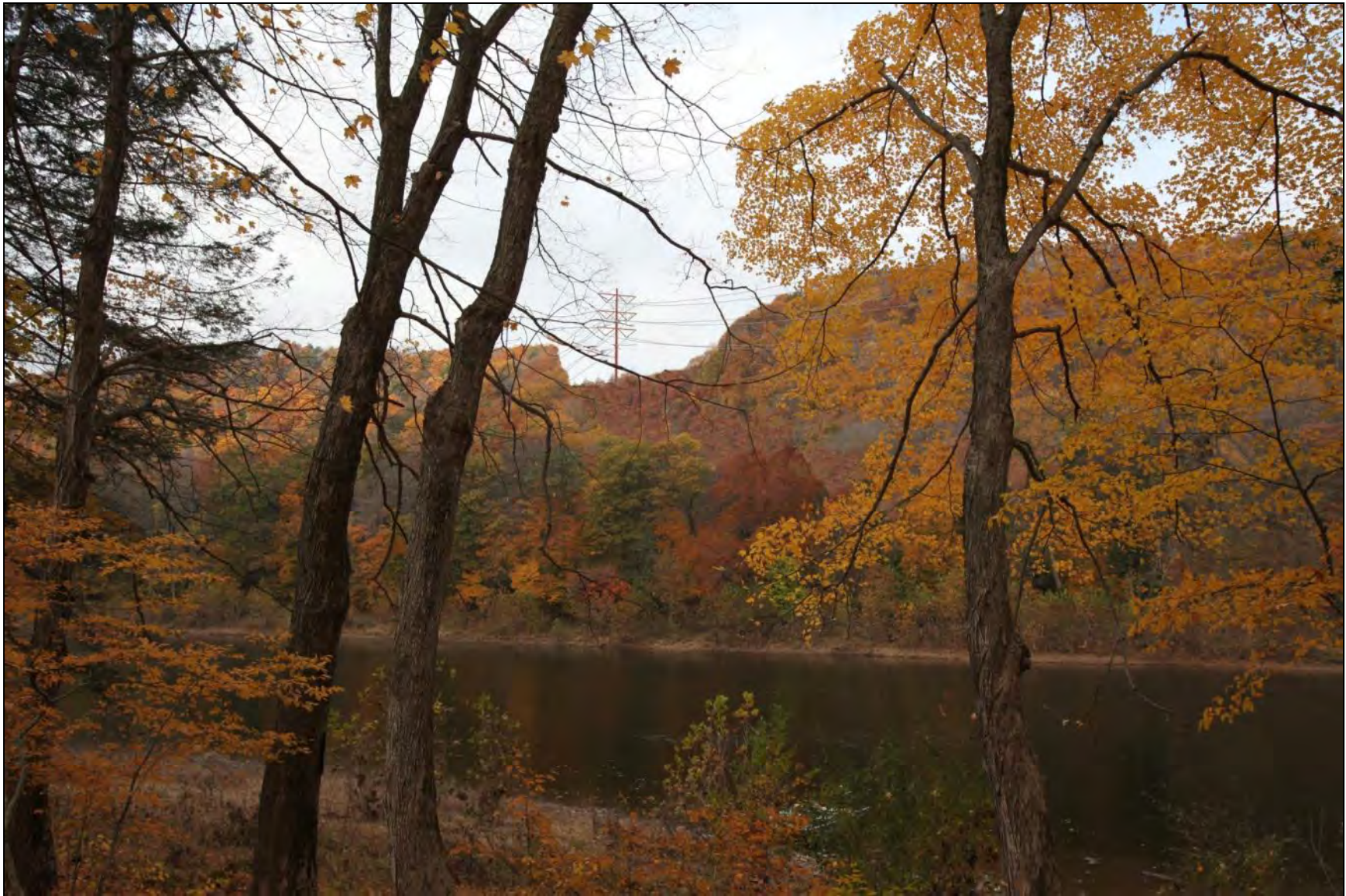
FIGURE 2-4, PROPOSED