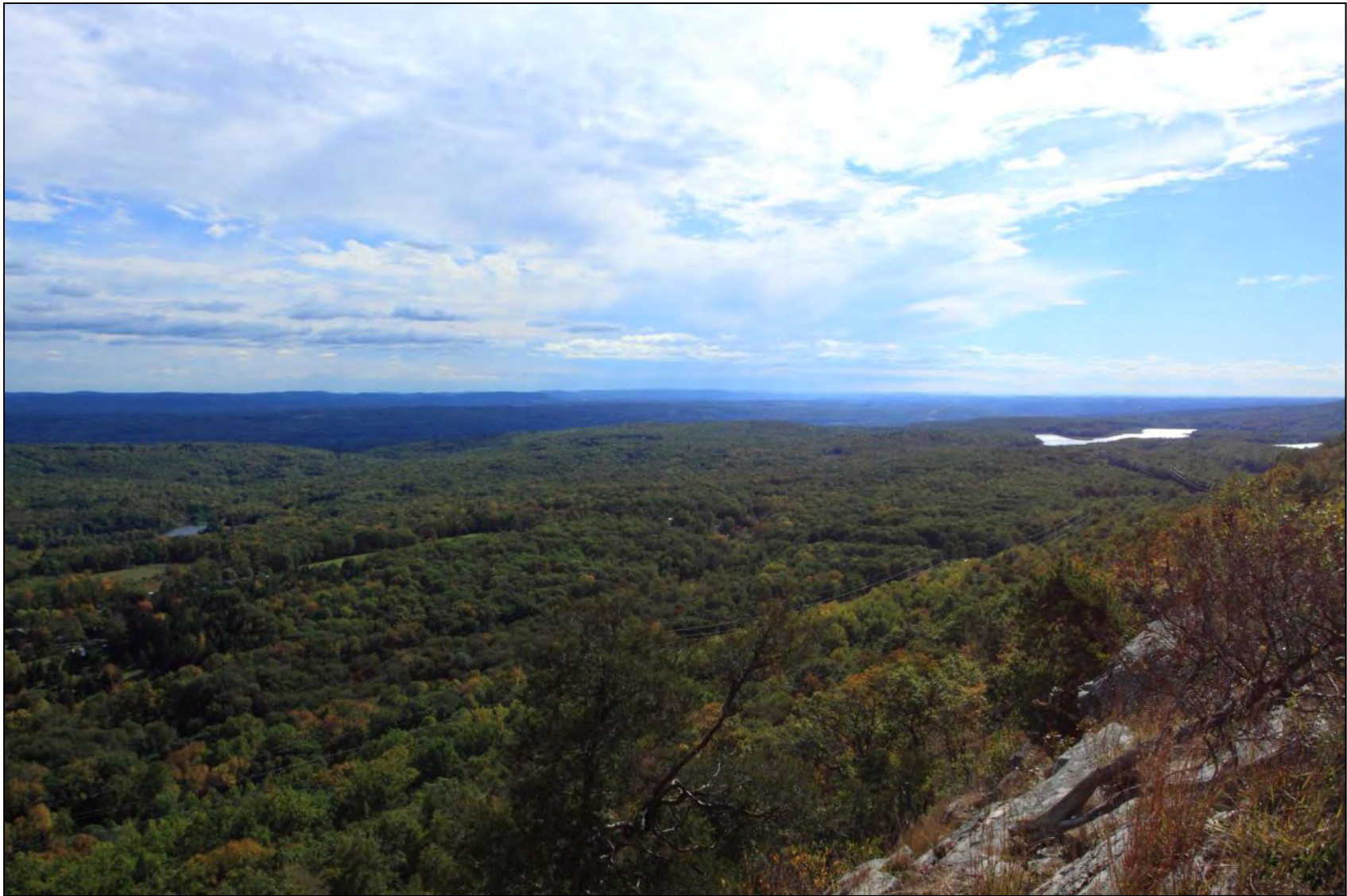
FIGURE 3-17, EXISTING: VISTA FROM RIDGE NEAR RATTLESNAKE SWAMP, No. 2