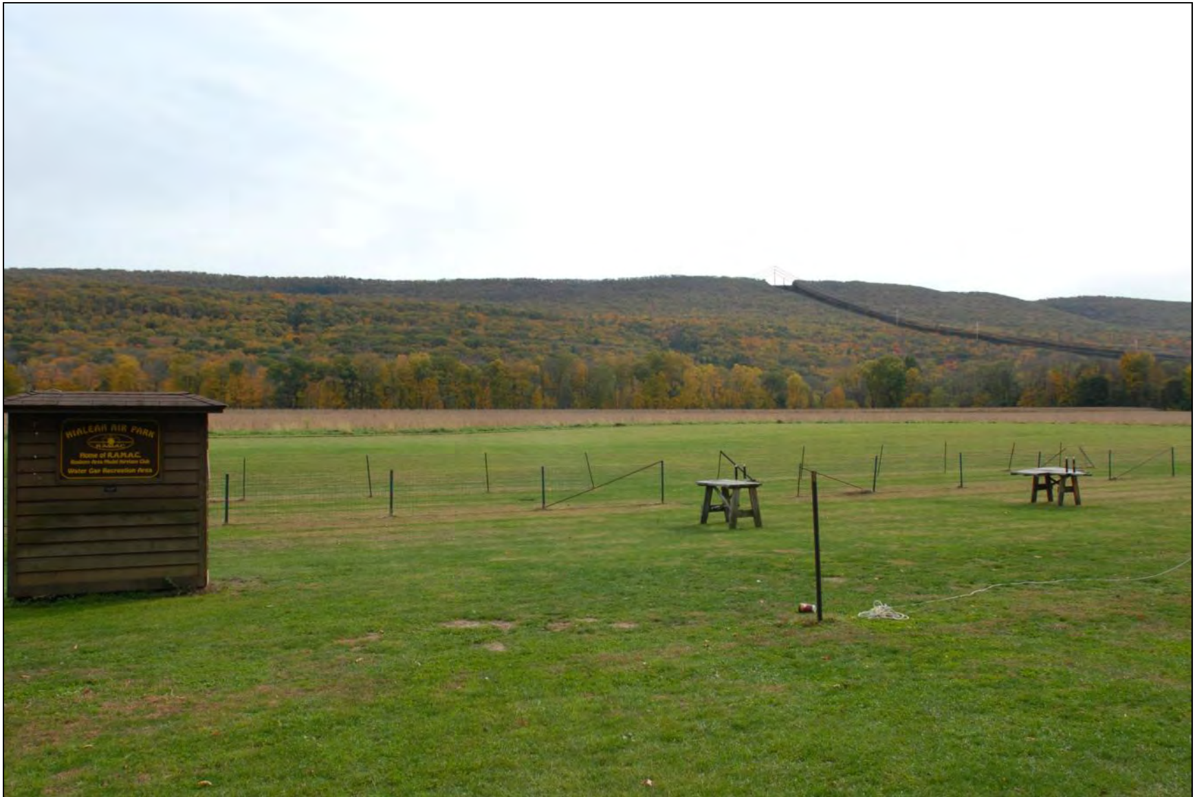
FIGURE 3-8, PROPOSED