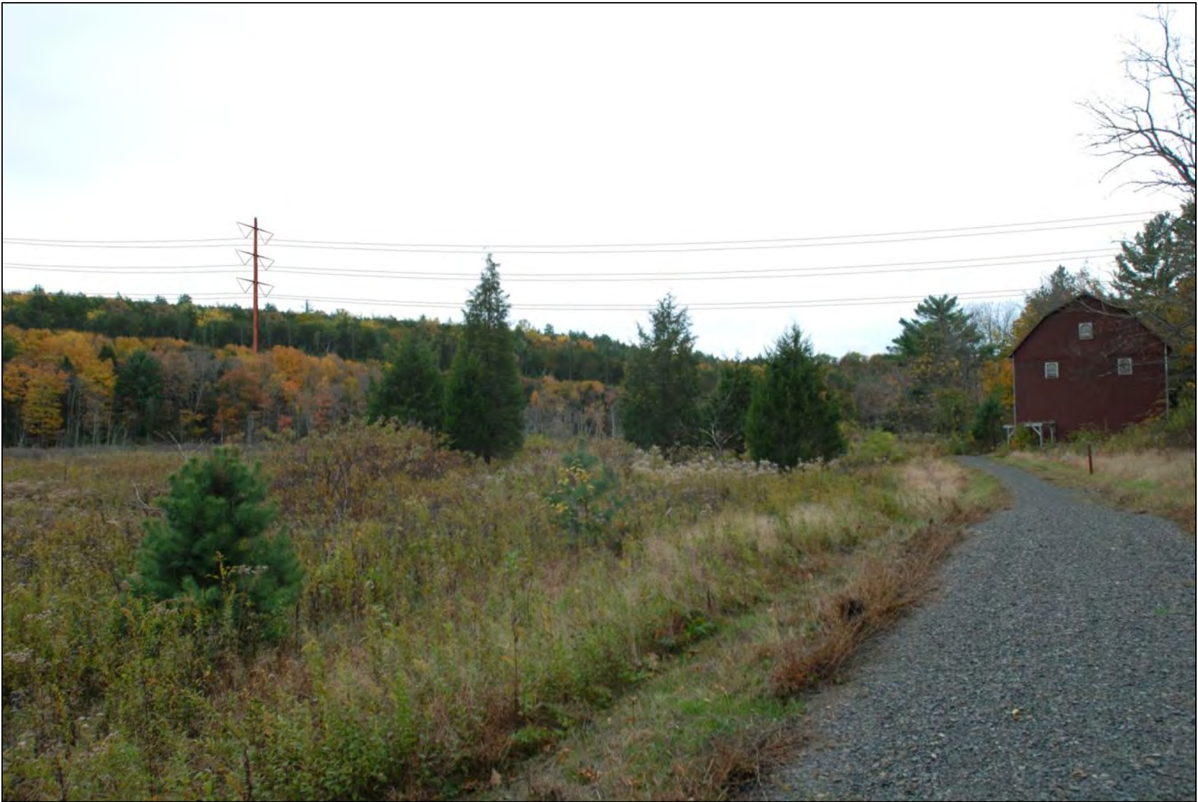
FIGURE 2-2, PROPOSED