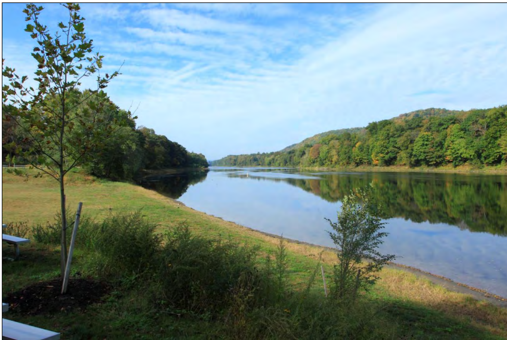
FIGURE 3-11, EXISTING: TURTLE BEACH