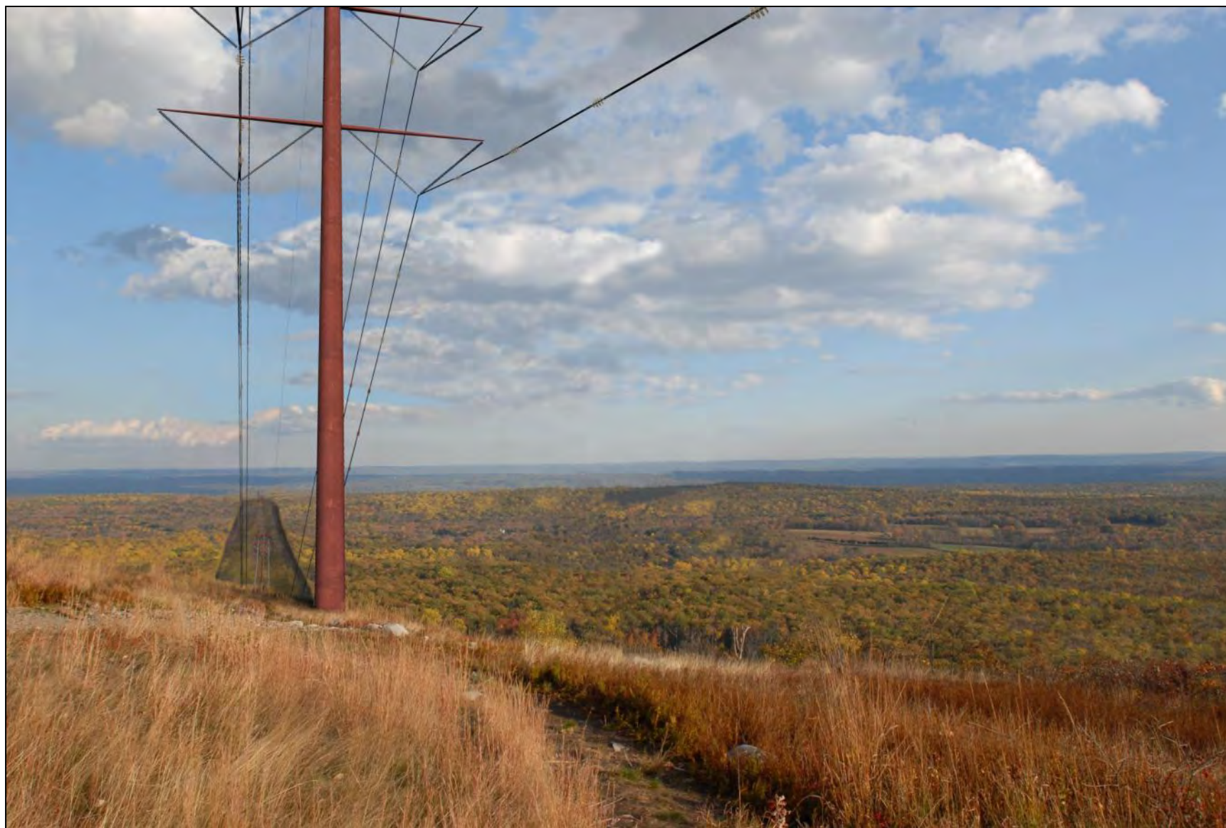
FIGURE 2-11, PROPOSED