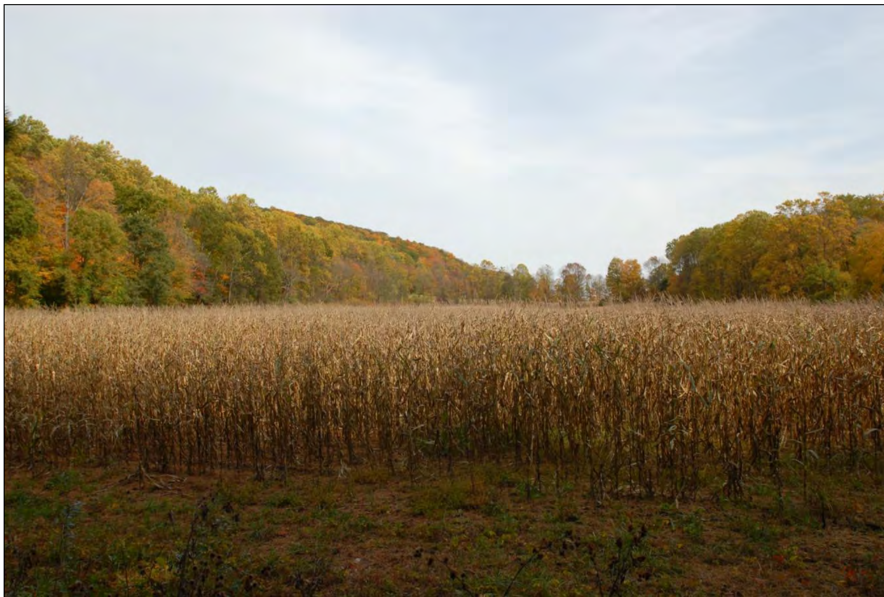
FIGURE 3-7, EXISTING: HIALEAH PICNIC AREA (FROM THE EXIT ROAD)