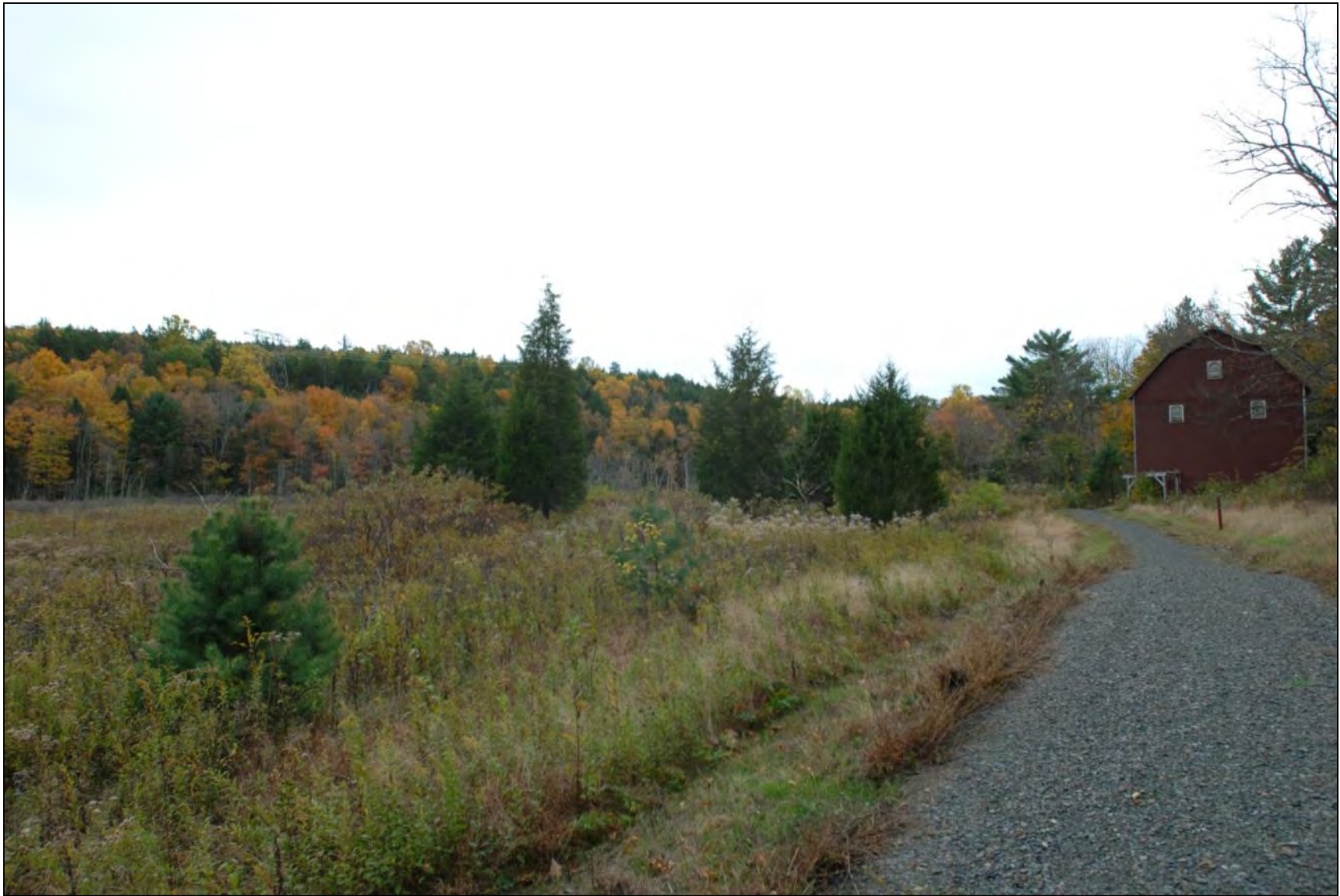
FIGURE 2B-2, EXISTING: JOSEPH M. MCDADE RECREATIONAL TRAIL, NEAR SCHOONOVER HOUSE