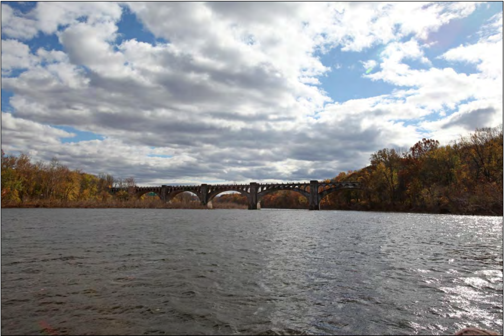
FIGURE 4-2, EXISTING: DELAWARE RIVER AT ALTERNATIVE 4/5 CROSSING