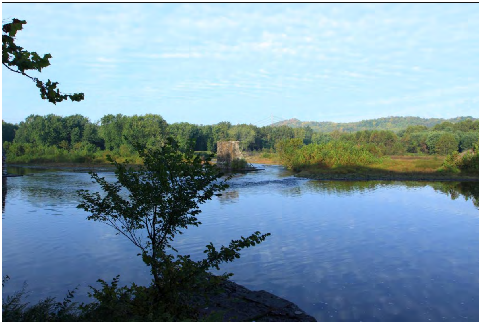
FIGURE 4-3, PROPOSED