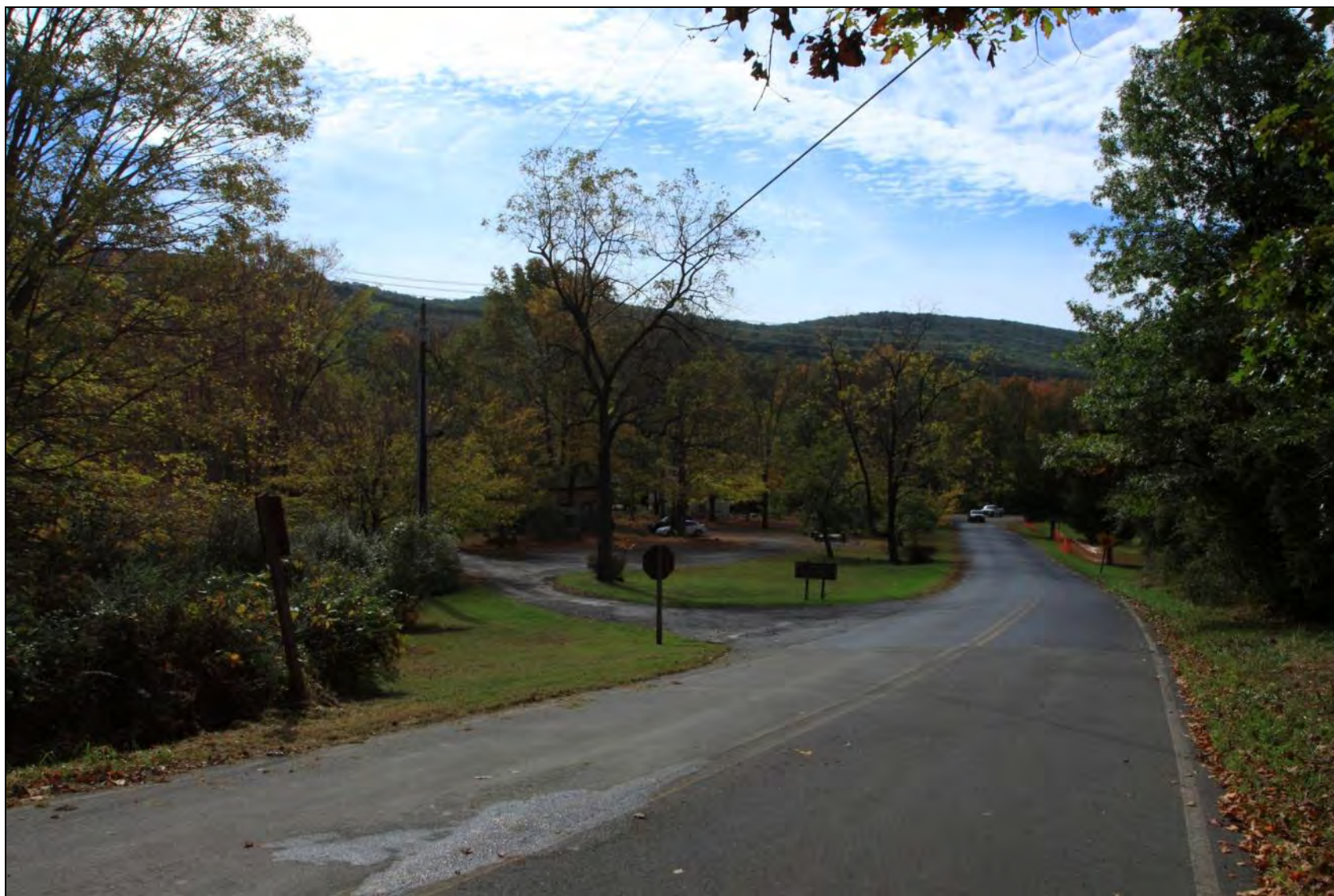
FIGURE 2-10, PROPOSED