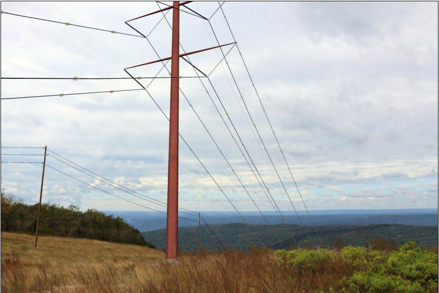
FIGURE 3-13A, PROPOSED REPRESENTATIVE OF MIGRATORY BIRD DIVERTER DEVICES (SPIRAL WIRE) ON THE 500-kV CONDUCTORS. APLIC-APPROVED BIRD DIVERTER DEVICES OF SOME TYPE WOULD BE REQUIRED WHERE ANY ALTERNATIVE ALIGNMENT CROSSES MDSR AND KITTATINNY RIDGE.