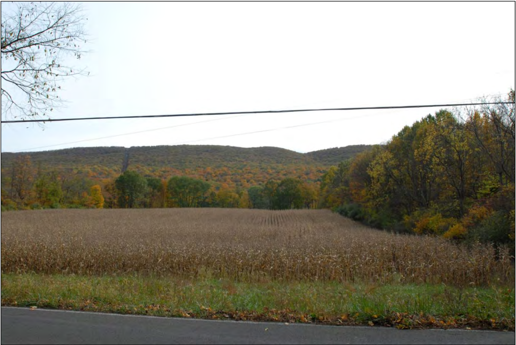
FIGURE 3-3, EXISTING: RIVER ROAD, NEAR ALTERNATIVE 3