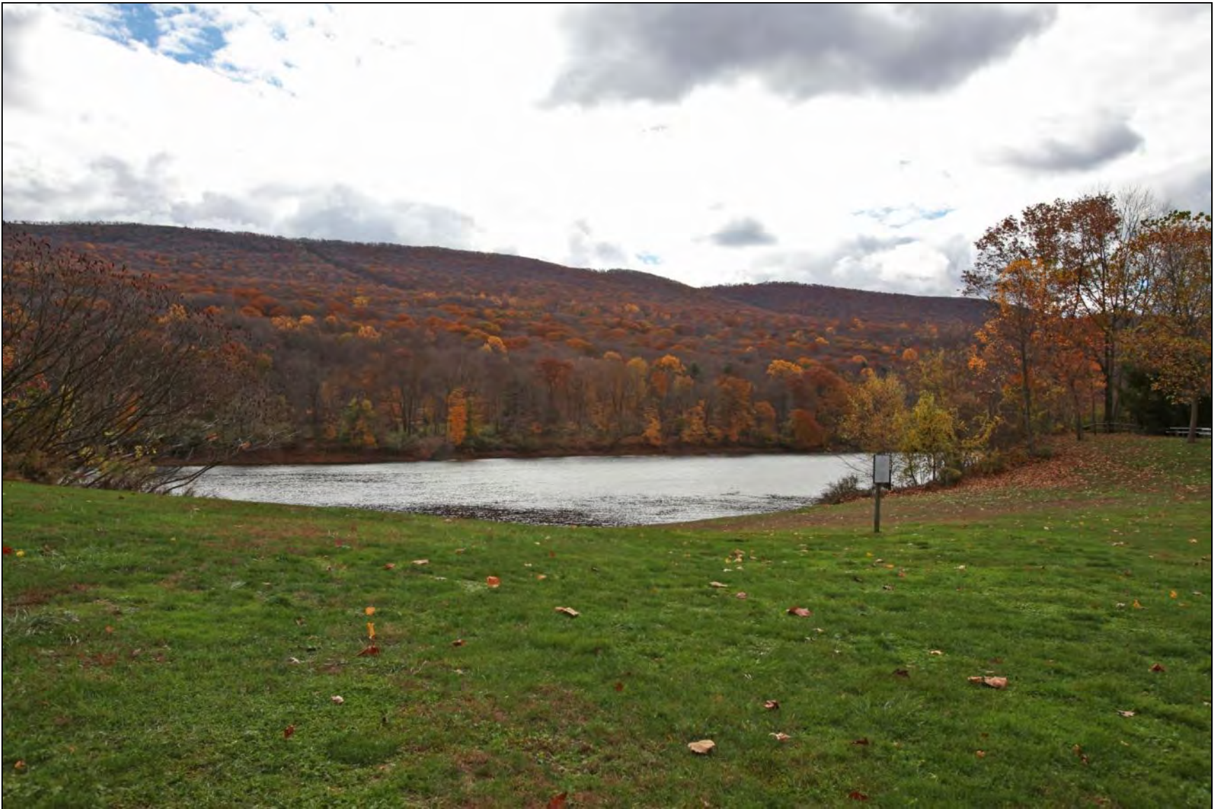
FIGURE 3-2, EXISTING: SMITHFIELD BEACH