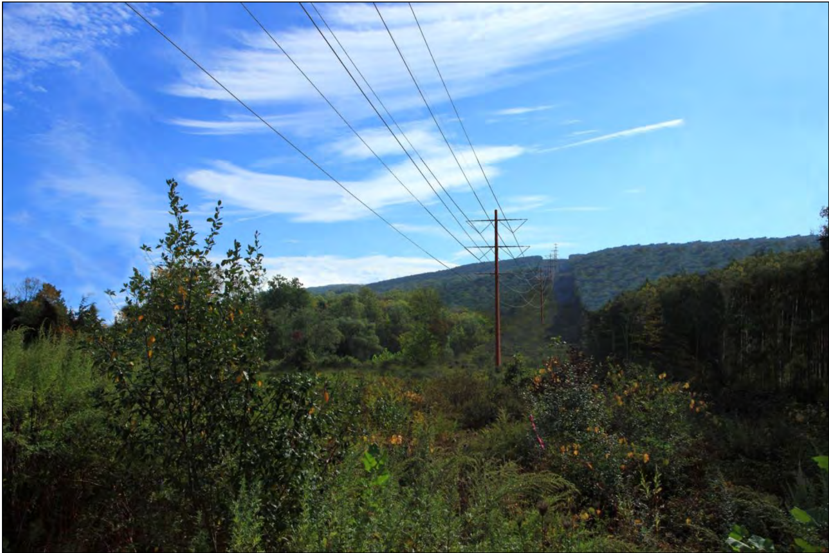
FIGURE 2-7, PROPOSED