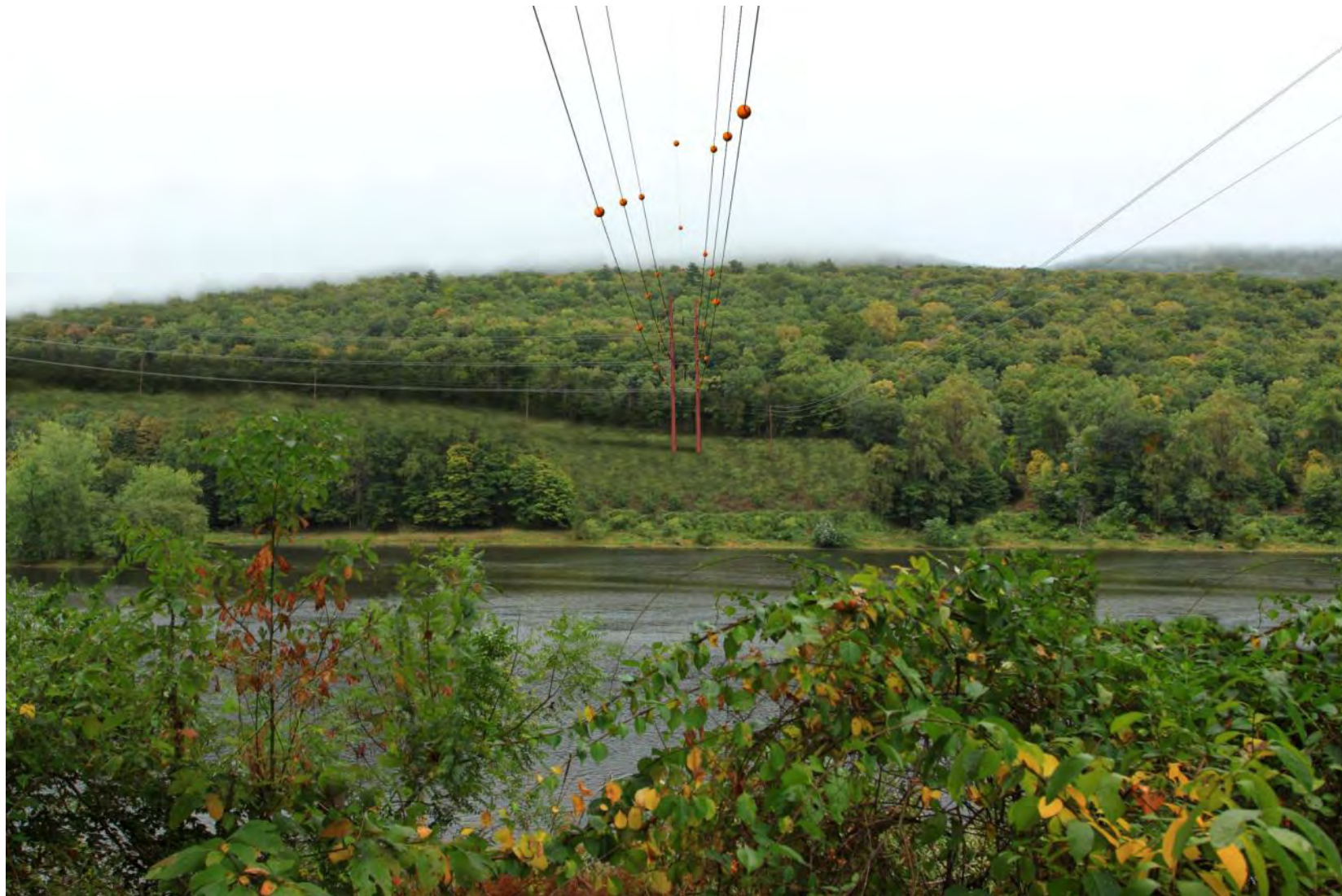
FIGURE 3-4B, PROPOSED. REPRESENTATIVE OF MIGRATORY BIRD DIVERTER DEVICES (MARKER BALLS) ON THE 500-kV CONDUCTORS. APLIC-APPROVED BIRD DIVERTER DEVICES OF SOME TYPE WOULD BE REQUIRED WHERE AN ALIGNMENT CROSSES MDSR AND KITTATINNY RIDGE.