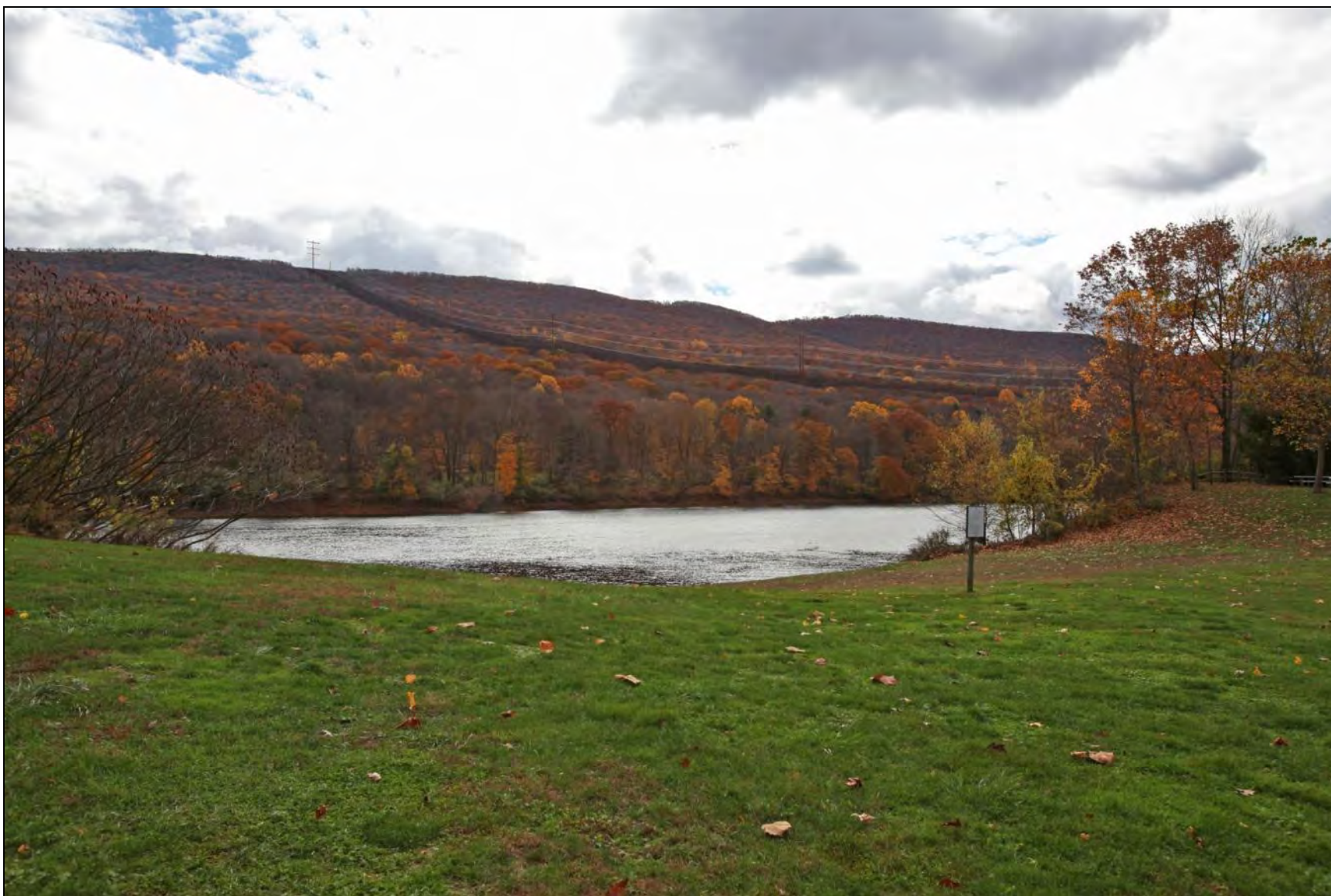
FIGURE 3-2, PROPOSED