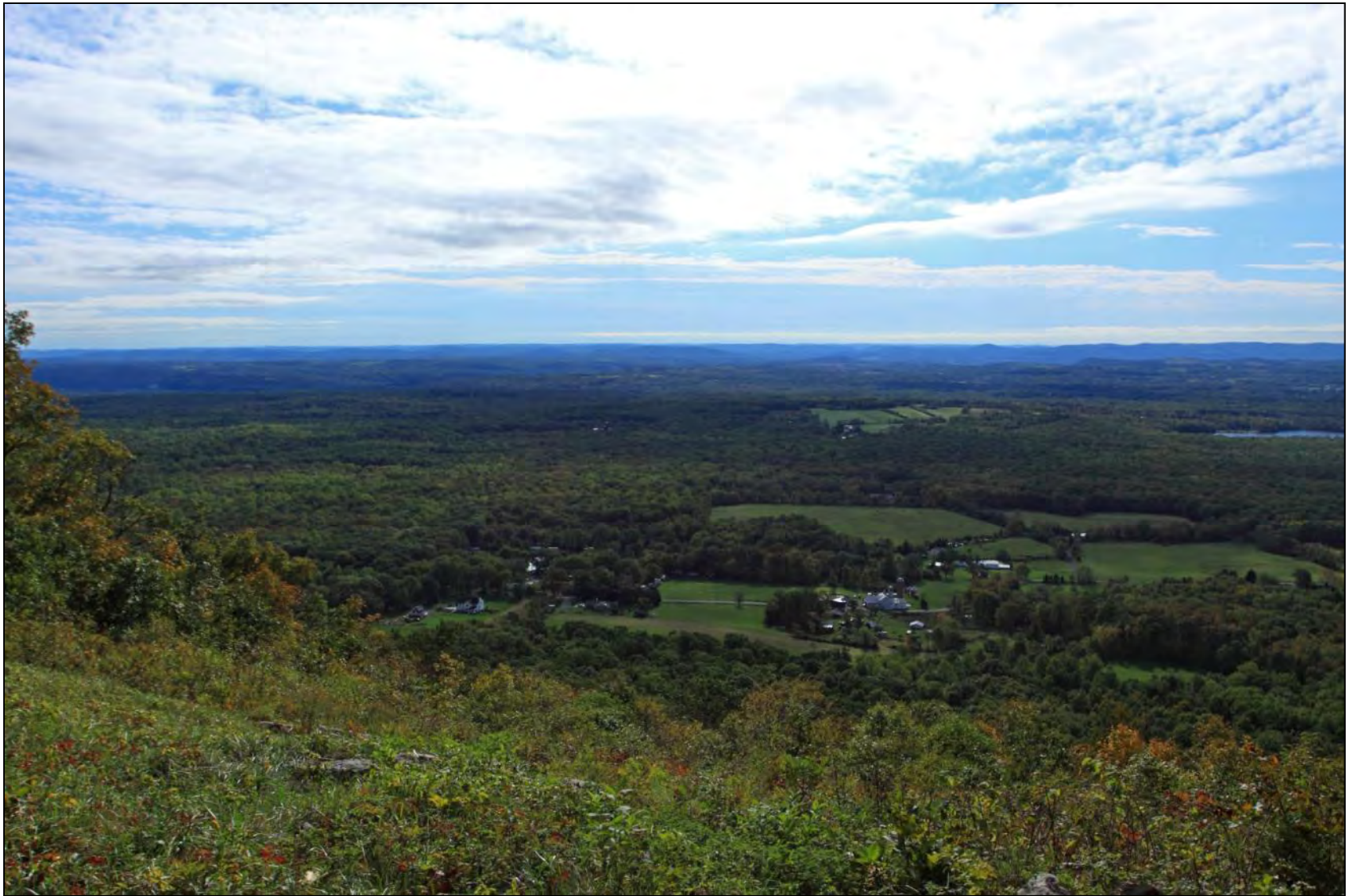
FIGURE 4-6, EXISTING: APPA AT NELSON OVERLOOK