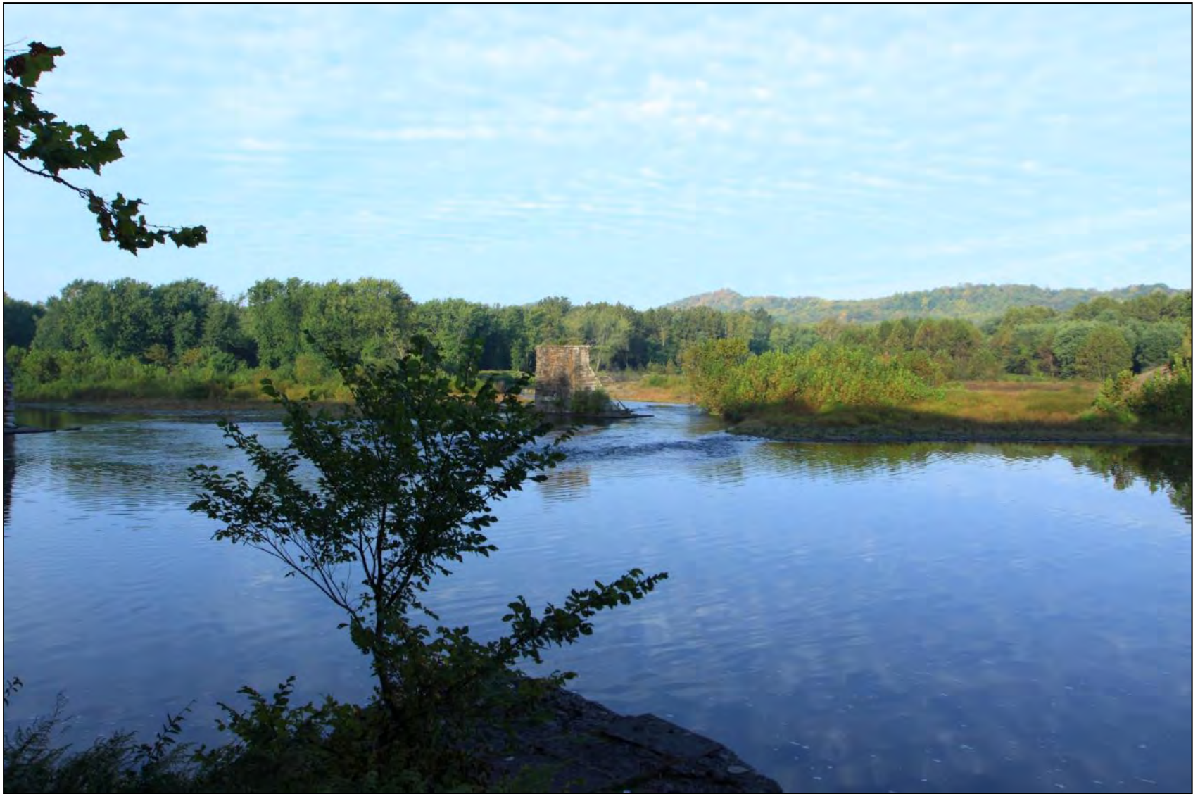
FIGURE 4-3, EXISTING: KARAMAC TRAIL