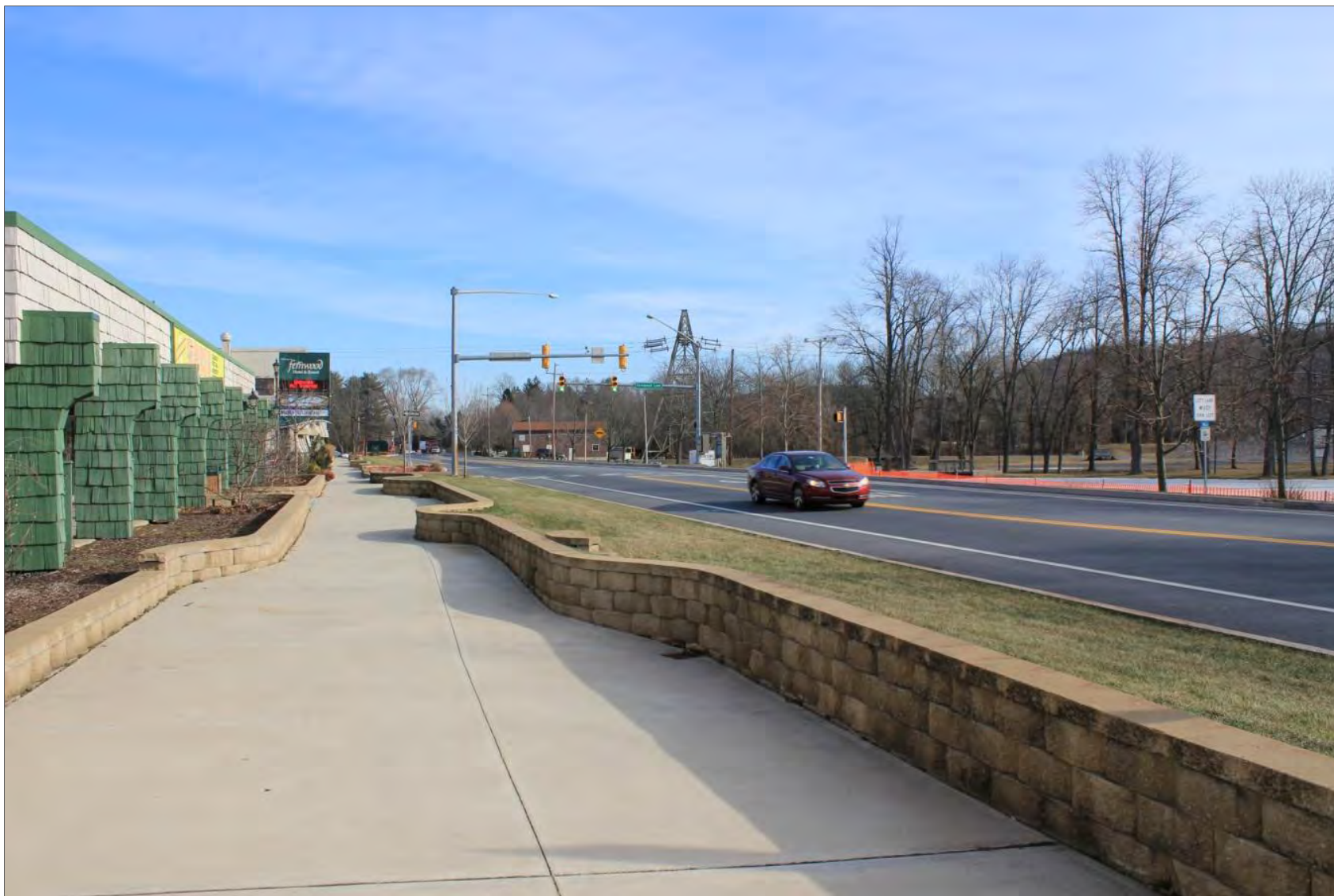
FIGURE 2-1, EXISTING: FERNWOOD RESORT, PA HWY 209