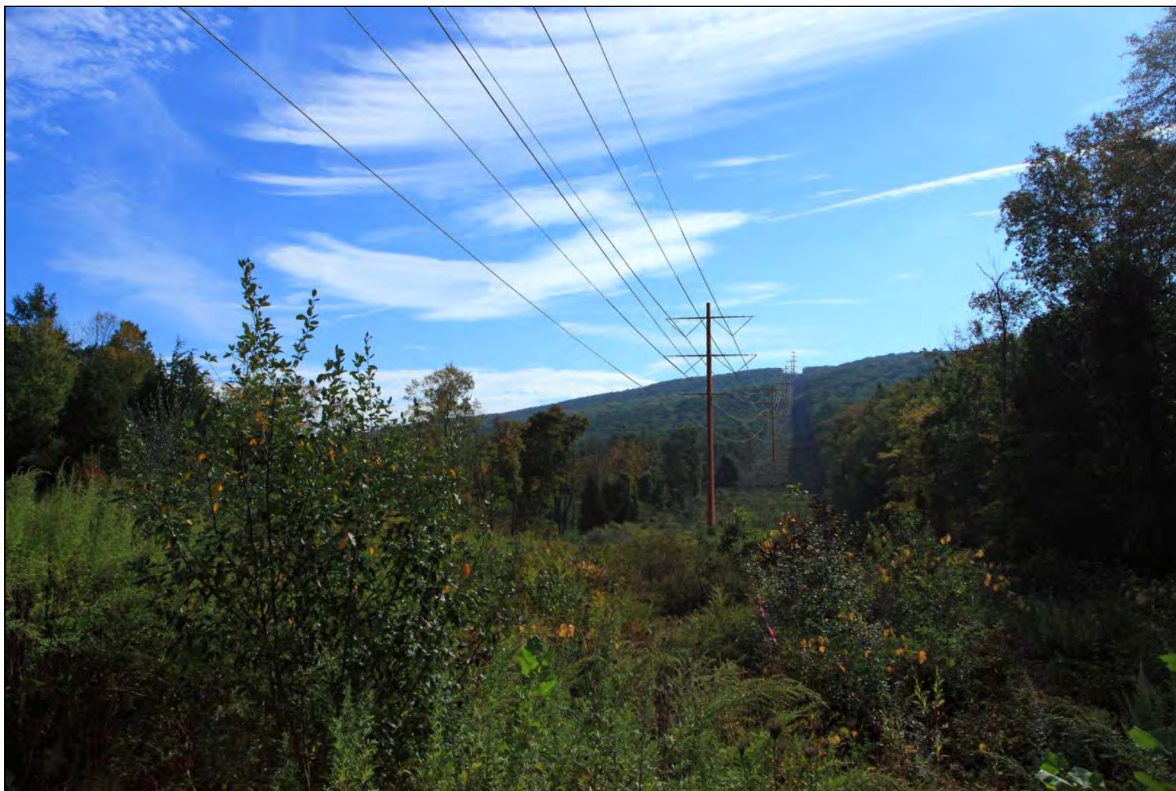
FIGURE 2B-7, PROPOSED