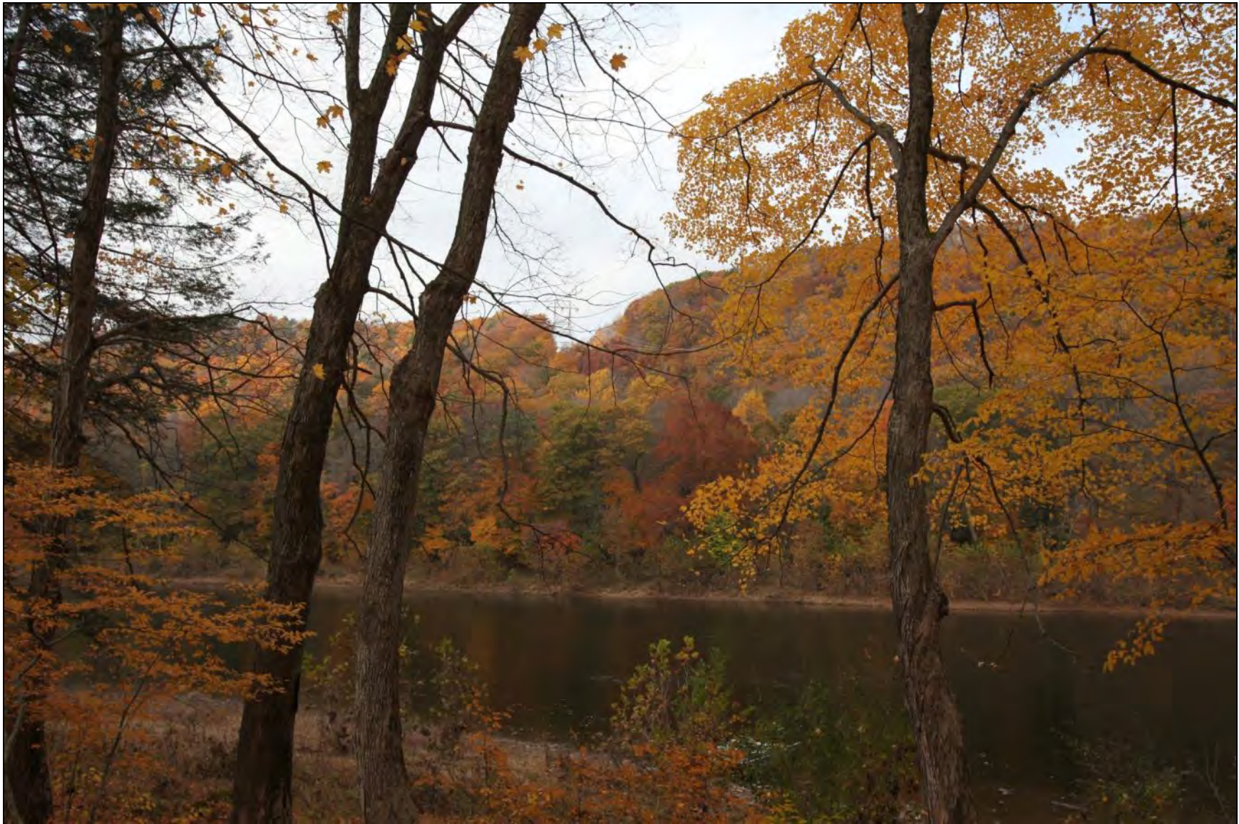
FIGURE 2B-4, EXISTING: HAMILTON RIVER CAMPSITES