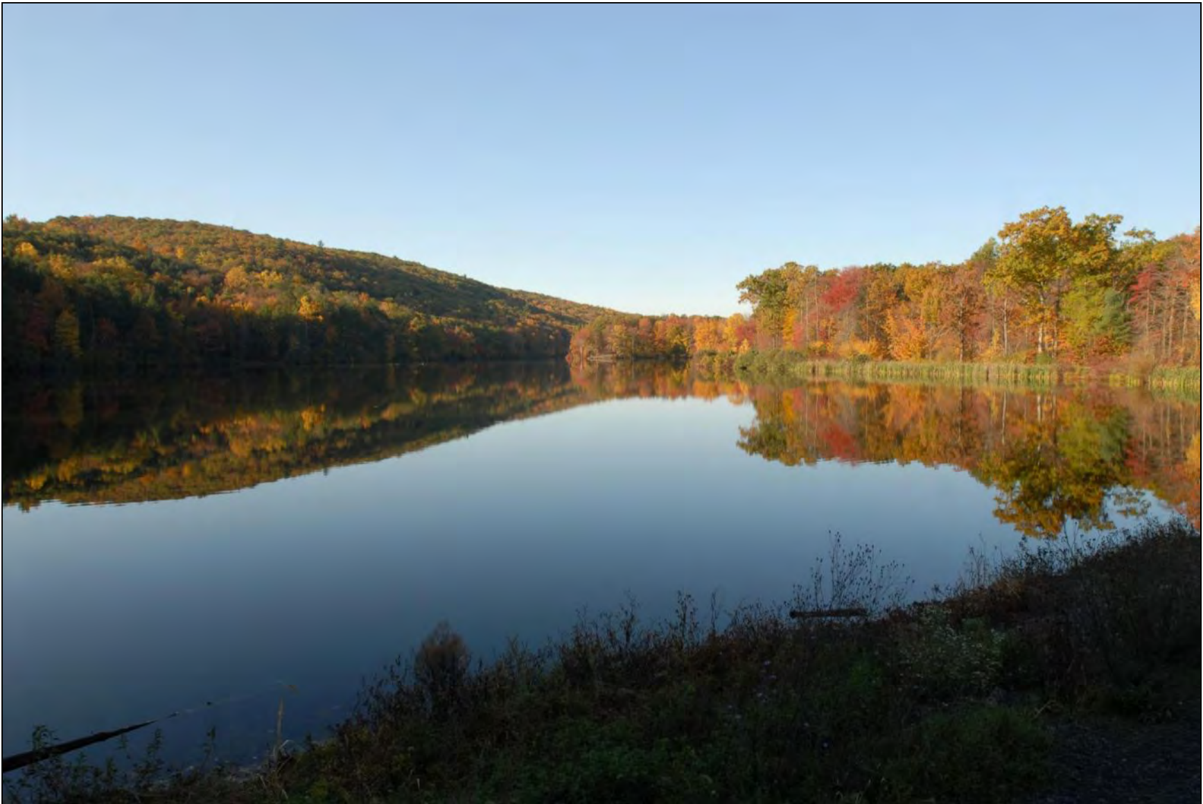
FIGURE 3-1, EXISTING: HIDDEN LAKE DAM