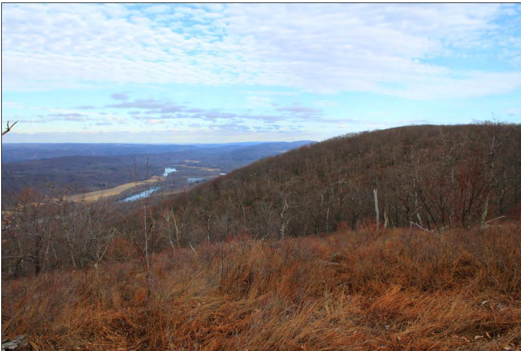
FIGURE 3-12, EXISTING: APPA, FUTURE RELOCATION SECTION