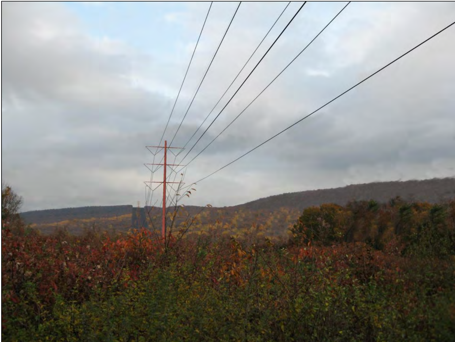
FIGURE 2-6, PROPOSED