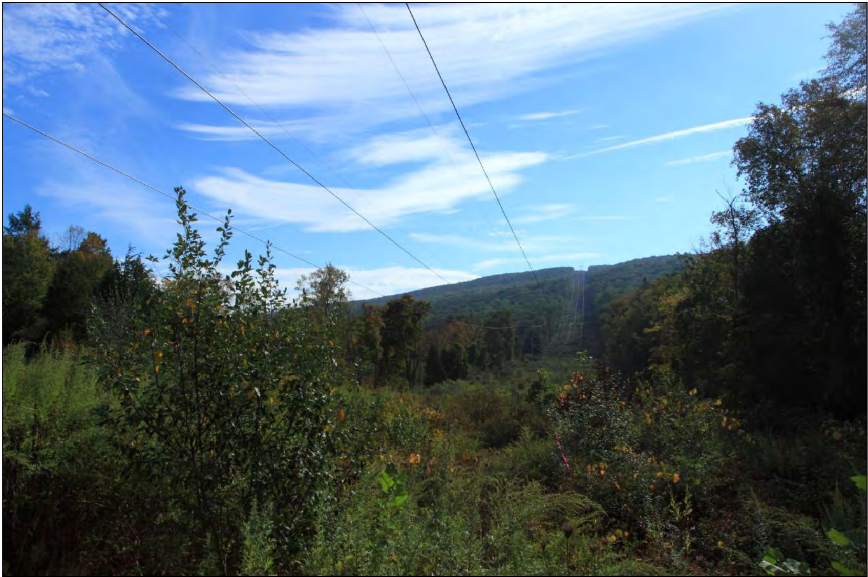
FIGURE 2B-7, EXISTING: OLD MINE ROAD AT ALTERNATIVE 2 CROSSING