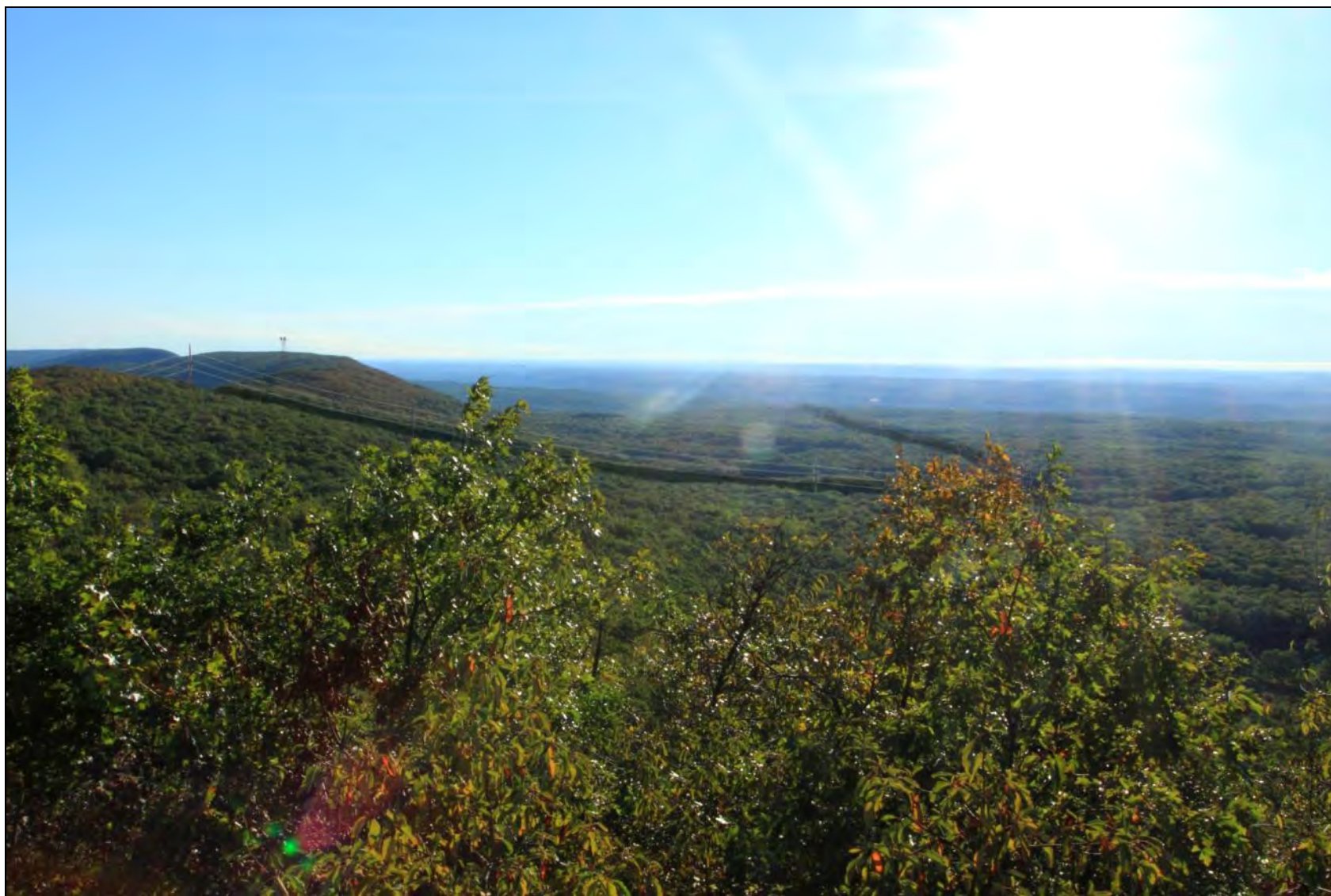
FIGURE 4-5, PROPOSED