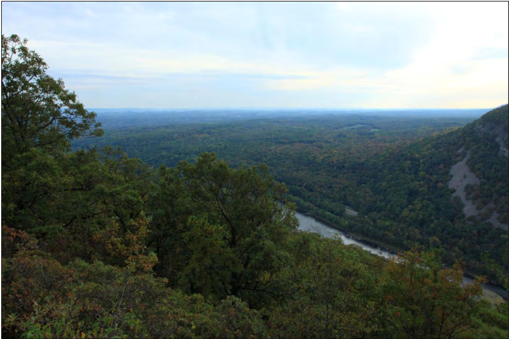
FIGURE 4-1, EXISTING: MT. TAMMANY SUMMIT