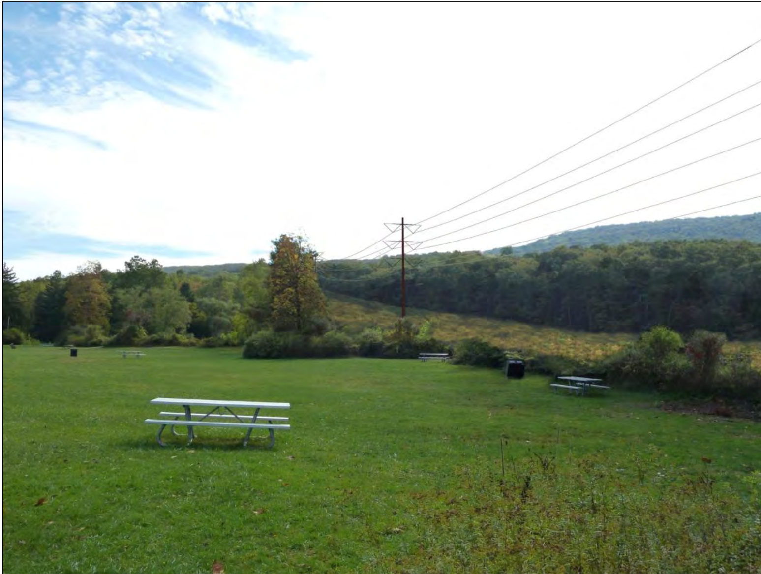
FIGURE 2-8, PROPOSED