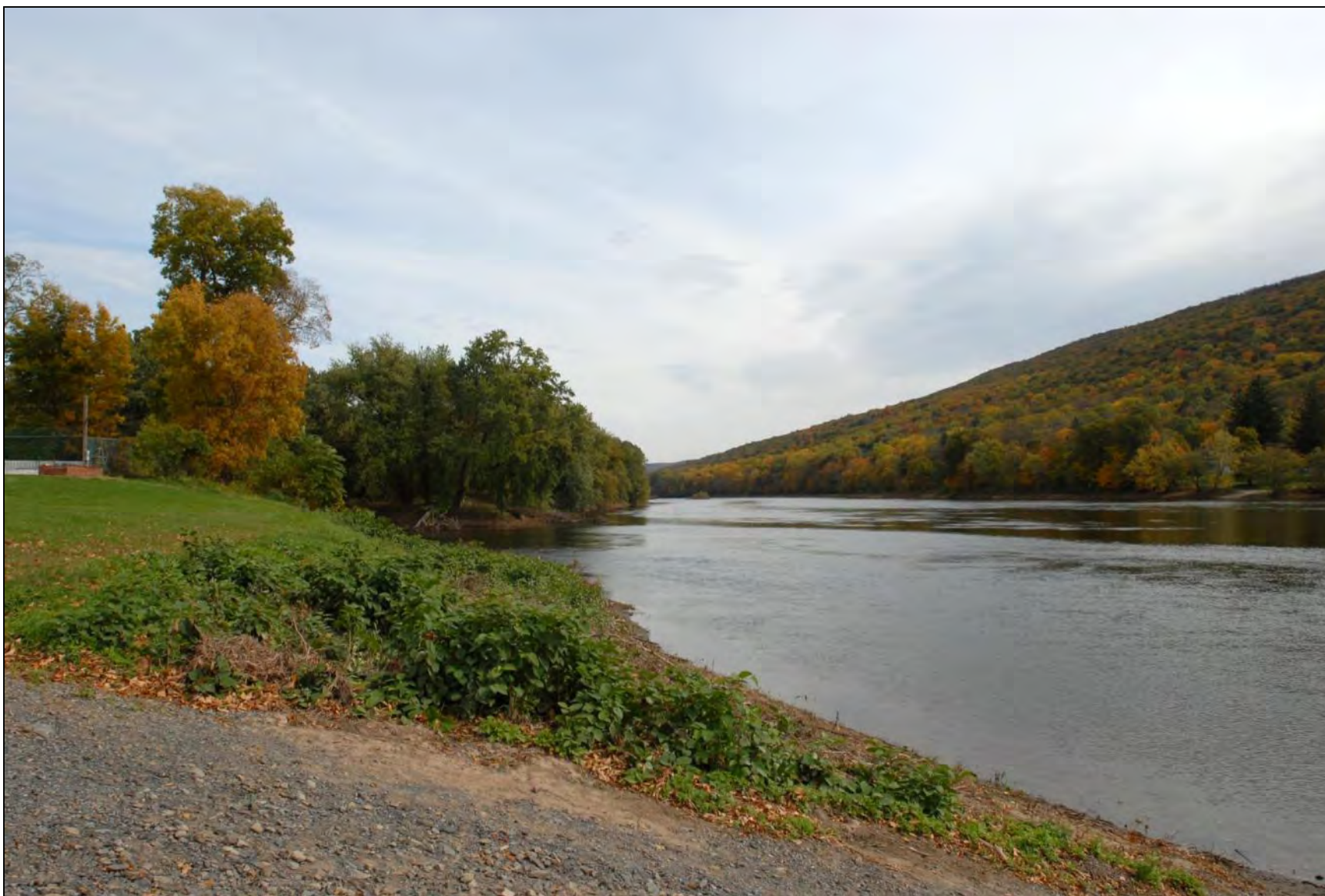
FIGURE 3-10, EXISTING: SHAWNEE RESORT BEACH