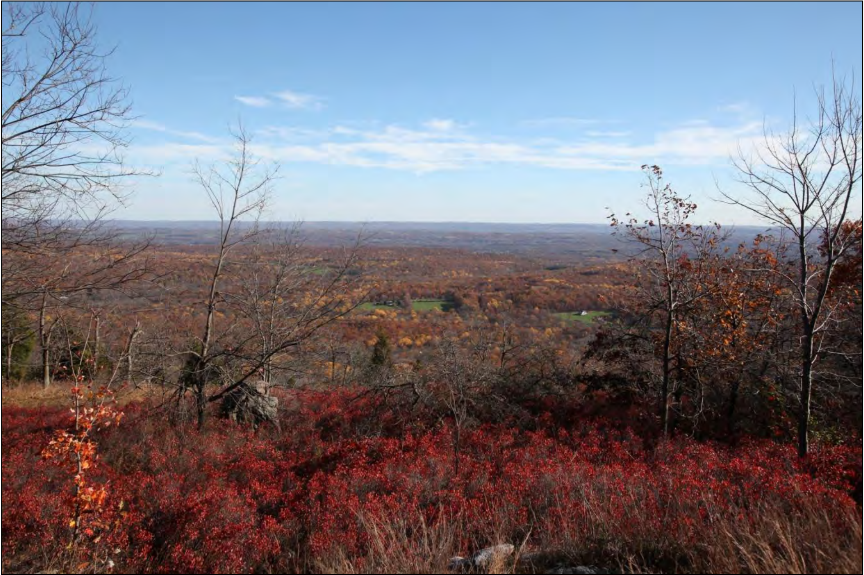
FIGURE 3-18, EXISTING: CATFISH FIRE TOWER