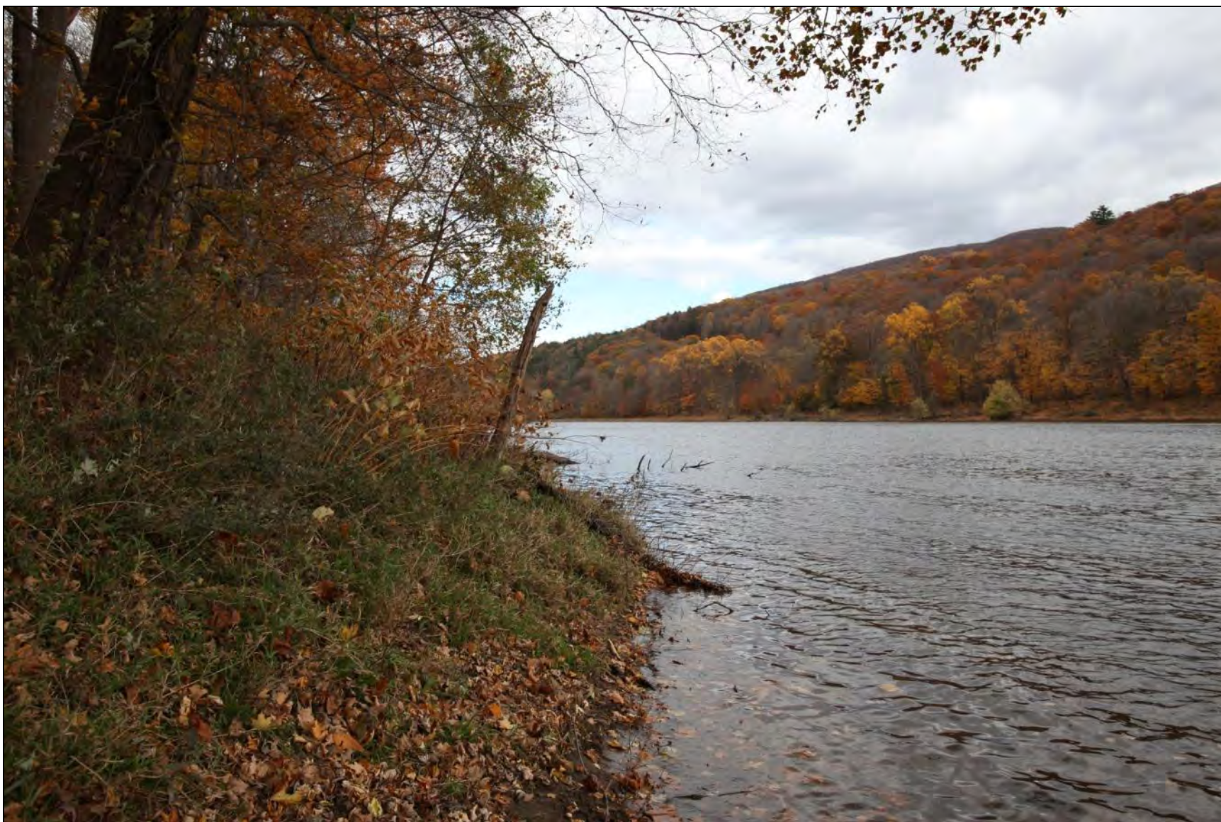
FIGURE 3-6, EXISTING: WALTER'S TRACT RIVER CAMPSITES