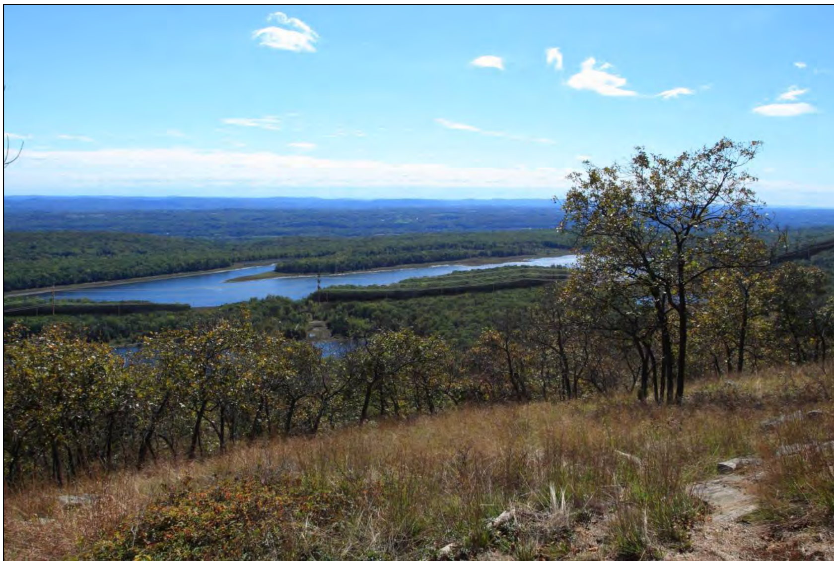
FIGURE 3-15, PROPOSED