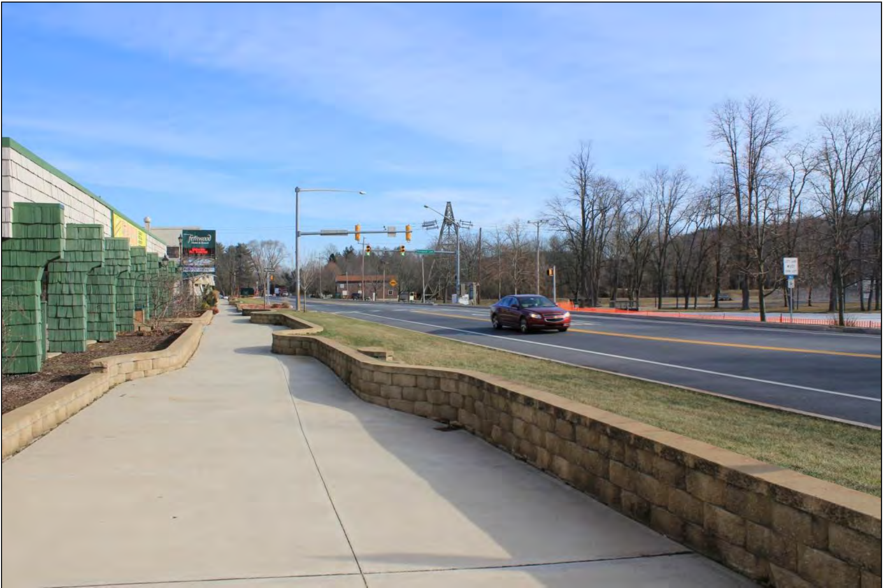
FIGURE 2B-1, EXISTING: FERNWOOD RESORT, PA HWY 209