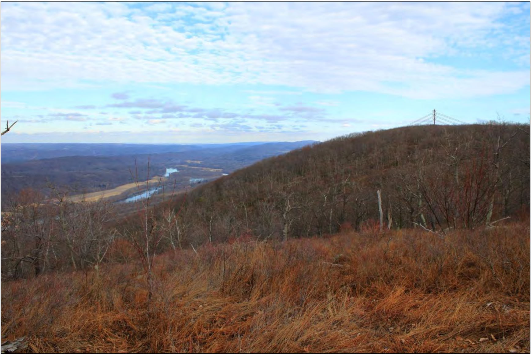
FIGURE 3-12, PROPOSED