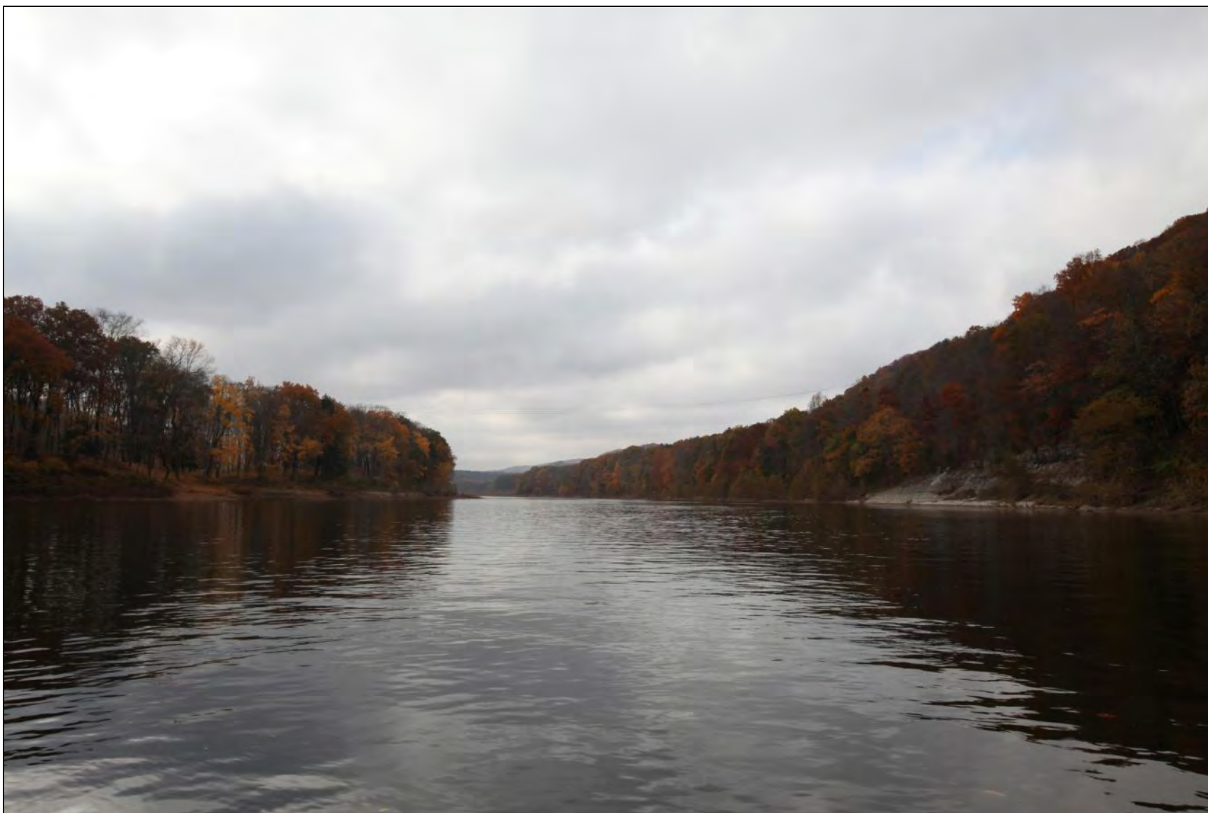
FIGURE 2-3, EXISTING: MDSR AT ALTERNATIVE 2 CROSSING