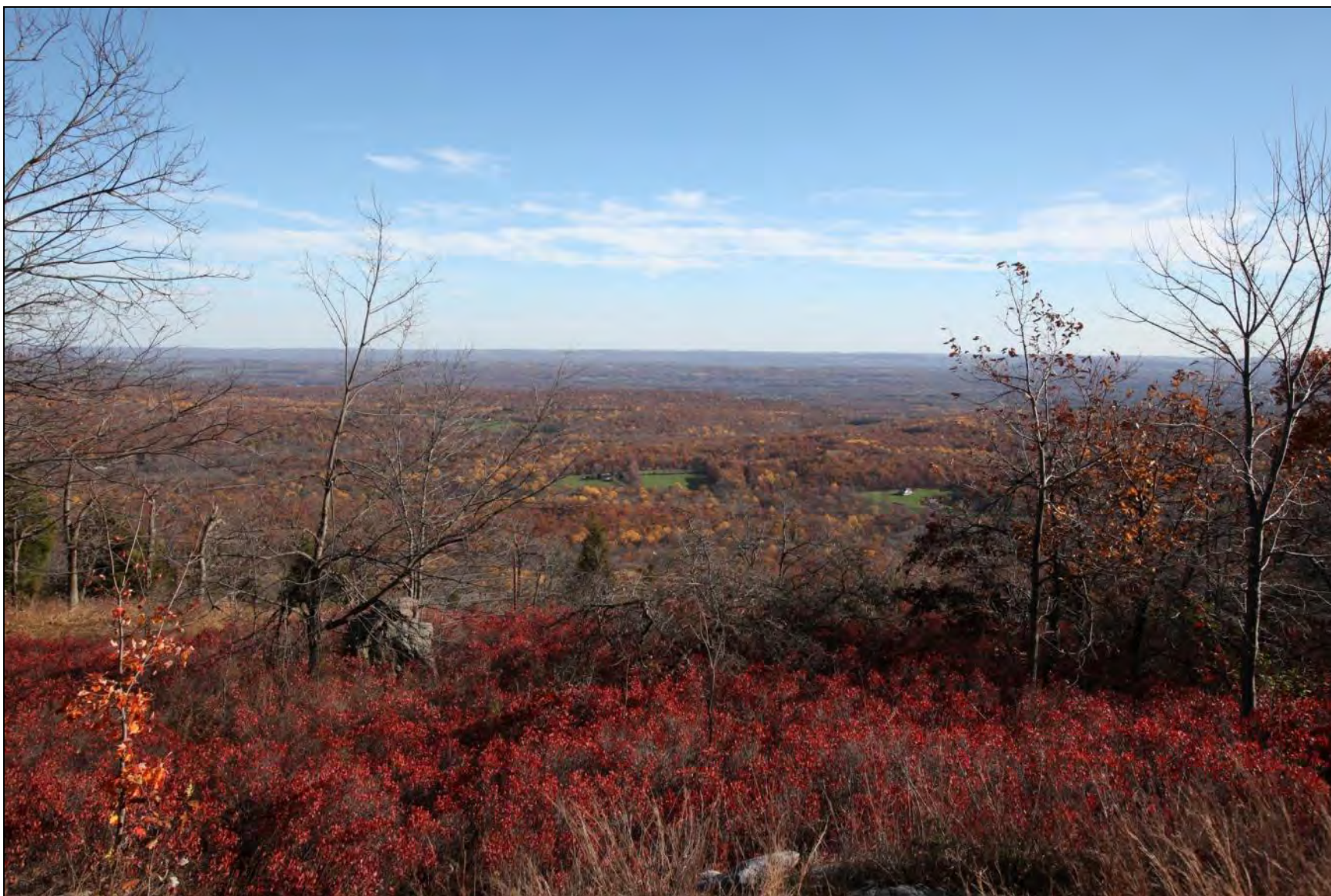
FIGURE 3-18, PROPOSED