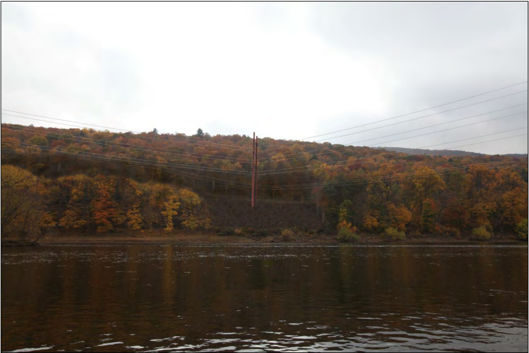
FIGURE 3-9, PROPOSED