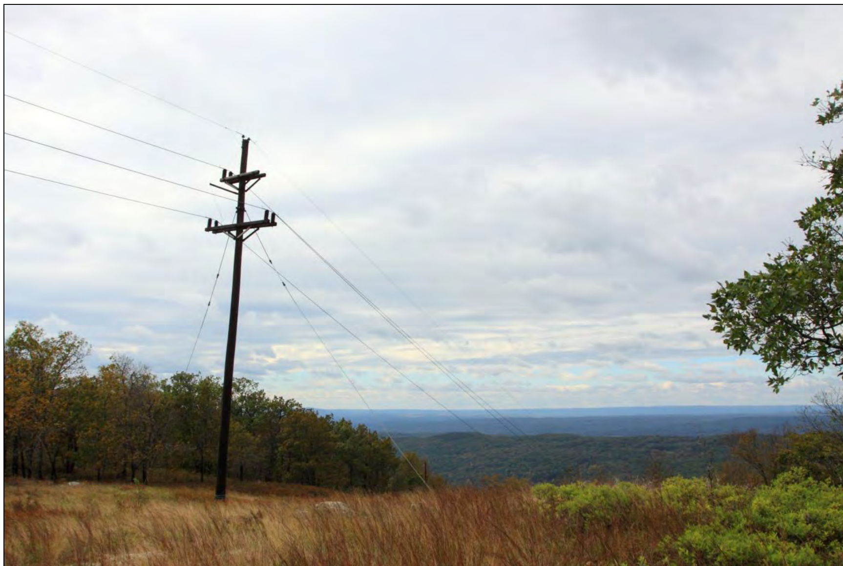
FIGURE 3-13, EXISTING: APPA AT ALTERNATIVE 3 CROSSING