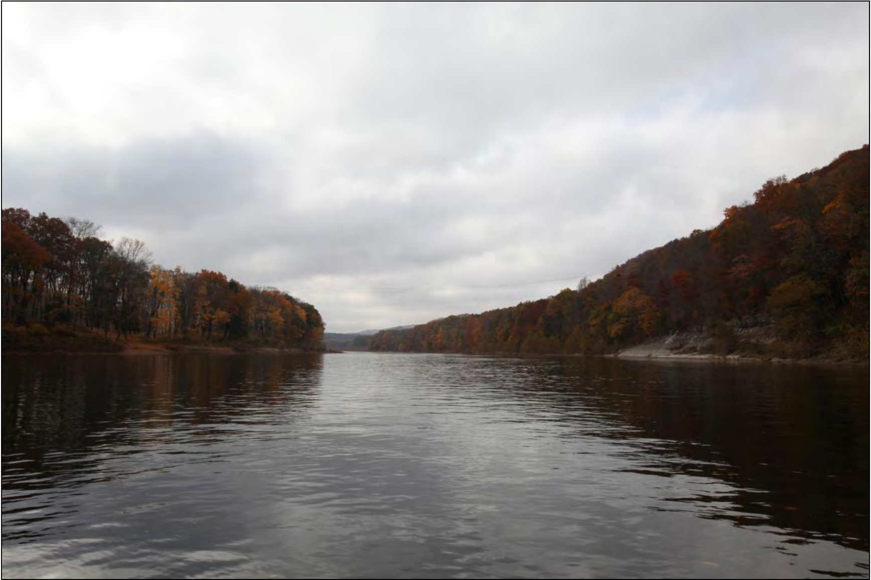
FIGURE 2B-3, EXISTING: MDSR AT ALTERNATIVE 2B CROSSING