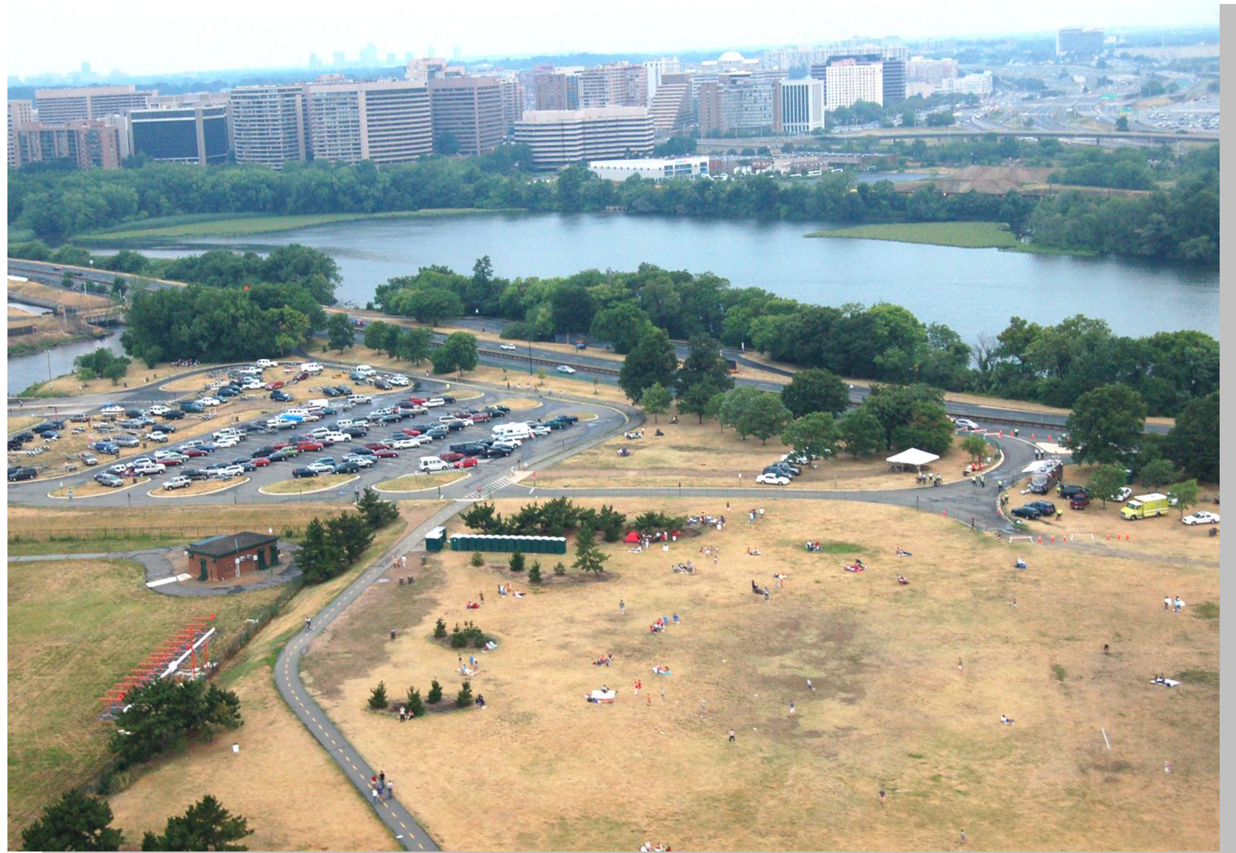
Aerial photo of Gravelly Point and Roaches Run Waterfowl Sanctuary

The purpose of this project is to: enhance visitor experience; improve traffic operations; accommodate recreational user groups; improve park infrastructure; and enhance the safety of pedestrians, motorists, and cyclists in the study area that includes Gravelly Point, Roaches Run