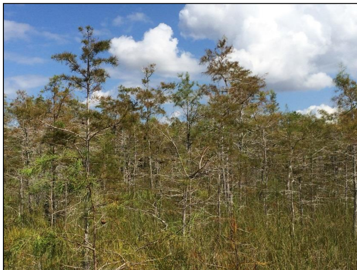
Figure 22: Cypress Forest