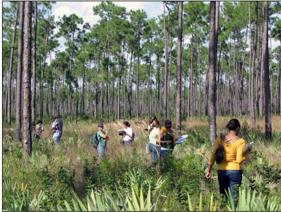
Figure 25: College Students learn about fire ecology and its role in the Everglades Ecosystem