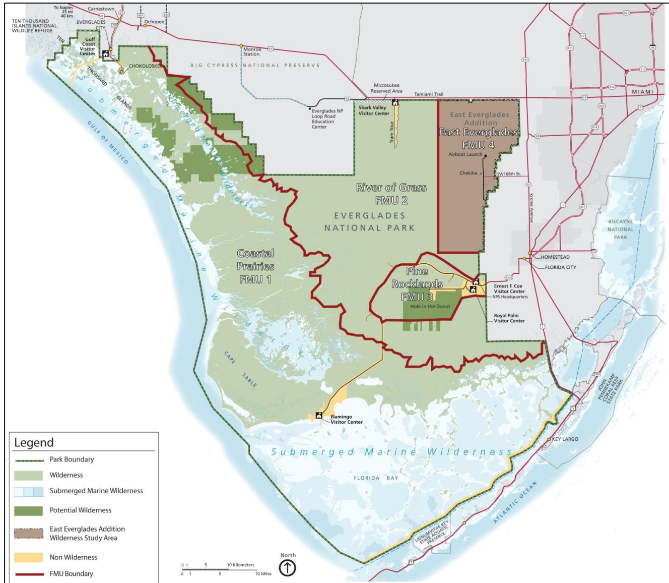
Figure 24: Wilderness Areas within the Fire Management Units