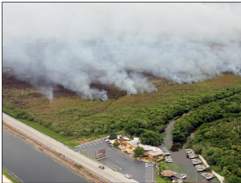
Figure 26: National Park Service Response to a Lightning-Ignited Fire Within a Wildland Urban Interface Near the Northern Boundary of the Park

The Miccosukee Reserved Area, the 8.5-Square Mile Area, and the Pine Island and park headquarters complex are identified as wildland urban interface communities at risk due to the location of the communities in the vicinity of federal lands at high risk from wildfire (GPO 2001). Other park infrastructures potentially at risk from wildfire are located in Long Pine Key, Flamingo, East Everglades, and Shark Valley.