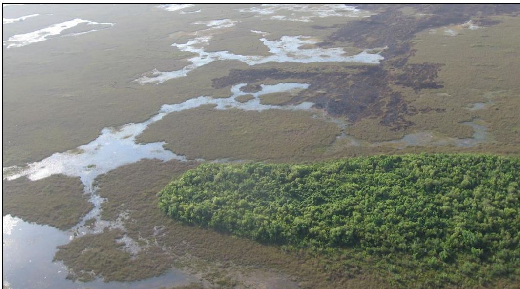
Figure 21: Tree Island (Aerial View)

Under natural conditions, hardwood hammocks rarely burn. The historical fire return intervals for hardwood hammocks are not well known because hammocks are generally fire resistant and burn only during severe drought conditions when the soil moisture is low. Dry-season ground fires may burn the organic soil down to bedrock, killing all vegetation. Due to loss of hammocks in developed areas outside the park, those remaining in the park are of special importance. Wildfires have caused a substantial loss in the size and number of individual tree islands within the park over the last 50-100 years. Consequently, hammocks and tree islands in the park may require fire protection even from natural fire events. Many plants within hardwood hammocks are not fire-adapted and will be susceptible to fire.