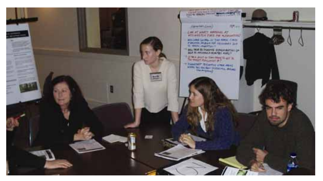
Over 150 members of the public participated in meetings to identify deer management alternatives in September 2007.

The Draft plan/EIS was released for a 60-day review and comment period from December 19, 2008 to February 17, 2009. Another set of public meetings was held January 14-15, 2009. The meetings were held in the same locations and format as the previous meetings. During the 2009 meetings, the NPS presented the alternatives analyzed in the plan/EIS and identified the preferred alternative. Attendees were then divided into small groups where they discussed the proposed alternatives with NPS staff and their consultants. Public comments were recorded on flipcharts and later transcribed for further analysis. Additional comments were received through official public comment forms. All comments submitted on the Draft plan/EIS were carefully reviewed and entered into PEPC for analysis. The analysis of the comments received and NPS responses is provided as Appendix F of this Final plan/EIS.