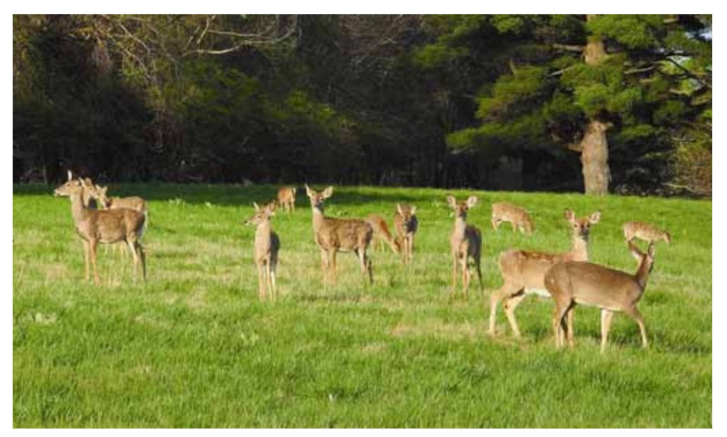
Herds of 25 or more deer are commonly observed during spring compartment counts.