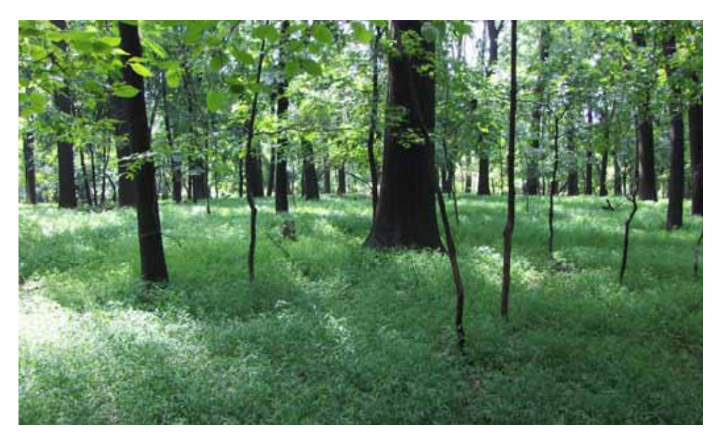
As native species are removed from the forest understory, aggressive nonnative species, such as Japanese stiltgrass ( Microstegium vimineum ), have taken over the forest floor. This species represents very poor habitat for deer and other wildlife.

(Randall 1996). The nonnative problem is particularly acute in urban parklands where extensive forest fragmentation and creation of "edge" environments, frequent human disturbance, and high deer densities enhance opportunities for invasive, nonnative plants to become established (NPS 2004a).