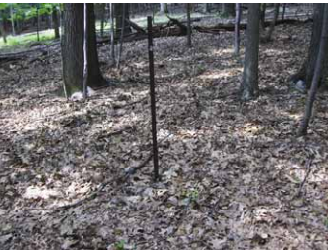
After 10 years, 30% of fenced monitoring plots in park forests have an acceptable level of tree regeneration. No tree regeneration has been observed in unfenced plots since 1995.