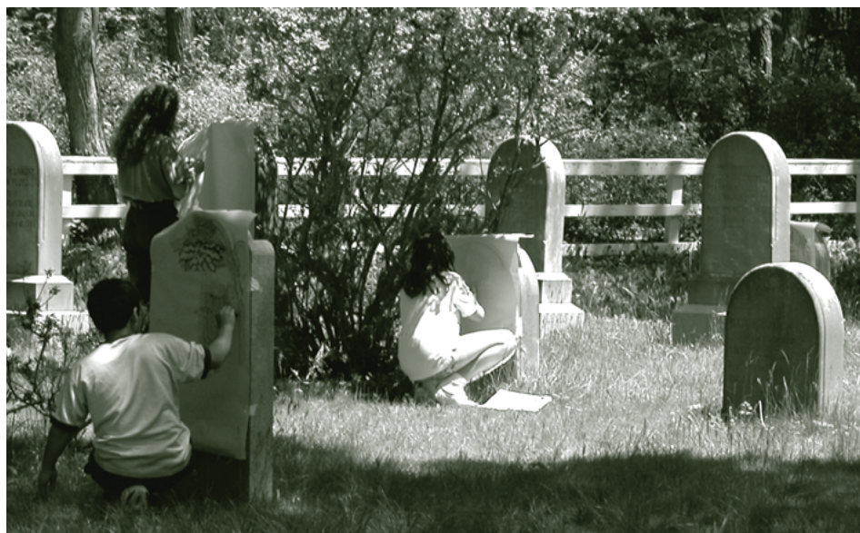
Eight generations of Floyds are buried in the family cemetery.

Improvements to the parking and circulation system at the Estate would be of long-term benefit relative to transportation and access to the site. The rehabilitation of the cultural landscape and historic structures as well as improvements to visitor facilities and visitor programming could result in expanded visitor use and enhanced visitor experience. Greater visitation would have a beneficial effect on the regional economy.