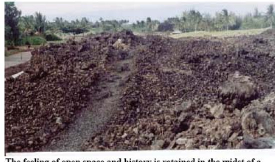
The feeling of open space and history is retained in the midst of a major resort when wider, natural buffers are present.