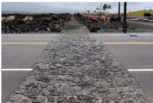
This is the preferred surface treatment. It mimics the authentic, historic surface while enabling road use.

The number and width of breaches should be minimized. The original location of the trail should be restored within the breach, using materials that mimic the historic trail surface. In this manner the breached section will be connected to the original trail on either side. Review of planned breaches by the Council is recommended. Planners and developers are encouraged to request time on Council agendas for that purpose.