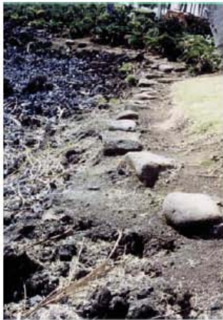
Wave action has eroded the soil around the 'alā stepping stones.

When the trail is located in an area vulnerable to potential erosion, provisions for trail relocation in the event of trail erosion should be included in all trail-related agreements and approvals. This is in order to ensure that the negotiated trail will be usable forever. Water diversion techniques, i.e. waterbars, may need to be employed if water runoff is occurring or potential for soil erosion is present. Information on “Best Management Practices” (BMPs) to prevent or correct erosion problems is available through Nā Ala Hele.