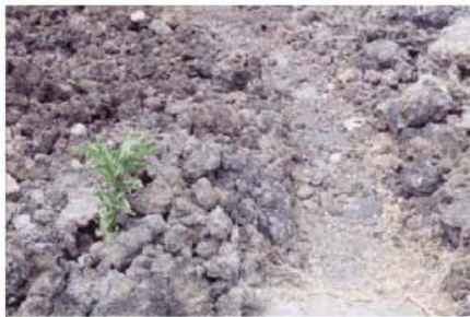
Native plants such as noni sprout on their own.

In most instances, it is better to retain the existing vegetation, especially plants that provide shade. It is preferred that no landscaping be done within trail buffers unless the plants chosen are native to the area. The trail itself should be kept clear of vegetation.