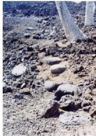
Trail has become unusable in sections.