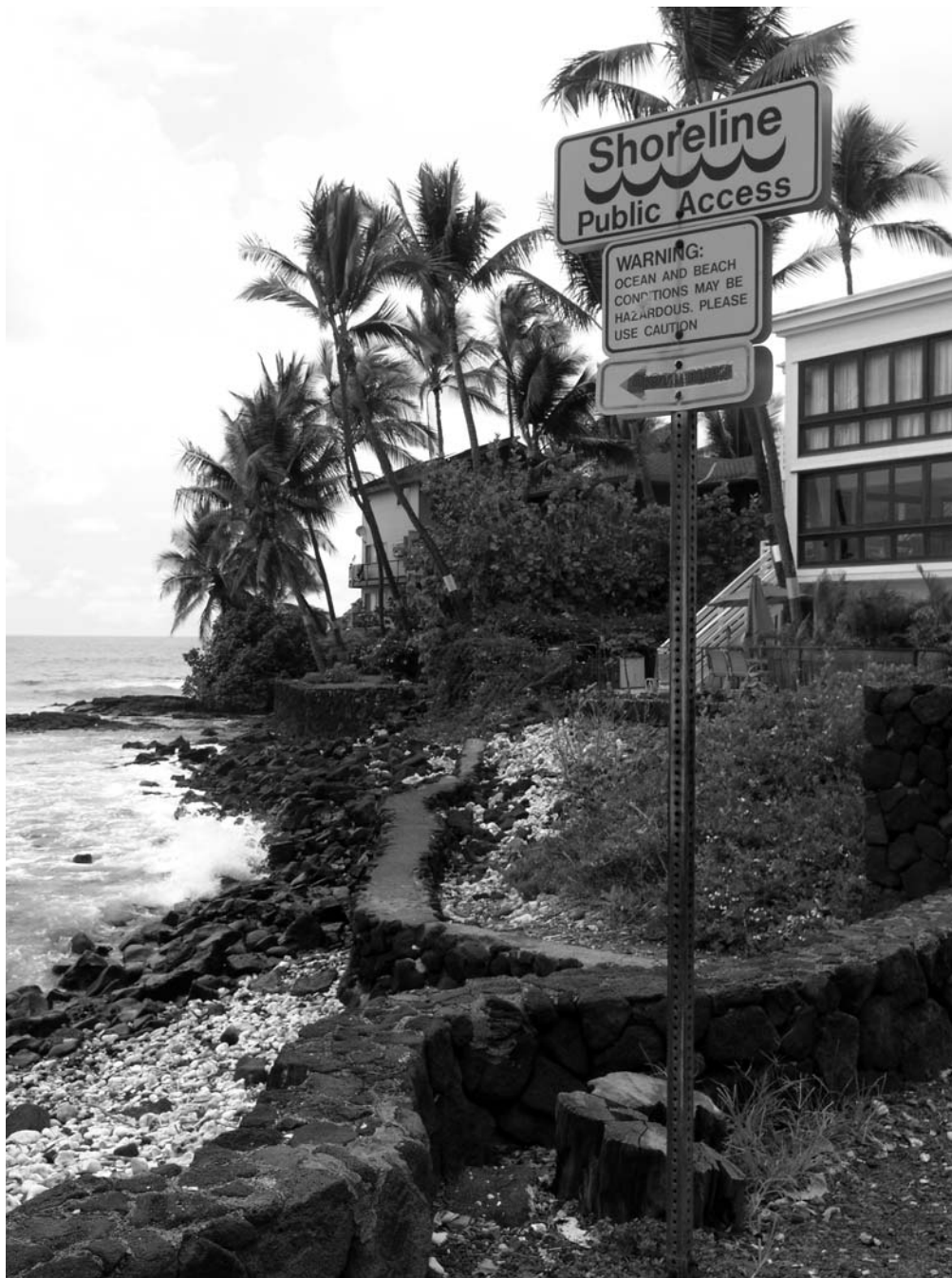
Shoreline Access Sign, Kailua-Kona, N. Kona