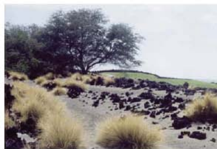
The wild kiawe can be a welcome contrast to the manicured golf course.