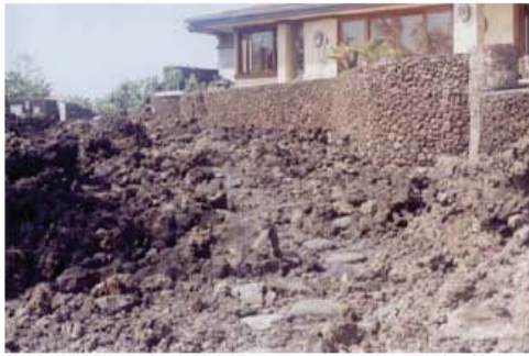
Although 15 ft. from the trail's center line, the rockwall and house dominate. There is little historic ambiance here.

Buffer widths vary. There are no standard widths. The council prefers widths of more than 15 ft., as measured from the trail's outside edges. This also applies to relocated and restored trails. Buffer widths are determined on a case-by-case basis and consideration is given to the archaeological integrity of the subject trail, surrounding environment, land uses, land ownership, and nearby natural and cultural features. The Council should be consulted early in the planning process.