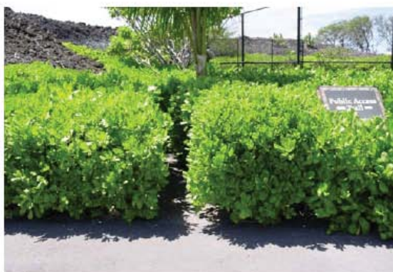
Naupaka is encroaching into the trail, making it impassable by more than one person at a time.