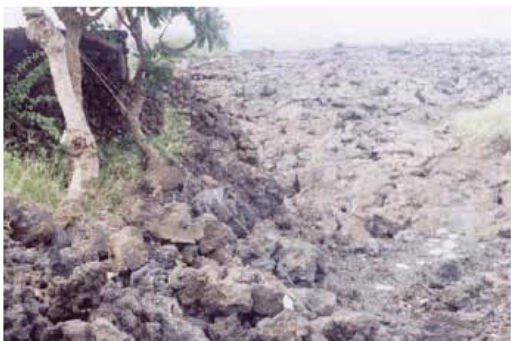
Guy wires were used to keep the plumeria tree from falling into the trail.

Plant surveys done prior to the area's development can help to identify naturally occurring plants. Council members may be able to suggest resource people and sources for native plant materials.