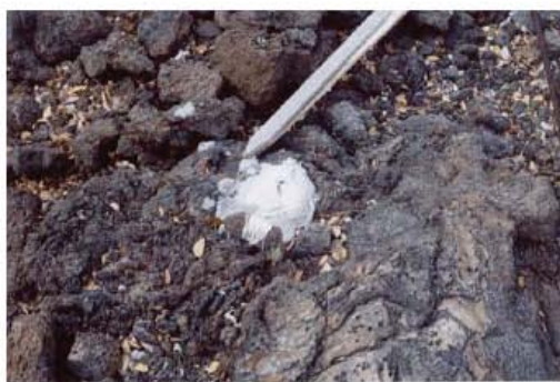
Property markers of various types are commonly found in historic trails and walls. This one is secured with cement within a historic trail. Such practices deface historic sites.