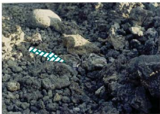
Note the property pin set into the historic trail.

It is essential to educate people about the significance of and proper behavior around trails and sensitive sites nearby. Signage can be effective in this regard. Interpretive signage planned for trails and adjacent sites should be reviewed by the Council. Check if standardized signage has been adopted for the particular area.