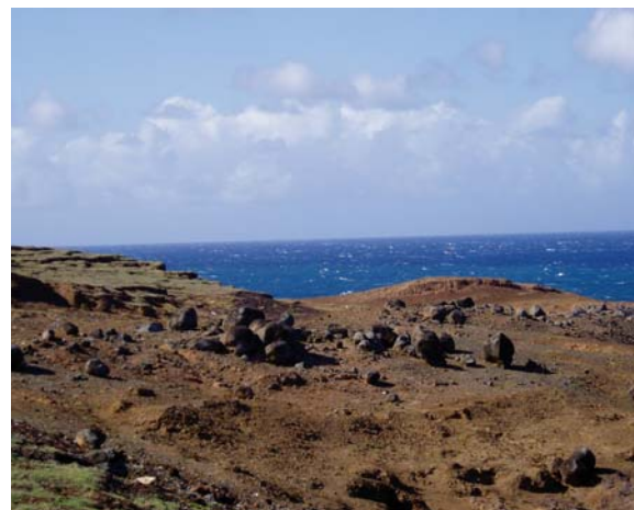
'Upolu, N. Kohala

These multiple alignments would occur on public lands only, unless a private landowner expressed an interest in recognizing more than a single linear Ala Kahakai NHT. Canoe landings that reflect the traditional use of canoes in long-distance travel would be included, as feasible. In