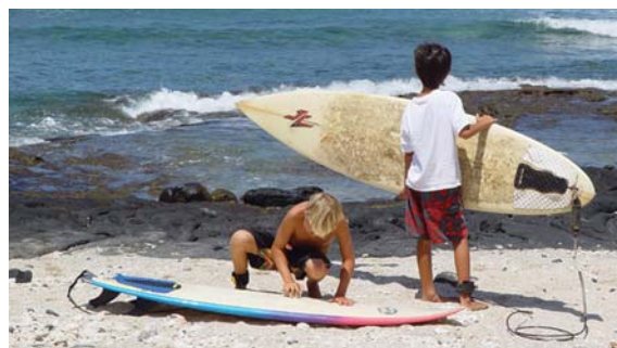
Young Surfers at "Pine Trees", Kohanaiki, N. Kona, NPS photo