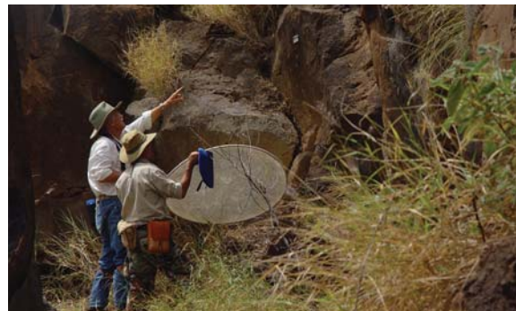
Petroglyph Recording, S. Kohala