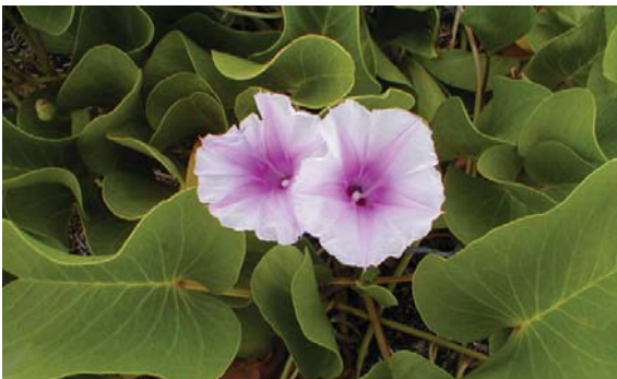
Pōhuehue or Beach Morning Glory