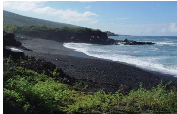
"Pebble Beach", Kaohe, S. Kona