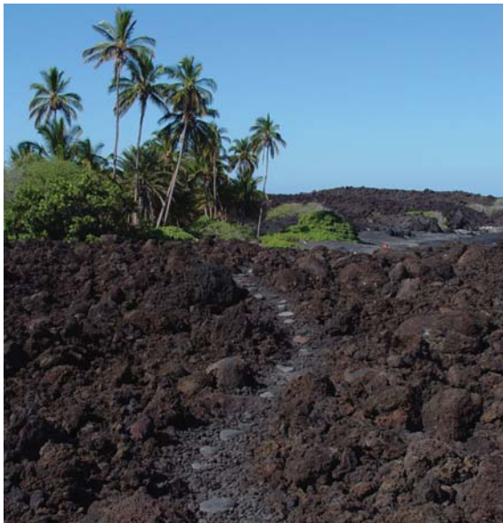
Luahinewai, N. Kona

Owners of private lands and managers of public land have suffered the effects of trespassing, vandalism, unauthorized off-road vehicle use, theft, littering, and illegal dumping due to open and largely unregulated access along and to the shoreline. In some cases, coastal resources such as 'opihi (limpet), limu (seaweeds), fish, stones, sand, wood, and plant materials have been depleted. Access where immediate trail oversight is not present has led to over-harvesting of resources and inappropriate dumping of solid waste in coastal and other areas.