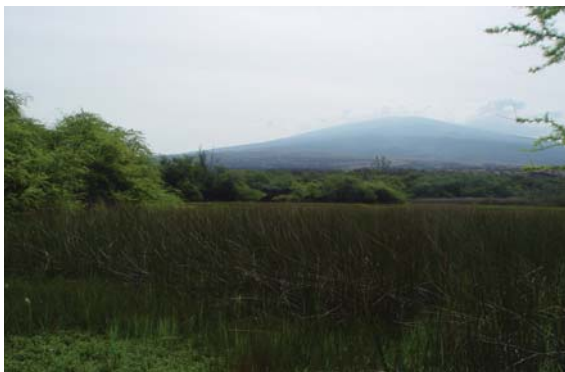
‘Ōpae‘ula Pond, Makalawena, N. Kona