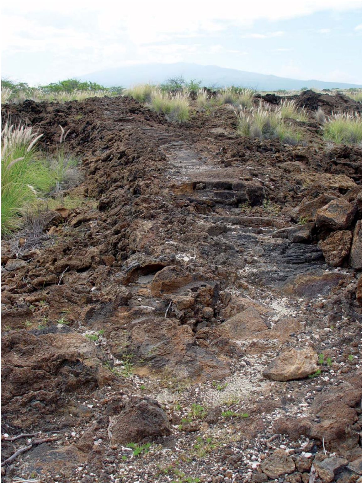
Manini'owali, N. Kona, NPS photo