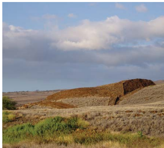
Pu'ukoholā Heiau NHS, S. Kohala

Native Hawaiians have deep concern for protection of natural and cultural resources, which are one and the same to them. For them, the trail is a part of a way of life. It includes not only the pathway but also the network of resources beside the trail. They are concerned that increased public access and use could impact areas of deep spiritual significance and their use of these areas to practice their cultural traditions. They also have concerns for the effect of federal administration of the trail on their gathering and subsistence rights under Hawaiian state law.