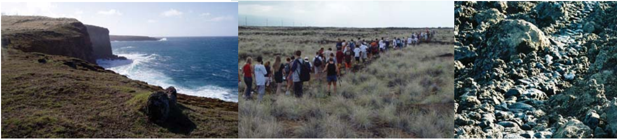
From left: 'Upolu, N. Kohala, NPS photo; Trail Clearing, Kealakehe HighSchool, O'oma, N. Kona, NPS photo; and Ancient Trail, Kapu'a, S. Kona, E. Kalani Flores

The National Park Service (NPS) administers the Ala Kahakai National Historic Trail (NHT), added to the National Trails System by the U.S. Congress on November 13, 2000. The legislation authorizing the Ala Kahakai NHT identifies an approximately 175-mile portion of prehistoric ala loa (long trail) and other trails on or parallel to the seacoast extending from 'Upolu Point on the north tip of Hawai'i Island down the west coast of the island around South Point to the east boundary of Hawaii Volcanoes National Park. The Ala Kahakai National Historic Trail combines surviving elements of the ancient ala loa 1 with segments of later alanui aupuni , which developed on or parallel to the traditional routes, and more recent pathways and roads that created links between the historic segments.