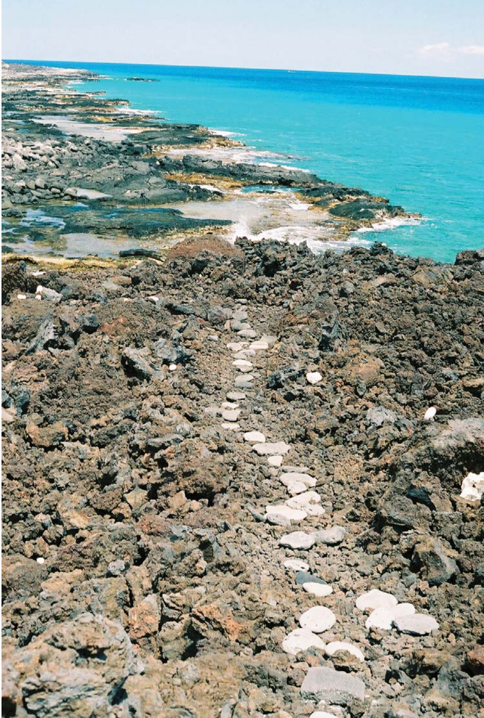
1800 Lava Flow, Kalae Mano, N. Kona