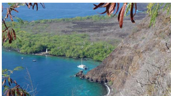
Ka'awaloa, S. Kona