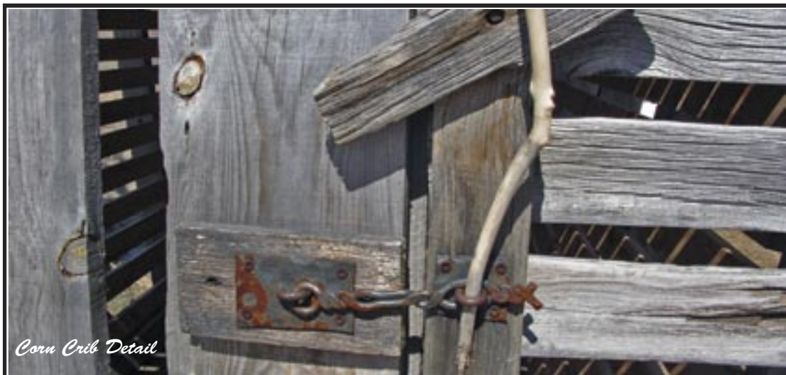
Corn Crib Detail