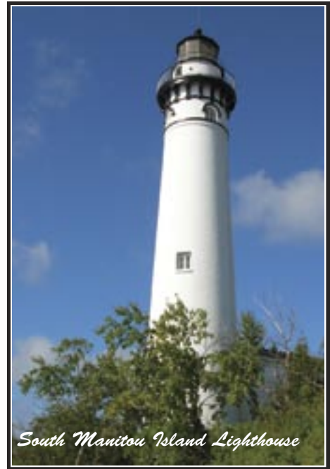
South Manitou Island Lighthouse